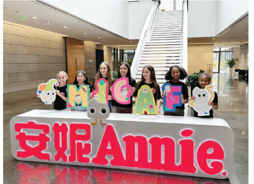
The show's little actors pose with the alphabet cards for the 1st Macao International Children's Arts Festival, after the event.