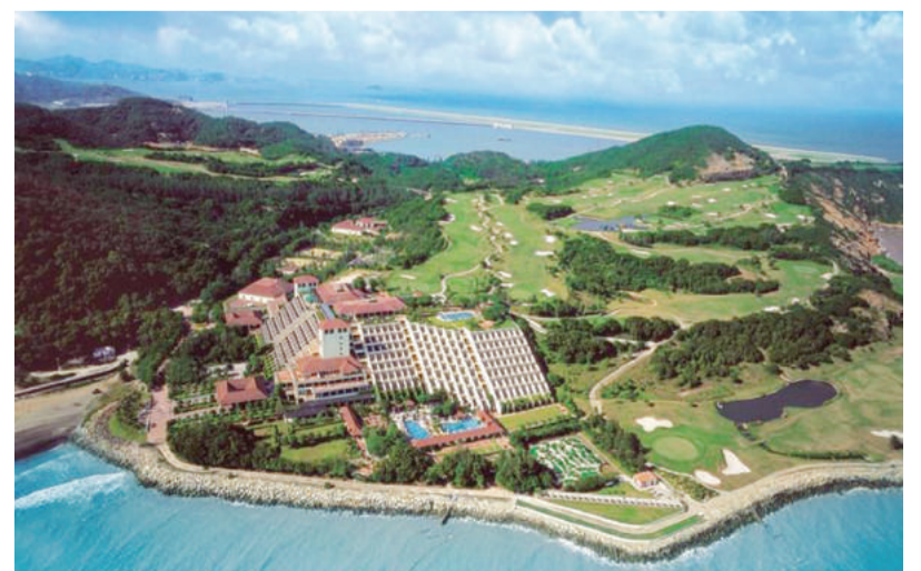
Undated file photo of Grand Coloane Resort

In June, the hotel industry recorded 1.14 million guests, up by 0.4 percent year on year. ■