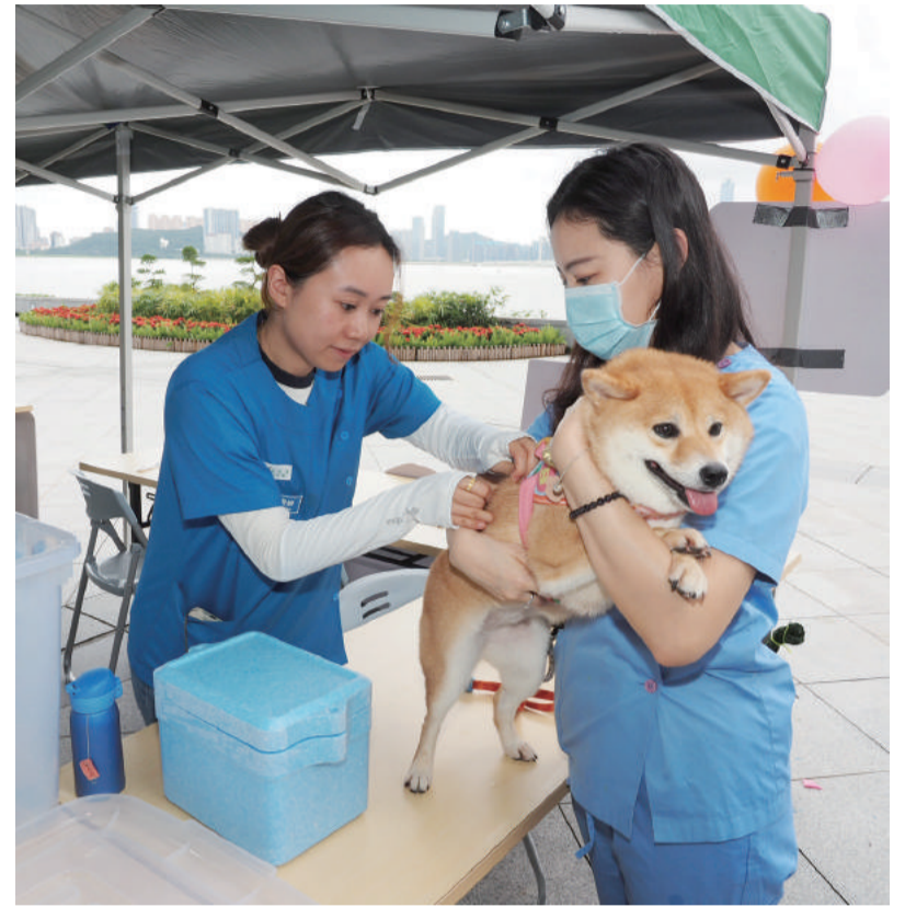
This undated handout photo provided by the Municipal Affairs Bureau (IAM) yesterday shows a “Pet Preparatory Class – Pet Information Station” event earlier this year.

According to the statement, the event on August 31 will include a tour of the kennels, enabling prospective adopters to interact with the dogs and cats up for adoption. Details of the event can be checked on the bureau’s Macau Animal Health Control Website ( https://www.iam.gov.mo/canil ). ■