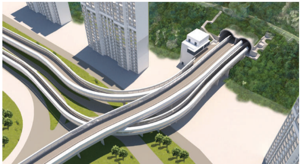
These two artist's renditions downloaded from the Public Works Bureau's (DSOP) website yesterday show the future Big Taipa Hill Tunnel at its north (left) and south sides respectively.