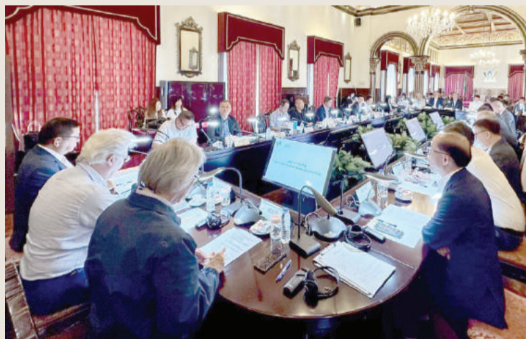
Municipal Affairs Bureau (IAM) Consultative Committee members meet yesterday at the IAM headquarters on Avenida de Almeida Ribeiro.

Wong suggested stepping up inspections of food products imported from neighbouring regions that have shown frequent food safety problems, especially prepacked and processed foods, as well as strengthening cooperation with food safety authorities in neighbouring regions, and conducting a study on the convergence of rules and regulations on food safety management in the Greater Bay Area (GBA). ■