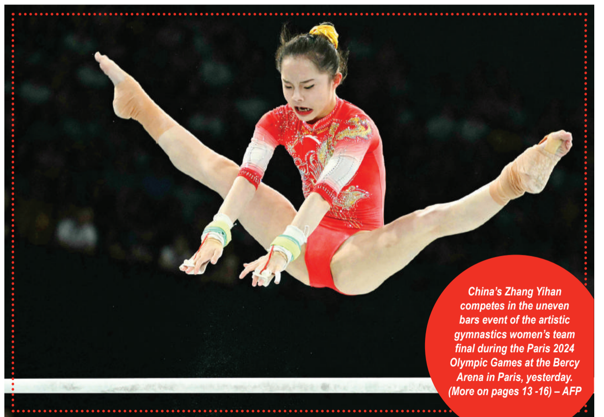
China's Zhang Yihan competes in the uneven bars event of the artistic gymnastics women's team final during the Paris 2024 Olympic Games at the Bercy Arena in Paris, yesterday. (More on pages 13-16)

Macau's best-selling English-language newspaper — Your trusted source for real news : accurate, balanced and concise The Macau Post Daily