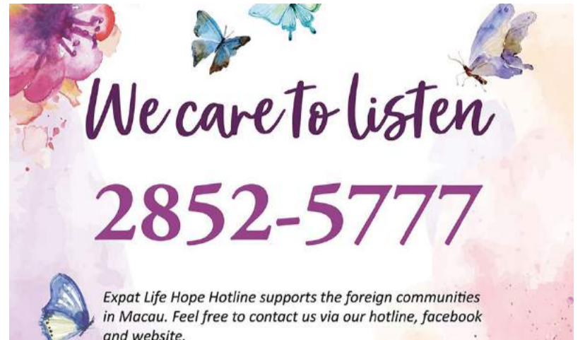
This poster from the Caritas Macau website shows its Expat Life Hope Hotline 2852 5777 for Macau’s non-Chinese speaking communities.

The statements noted that the accessibility of mental health services in Macau is high, and residents can make appointments for the use of mental health services, without the need for referrals, at