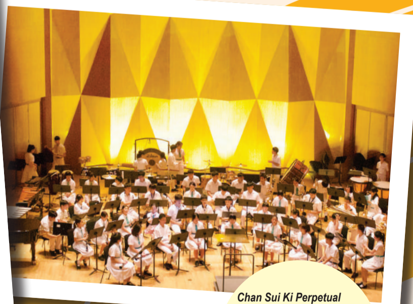
Chan Sui Ki Perpetual Help College Wind Band performs on Monday at Tsuen Wan Town Hall Auditorium in Hong Kong.