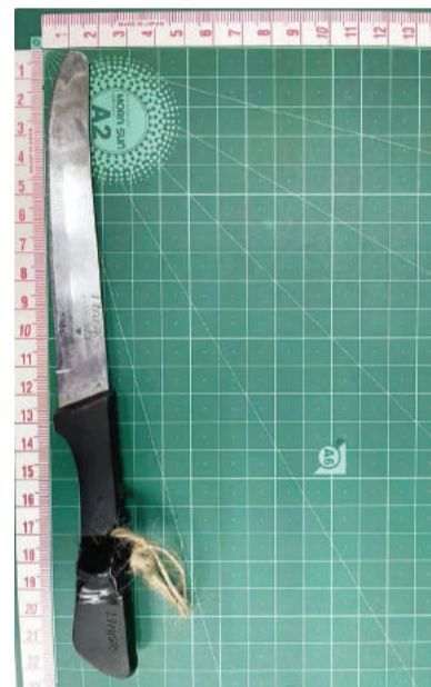
This undated handout photo provided by the Public Security Police (PSP) yesterday shows the fruit knife used by the local suspect.

The police arrested Wong in the neighbourhood 10 minutes after the incident. Under questioning, Wong admitted to intimidating the café owner because of what he considered