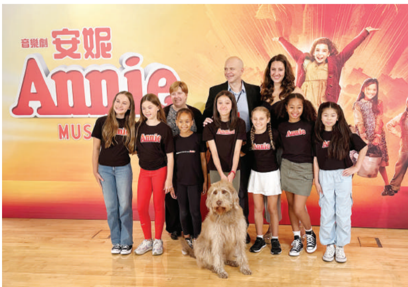
Members of the show's production team, including canine performer Kevin (front), pose after yesterday's event.