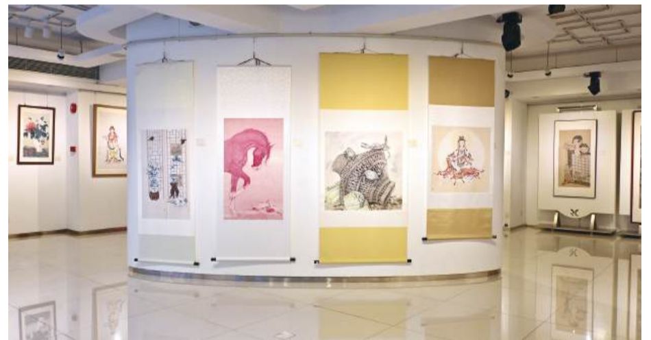
This photo shows some of the “gongbi” works currently on display at the Rui Cunha Foundation Gallery (FRC).