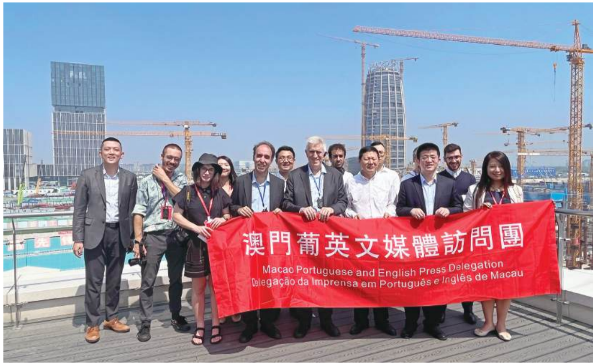
Delegation members of Macau's Portuguese- and English- language media, as well as mainland officials, pose for a group photo at Xiong'an New Area's East-West Axis Dispatch and Command Centre in Xiong'an on Friday.

Xiong'an New Area covers the counties of Xiong, Rongcheng and Anxin in the Beijing-Tianjin-Hebei economic development triangle. Its name is a compound of the three counties' name. The counties' farmers have been provided with generous resettlement packages, including spacious flats in purpose-built high-rises in the area, senior officials told us during the visit. Currently, Xiong'an has some 1.5 million residents, or more than