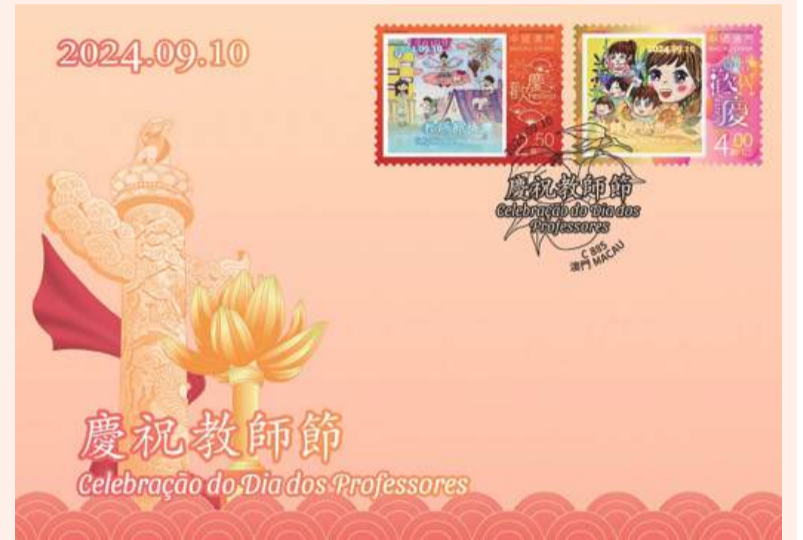
This image provided by the Macao Post and Telecommunications Bureau (CTT) yesterday shows the commemorative envelope for the “Celebration of Teachers' Day”.

The statement added that commemorative envelopes with stamps and cancellations will also be distributed on the day. ■