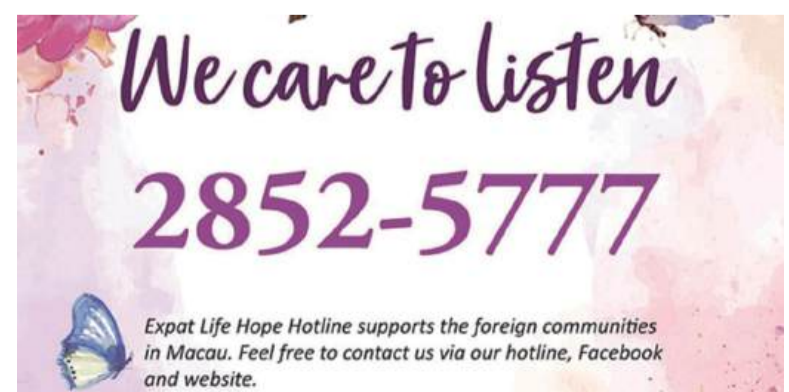
This poster from the Caritas Macau website shows its Expat Life Hope Hotline 2852 5777 for Macau's non-Chinese speaking communities.

The case has initially been classified as a dead body found, the statement said. ■