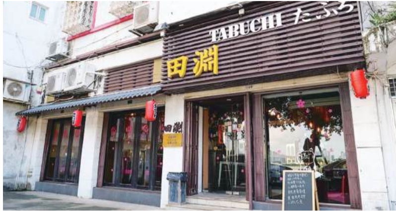
This undated handout photo downloaded from the Macau Government Tourism Office (MGTO) website shows the izakaya (Japanese style pub) called “田淵” on Avenida da República in Sai Van.

In addition, the bureau also announced in a separate statement on Sunday that it had launched an