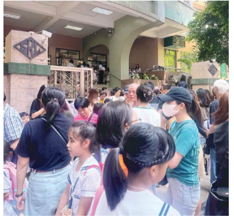
Students and their parents crowd the entrance to Santa Rosa School (Chinese Section) in Zape yesterday, the first day of the 2024/2025 academic year.