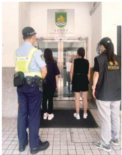
This undated photo provided by the Public Security Police (PSP) yesterday shows PSP officers escorting the two female theft-by-finding suspects to a police station in Taipa.

According to Lam, a local man reported to the police on August 26