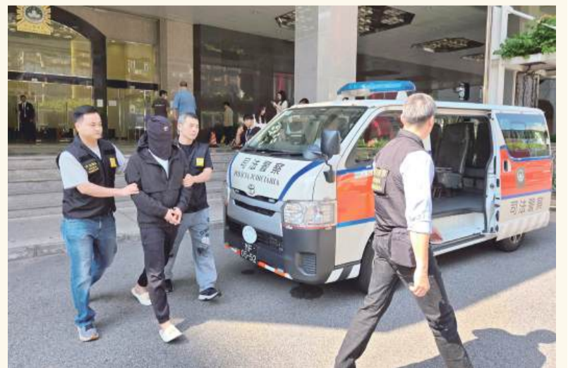
Judiciary Police (PJ) officers escort the hooded robbery suspect to a police vehicle outside the PJ headquarters in Zape yesterday.