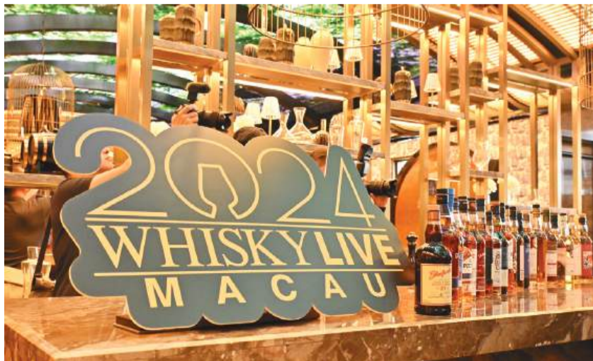
A banner and bottles promoting the inaugural Whisky Live Macau 2024 event slated to take place next month are displayed at Grand Lisboa Palace (GLP) in Cotai yesterday.

More details and ticketing can be found on https://www.whiskylivemacau.com/ticketing/ . ■