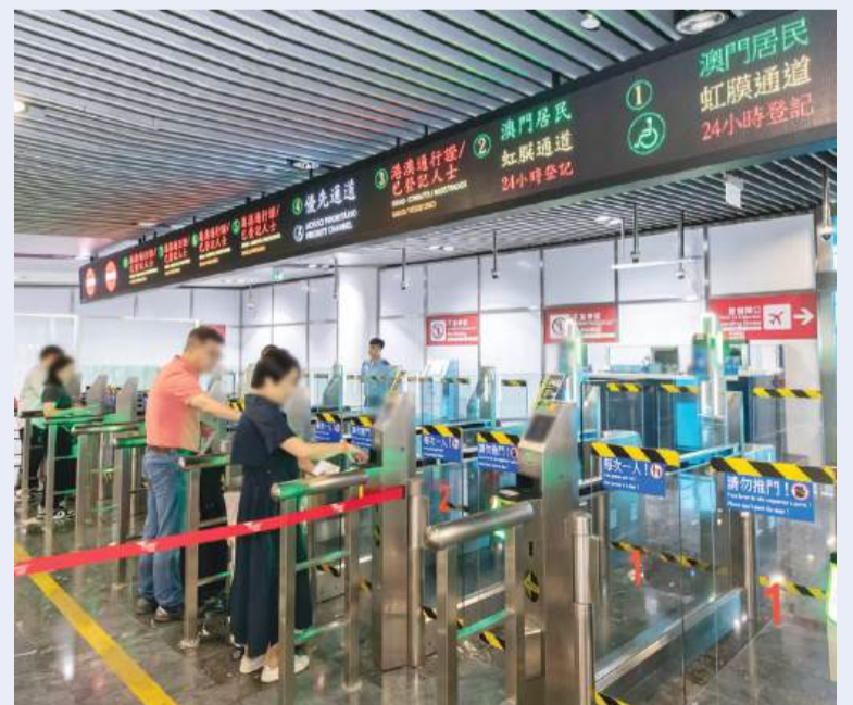
This undated pixilated handout photo provided by the Public Security Police (PSP) on Friday shows passengers at the airport's digitalised immigration checkpoint.

The statement underlined that Public Security Police will, by upholding the concept of "people-orientated, reform and innovation, technology-enabled and continuous enhancement", develop quality immigration services and measures to enhance inspection efficiency and facilitate border crossings, with a view to fostering people-to-people exchanges between China and the rest of the world, and contributing to the high-quality development of Hong Kong and Macau, as well as elsewhere in the Guangdong-Hong Kong-Macau Greater Bay Area (GBA). ■