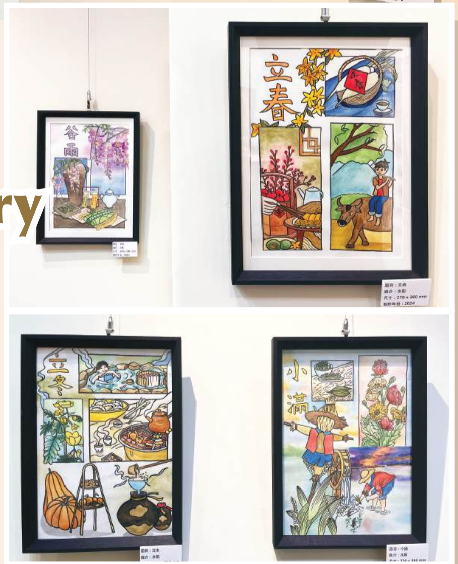
題目：立春 媒介：水彩 尺寸：270 x 380 mm 創作年份：2024

**According to Wikipedia, the Catholic school is one of the oldest educational institutions founded in Macau.