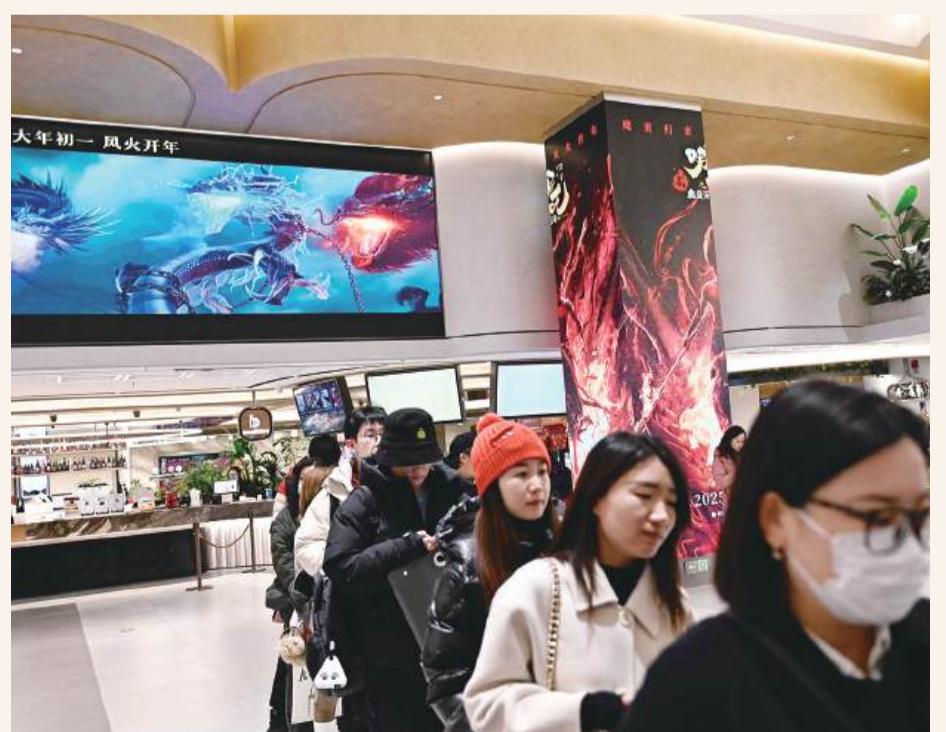
People queue as a screen shows scenes from the animated film Ne Zha 2 at a cinema to watch the blockbuster in Beijing yesterday.