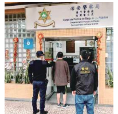
This handout photo provided by the Public Security Police (PSP) on Friday shows the theft suspect being escorted by a PSP officer to a police station in Nam Van district.