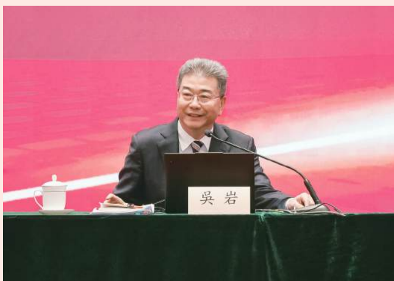
Vice Education Minister Wu Yan delivers a presentation about the Master Plan on Building China into a Leading Country in Education (2024-2035) at the Forum Macao Complex on Friday.

statement said, Wu presented key points of the master plan as well as President Xi Jinping's important speech made at the National Education Conference in Beijing last year, with an analysis of the accelerated evolution of current global transformation on a scale unseen in a century and the