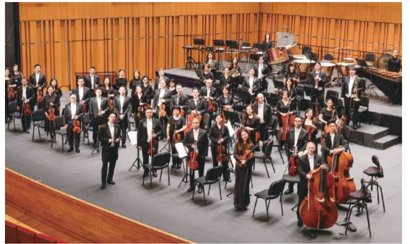
This undated handout photo provided by the Macau Cultural Affairs Bureau (IC) shows the Macao Orchestra (OM) posing.

Brahm's representative works will be performed during the concerts, among which are "Symphony No. 1 in C minor" during the "Night of Grand Premiere", "Symphony No. 2 in D major" on "Romantic Pastoral", and "Piano Concerto No. 1 in D