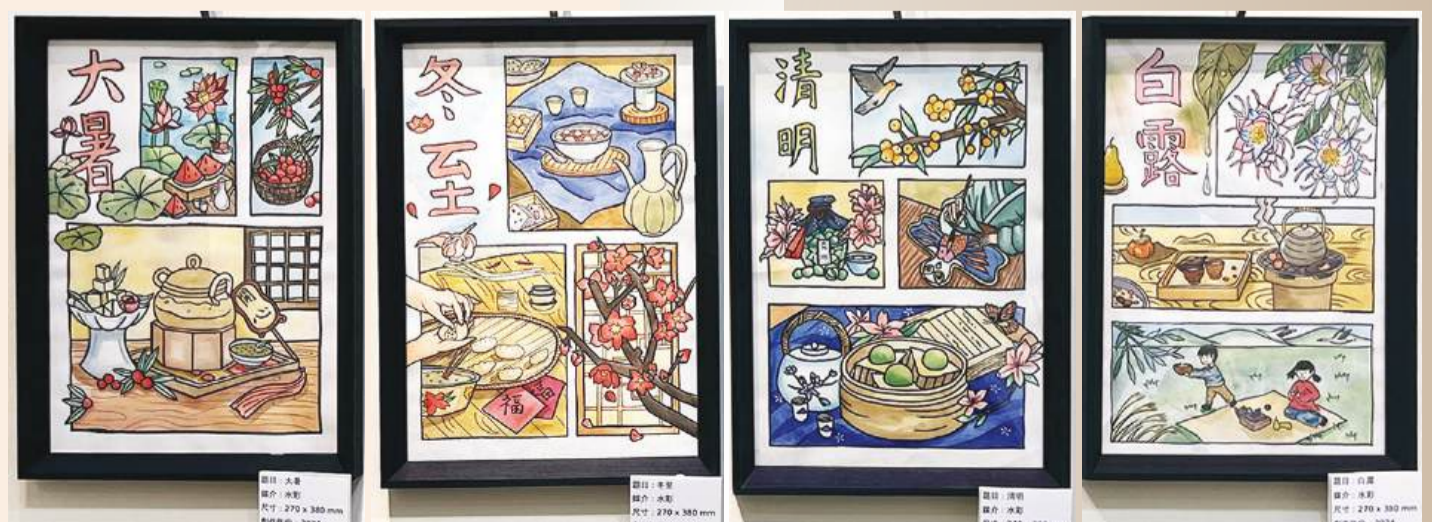
題目：大暑 媒介：水彩 尺寸：270 x 380 mm 創作年份：2024