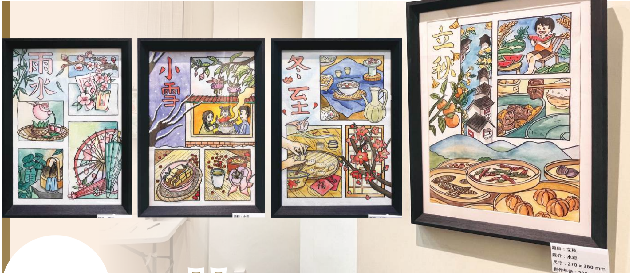
題目：立秋 媒介：水彩 尺寸：270 x 380 mm 創作年份：2024