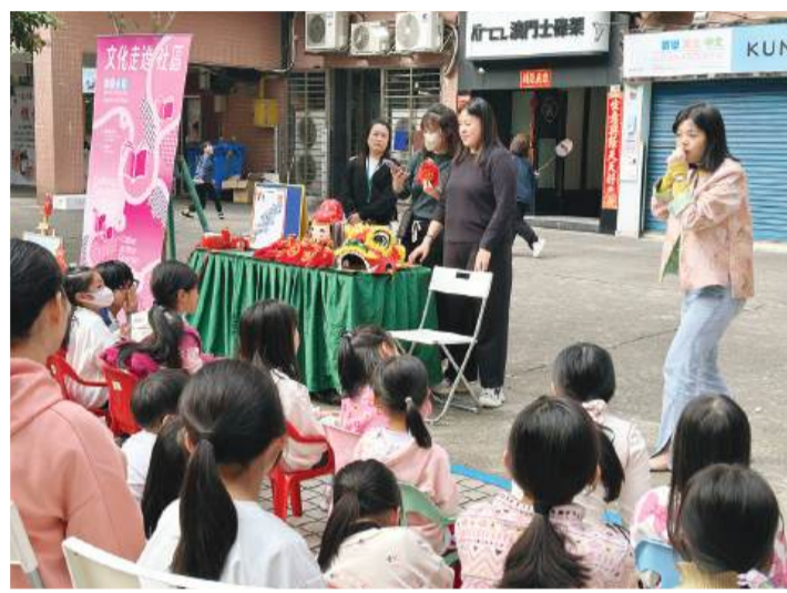
Parents and their kids listen to a music performance and attend a storytelling session at the Cultural Affairs Bureau's (IC) "Culture on Your Doorstep" flash mob in Praça das Orquídeas in Fai Chi Kei district yesterday.