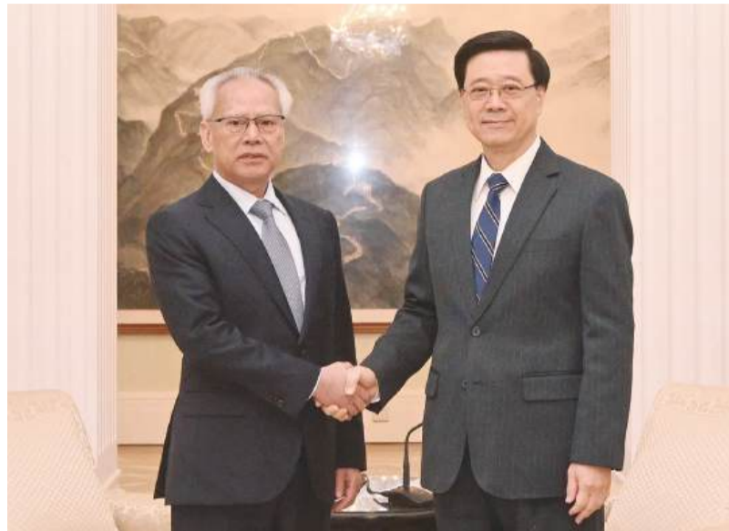
Chief Executive Sam Hou Fai (left) shakes hands with his Hong Kong counterpart John Lee Ka-chiu at Government House in Hong Kong on Friday.

Sam said during the meeting that the various important speeches and instructions made by President Xi Jinping during his inspection visit to Macau in December last year, including his hopes for Macau to promote appropriate economic diversification and to build itself into a platform for higher-standard opening up, has injected new impetus into Hong Kong-Macau cooperation.