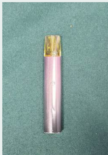
A vape stick containing "space oil" seized at the ferry terminal in Sheung Wan on Hong Kong Island from a ferry passenger arriving from Macau on Saturday is pictured in this handout photo released by the Hong Kong authorities over the weekend.

*According to the Wikipedia, etomidate is a short-acting intravenous anaesthetic agent used for the induction of general anaesthesia and sedation for short procedures such as reduction of dislocated joints, tracheal intubation, cardioversion and electroconvulsive therapy. ■