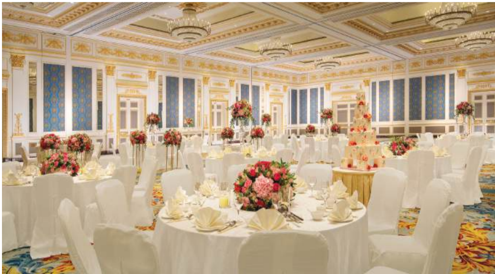
This undated handout photo provided yesterday by The Parisian Macao shows a wedding banquet set up at the Parisian Ballroom in Cotai.

More details can be found on https://en.sandsresortsmacao.com/meetings/event-types/wedding-n-celebrations.html