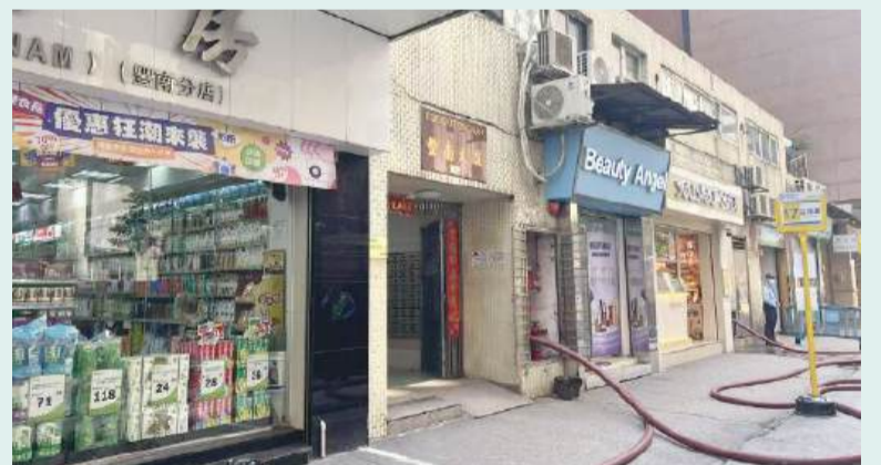
A Public Security Police (PSP) officer watches the area while firefighters battle a blaze in the flat of a residential building in the Barrier Gate area yesterday morning.

According to the bureau, the doorway, wardrobe, and various