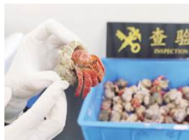
This undated handout photo released by Gongbei customs yesterday shows the seized hermit crabs.

Yesterday's statement said that after technical assessments, Gongbei customs has confirmed that the crabs are all Coenobita perlatus . ■