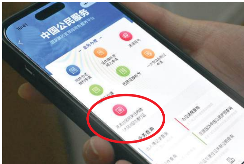
This photo taken last night shows the interface, including its new e-travel function (red circle), of the National Immigration Administration's (NIA) service platform, where residents of Hong Kong, Macau and Taiwan can apply for their temporary electronic travel pass in cases of urgent travel needs.

The NIA underlined the inconvenience caused by the fact that some Hong Kong, Macau and Taiwan residents who hold both