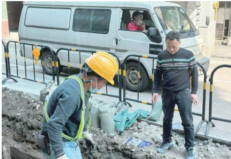
Workers carry out roadworks in a section of Rua do Almirante Sérgio (河邊新街) in the Inner Harbour district on Wednesday.

to the statement, Tam ordered the members of the working group to "strengthen interdepartmental communication and coordination, improve the supervision mechanism, adopt a forward-looking approach, plan roadwork projects and make the necessary preparations in advance, and effectively monitor projects' quality and duration".