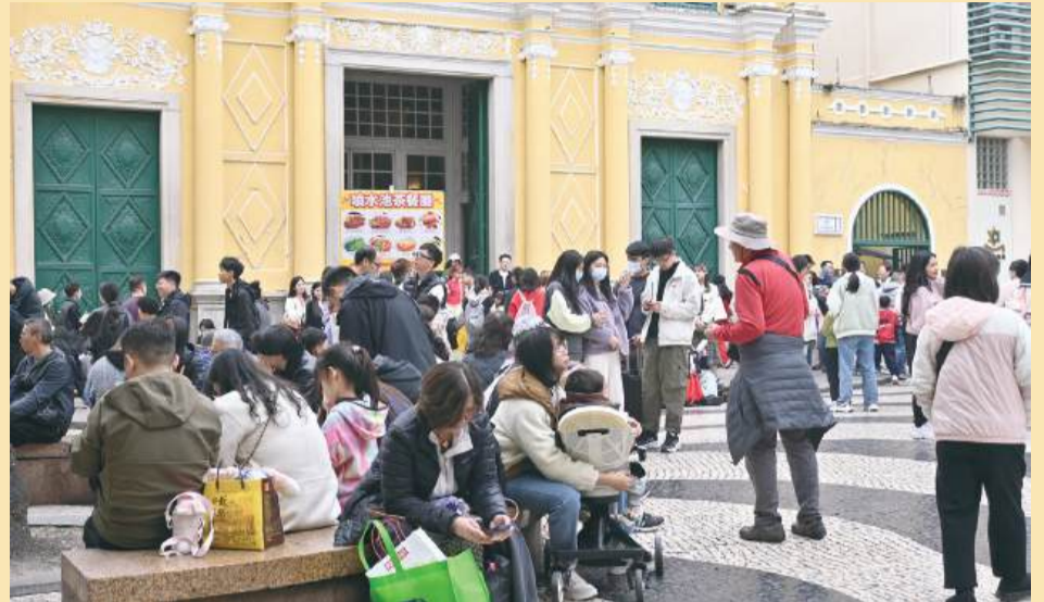
Visitors gather outside S. Domingos Church in the city centre early last month.