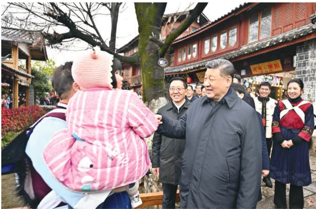
President Xi Jinping, also general secretary of the Communist Party of China (CPC) Central Committee and chairman of the Central Military Commission, greets a toddler while visiting the Old Town of Lijiang in Lijiang City, Yunnan Province, on Wednesday. Xi paid an inspection visit to Yunnan between Wednesday and yesterday. (Story on p.7)