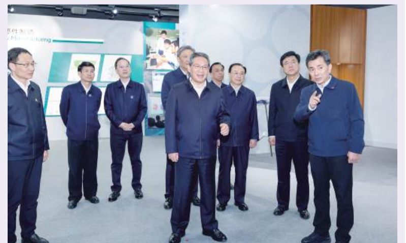
Premier Li Qiang (center), also a member of the Standing Committee of the Political Bureau of the Communist Party of China (CPC) Central Committee, visits Taikoo (Xiamen) Aircraft Engineering Company Limited in Xiamen, Fujian Province, on Wednesday. Li paid an inspection visit to Fujian Province between Tuesday and yesterday.

Noting that private enterprises are China's primary foreign trade entities, Li said governments at all levels must strive to provide improved policy support and a better development environment for private businesses.