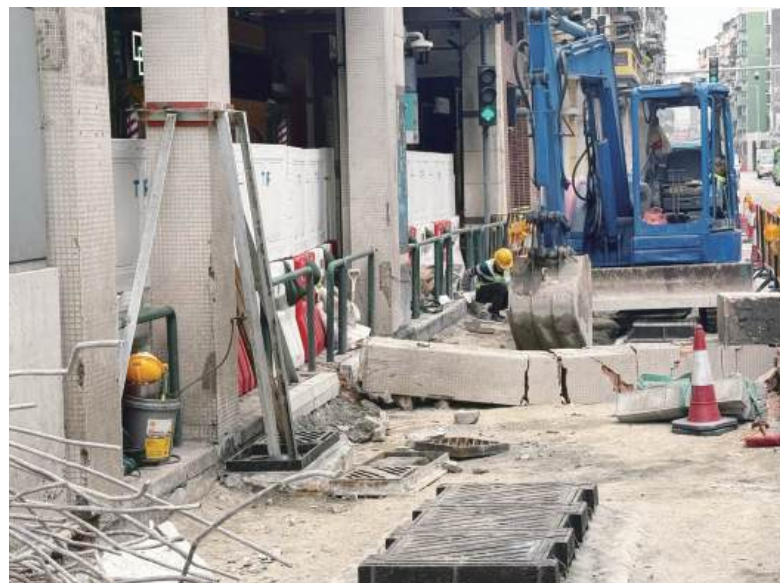
This photo taken yesterday shows the collapsed decorative column on the roadwork site outside the building on Rua do Almirante Sérgio.

The statement said that when workers of the roadwork project were just preparing for concrete