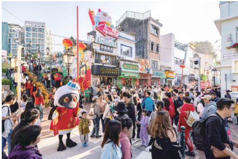
This file photo jointly released by several government entities shows a boy posing for a photo with Macau's tourism mascot Mak Mak among crowds of visitors in the temporarily pedestrianised Taipa Village during this year's Chinese New Year holiday.

It would be the first time for pedestrianisation to be implemented during the mainland's May Day holiday. ■