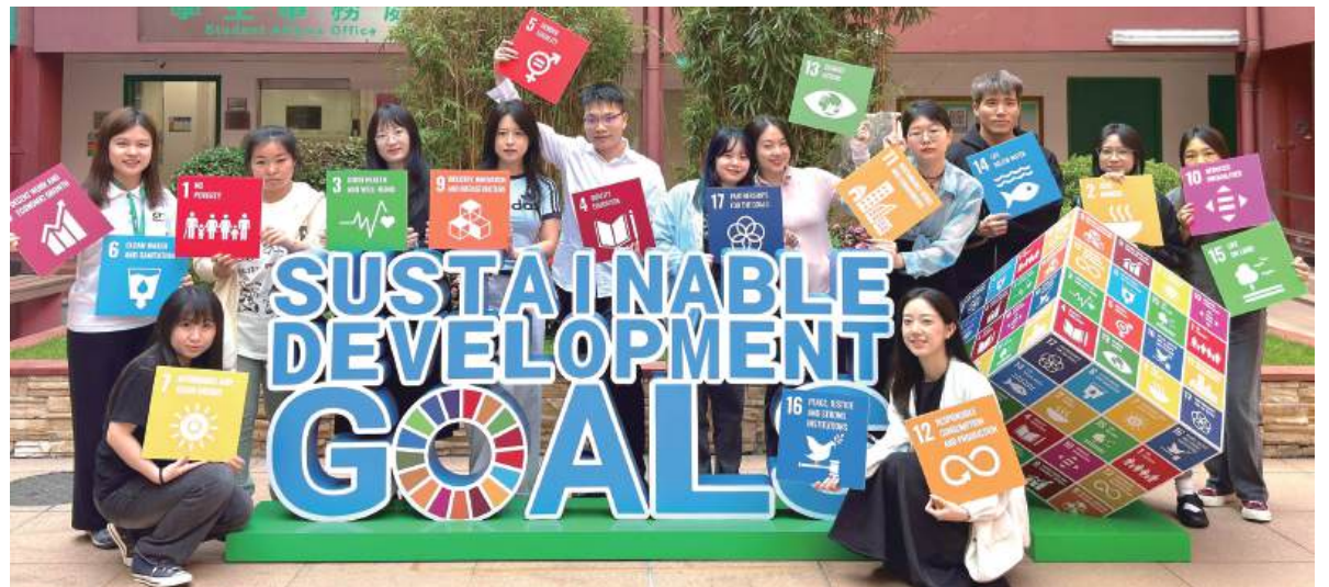
This recent handout photo provided by the Macao Polytechnic University (MPU) yesterday shows MPU students displaying various signs promoting the 17 Sustainable Development Goals (SDGs) set by the UN.

The fair has contributed to ongoing campus discussions on sustainability, part of the university's broader engagement with the UN's development agenda, the statement underlined. Through such efforts, the university hopes to inspire long-term environmental stewardship among students and contribute to global sustainable development. ■