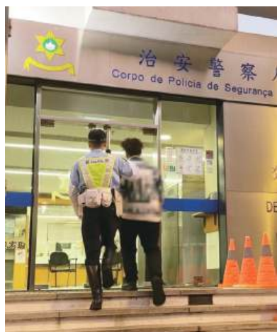
This undated handout photo provided by the Public Security Police (PSP) yesterday shows a PSP officer escorting the dangerous driving suspect into a police station.

Additionally, the police discovered that Fok had no driving