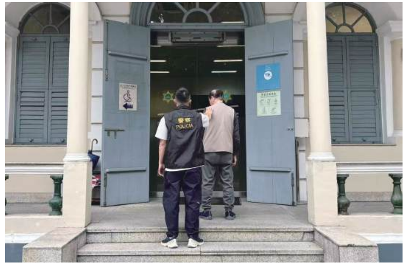
This undated handout photo provided by the Public Security Police (PSP) yesterday shows a PSP officer escorting the sexual harassment suspect into a police station.

Wong has been transferred to the Public Prosecutions Office (MP), where he is facing a charge of sexually harassing a child. ■