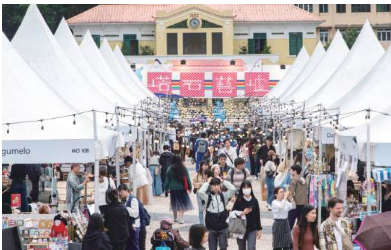
This undated handout photo provided by the Cultural Affairs Bureau (IC) yesterday shows a previous edition of the Tap Siac Craft Market in Spring.

* IFPI stands for the International Federation of the Phonographic Industry. It is a nonprofit organisation that represents the global recording industry, advocating for the rights of music producers and performers. – DeepSeek