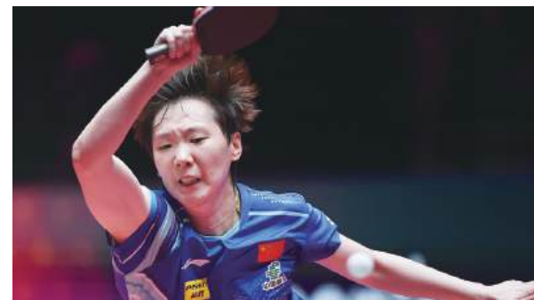
Wang Manyu of China hits a return during the women's singles Round of 16 against Harimoto Miwa of Japan at the ITTF Men's and Women's World Cup 2025 in Macau yesterday.

On the men's side, World No. 2 Wang Chuqin won against Kanak Jha of the United States 4-1, going to