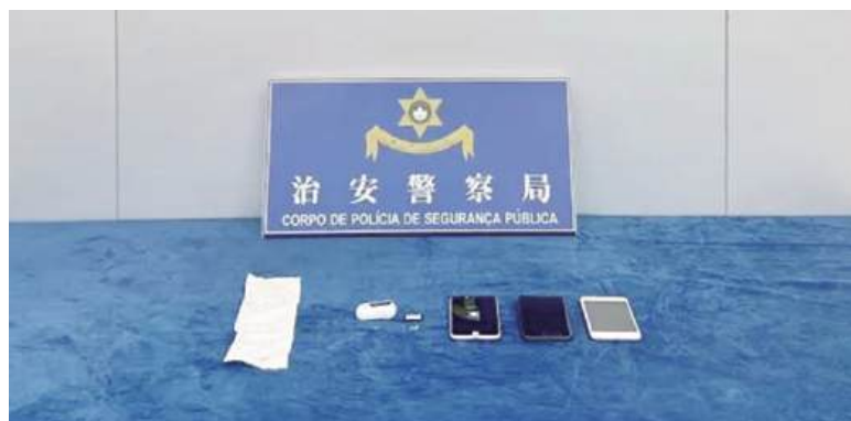
This undated handout photo released by the Public Security Police (PSP) yesterday shows the evidence seized in the Nepalese's case.

The suspect has been transferred to the Public Prosecutions Office (MP) for further questioning. ■