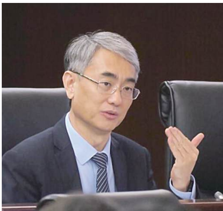
Secretary for Administration and Justice André Cheong Weng Chon gestures while addressing yesterday's Q&A session about his portfolio's 2025 policy guidelines in the Legislative Assembly's (AL) hemicycle.