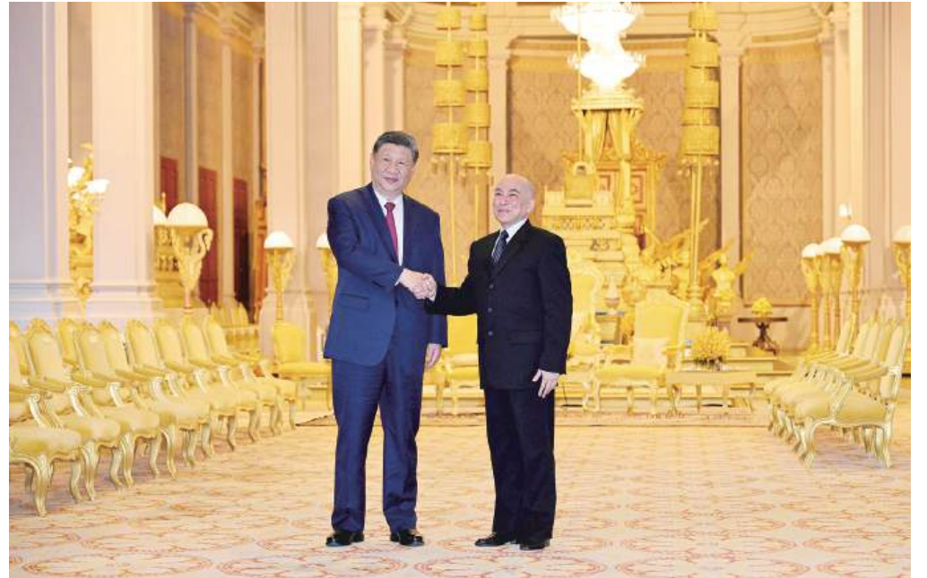
Cambodia's King Norodom Sihamoni (right) shakes hands with visiting President Xi Jinping during a meeting at the Royal Palace in Phnom Penh yesterday.

PHNOM PENH – President Xi Jinping said yesterday that China and Cambodia set a model for equality, mutual trust and win-win cooperation between countries of different sizes.