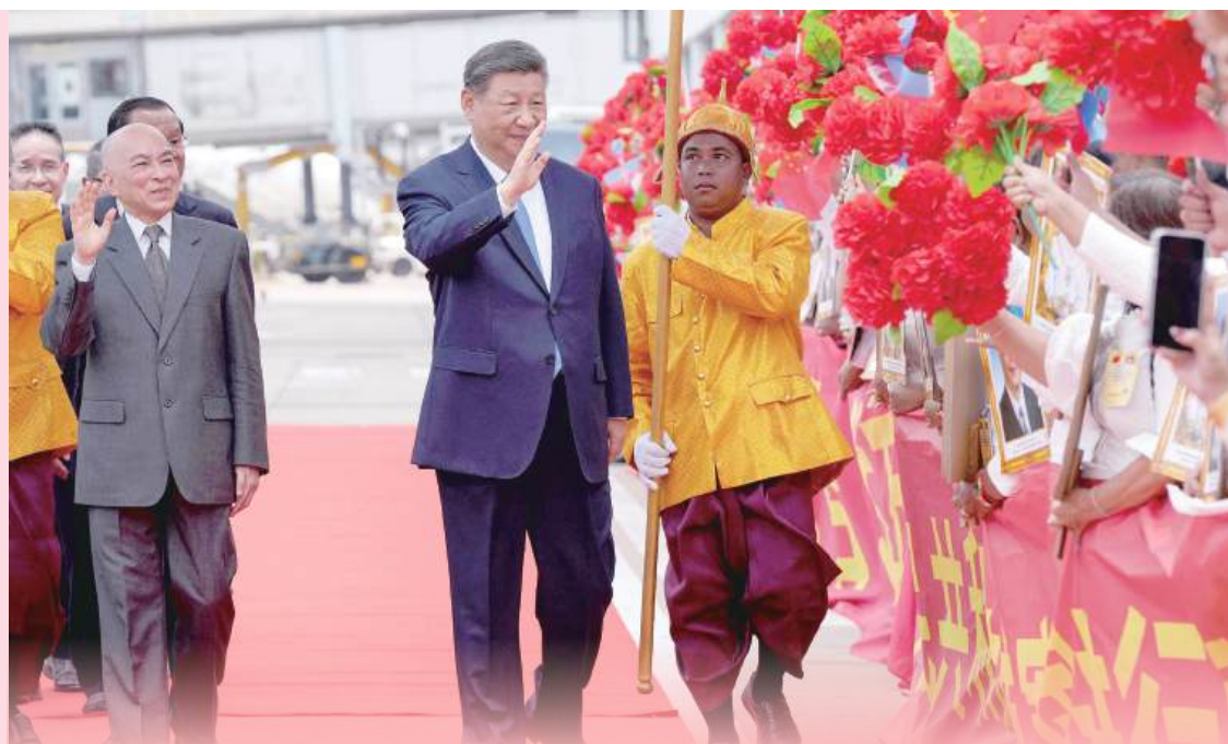
President Xi Jinping (centre) and Cambodian King Norodom Sihamoni (left) greet a welcoming crowd upon arrival at Phnom Penh International Airport yesterday. Xi arrived after visiting Vietnam and Malaysia as Beijing seeks to strengthen regional trade ties and offset the impact of huge tariffs imposed by his US counterpart. – (More on pages 6 & 7)

Macau's most popular English-language newspaper – Your trustworthy source of news & views