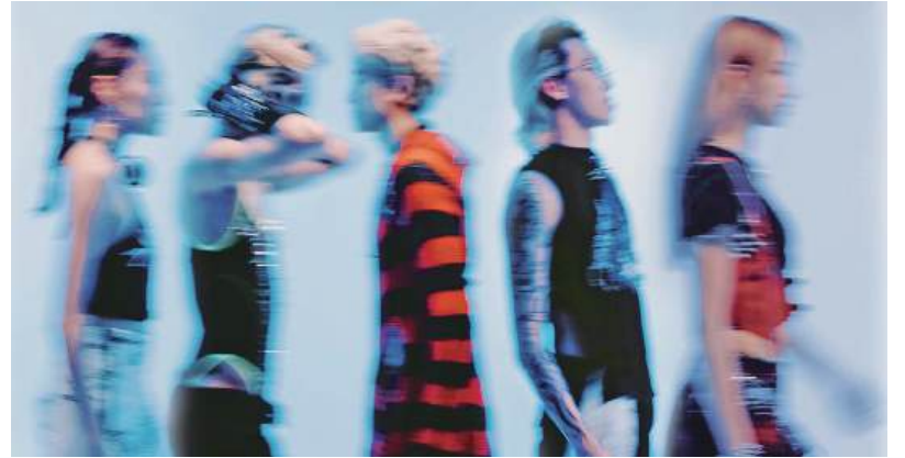
These photos provided by the Cultural Affairs Bureau (IC) on Wednesday shows "Chris-mas Kingdom" and "Raving•Vibration Z", both of which will be presented during the upcoming 35 th Macao Arts Festival (MAF).

lasting around one hour, scheduled for May 24 at 7:45 p.m. and on May 25 at 2:45 p.m.