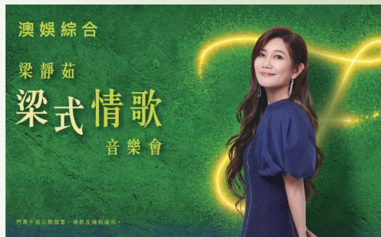
This poster provided by SJM Resorts on Tuesday promotes the upcoming "SJM Fish Leong Music Show", which will be staged on May 3.

information, including on ticketing and other activities, can be found by visiting www.icm.gov.mo/fam and relevant social media pages. Ticketing details are also available by calling 2840 0555 or by visiting https://ticketing.enjoymacao.mo/ . ■