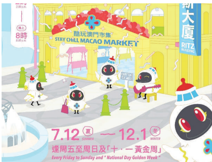
This poster provided by the Macau Government Tourism Office (MGTO) yesterday promotes its upcoming "Stay Chill Macao Market" in the Ritz Building in the city's main square, Largo do Senado.

In the 2024/2025 school year, a "Patriotic Education Camp" will be set up on the former site of the Luso-Chinese School in Coloane to provide systematic patriotic education camp activities for all F1 students in Macau. The camp will also dovetail with the existing Defence Education Camp for F2 students and the Outdoor Education Camp for F3 students, so as to satisfy the education sector's demand for camps earmarked for junior secondary school grades. ■