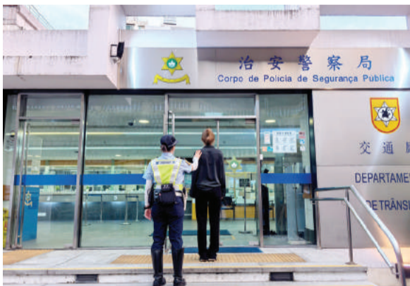
This undated handout photo provided by the Public Security Police (PSP) yesterday shows the female driver suspected of drunk driving being escorted by a PSP officer to the headquarters of the PSP Traffic Department.