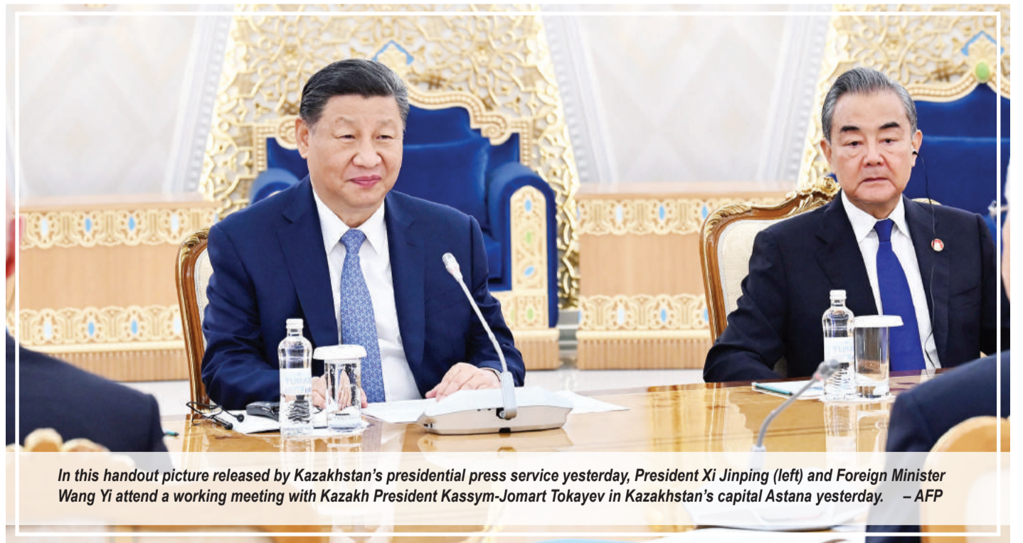
In this handout picture released by Kazakhstan's presidential press service yesterday, President Xi Jinping (left) and Foreign Minister Wang Yi attend a working meeting with Kazakh President Kassym-Jomart Tokayev in Kazakhstan's capital Astana yesterday.