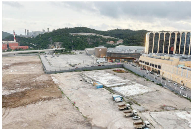
This photo taken last month shows the 94,000-square-metre government plot next to the Lisboeta Macau resort in Cotai. The plot was repossessed last year by the government, which chose it last month as the location for a temporary open-air venue for hosting concerts and other performances with a capacity of 50,000 spectators.

The statement noted that the local government has already