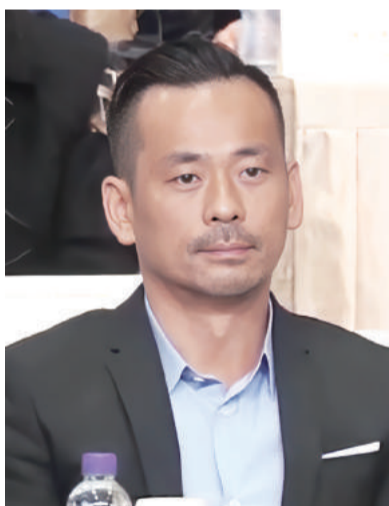
This November 9, 2018 file photo shows Suncity Group boss Alvin Chau attending a press conference about Macau’s 3rd International Film Festival & Awards

Alvin Chau, 50, was handed down the 18-year prison term in January 2023 for organised crime leadership