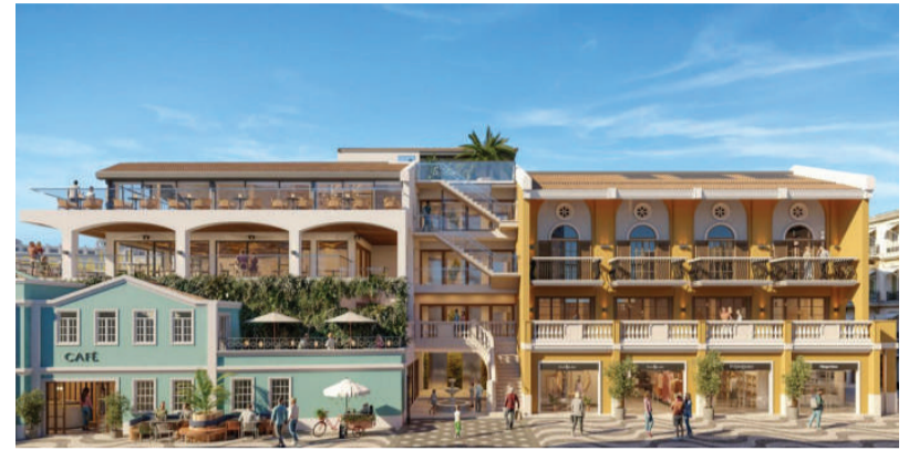
This artist's rendition released yesterday by Sniper Capital shows its flagship project at Taipa Village.

The new project will feature "expansive al fresco terraces and flexible layouts" designed for F&B and retail operations, the statement said. The flagship project, which is a five-storey building, covers over