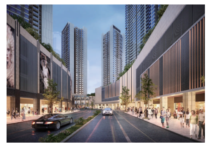
This MUR artist's rendition released last year shows a road in the future Plot P temporary housing community.