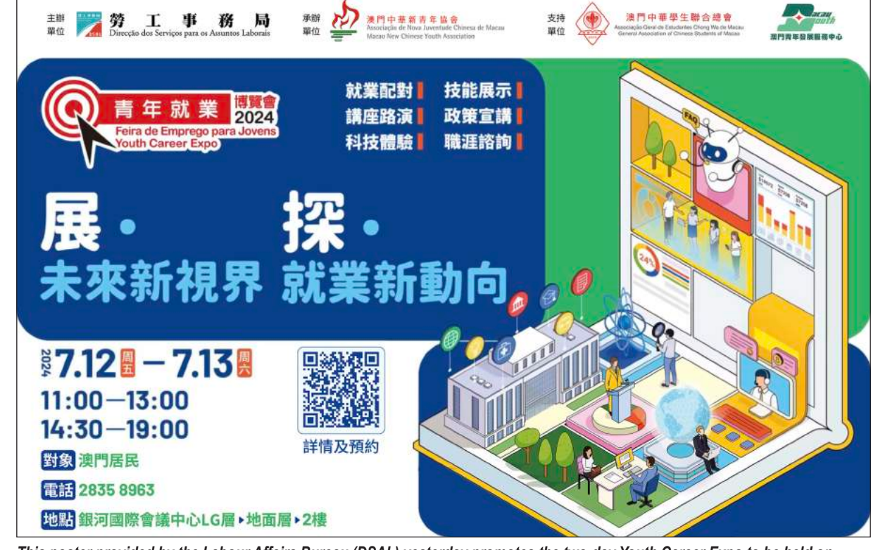
This poster provided by the Labour Affairs Bureau (DSAL) yesterday promotes the two-day Youth Career Expo to be held on Friday and Saturday.