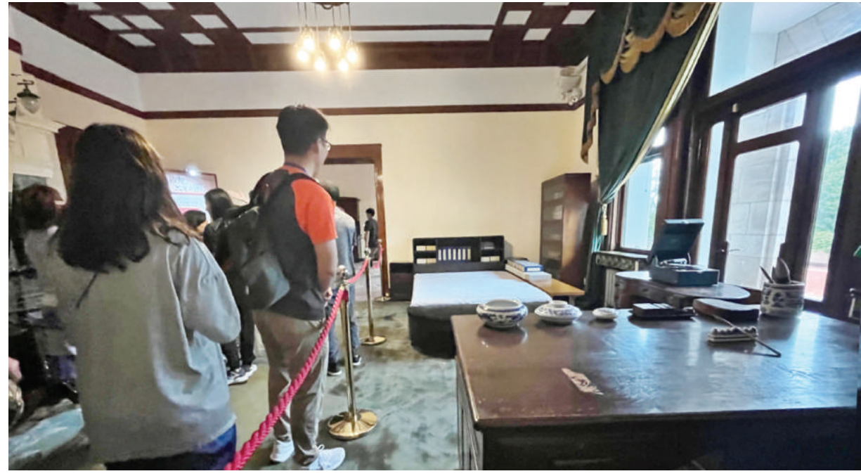
Members of Macau's media delegation yesterday visit the room of the former German Governor's House where Mao Zedong used to stay when visiting Qingdao. The mansion is now a museum.

The forum, which opens this morning, will be held in Qufu, Shandong province, today and tomorrow.