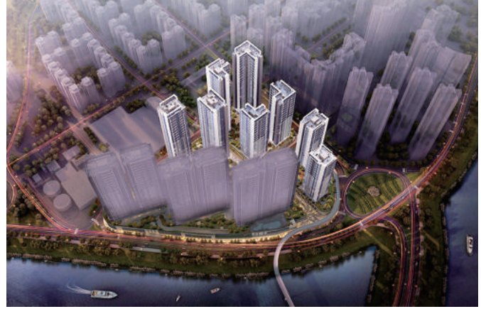
This artist's rendition downloaded from the MUR website yesterday shows the eight temporary housing towers and six home swap housing towers on Plot P.