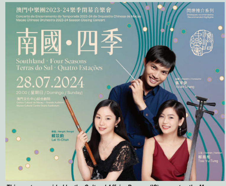
This poster provided by the Cultural Affairs Bureau (IC) promotes the Macao Chinese Orchestra's upcoming "Southland \cdot Four Seasons" concert.