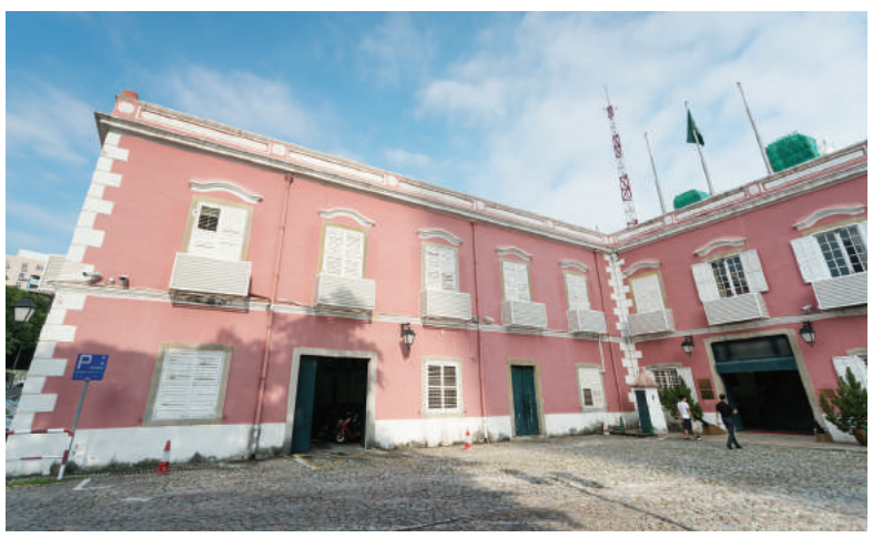
This undated file photo downloaded from the Secretariat for Security (GSS) website last night shows its headquarters in Calçada dos Quartéis.

Chan then rode away from the shop on a bicycle while the shop