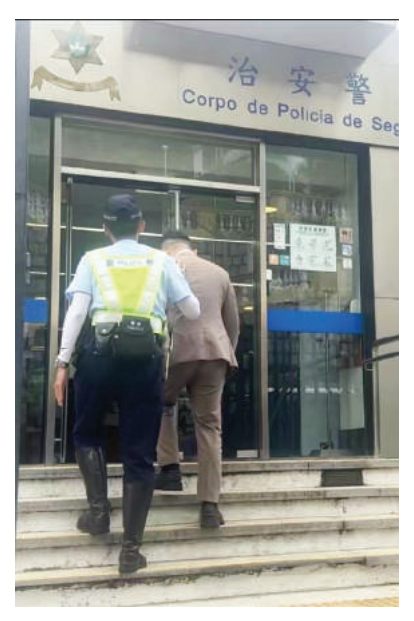
This undated handout photo provided by the Public Security Police (PSP) yesterday shows the local drunk-driving suspect being escorted by a PSP officer to the Traffic Police headquarters.

After spending some time in a bar, a local man hired a chauffeur to drive him to a carpark on Estrada Gov. A. Oliveira in Taipa, but then he got into the driver's seat and drove out of the parking space after the chauffeur had parked the car and left, when he then crashed into three vehicles parked next to his, a signboard, a vertical handrail, and