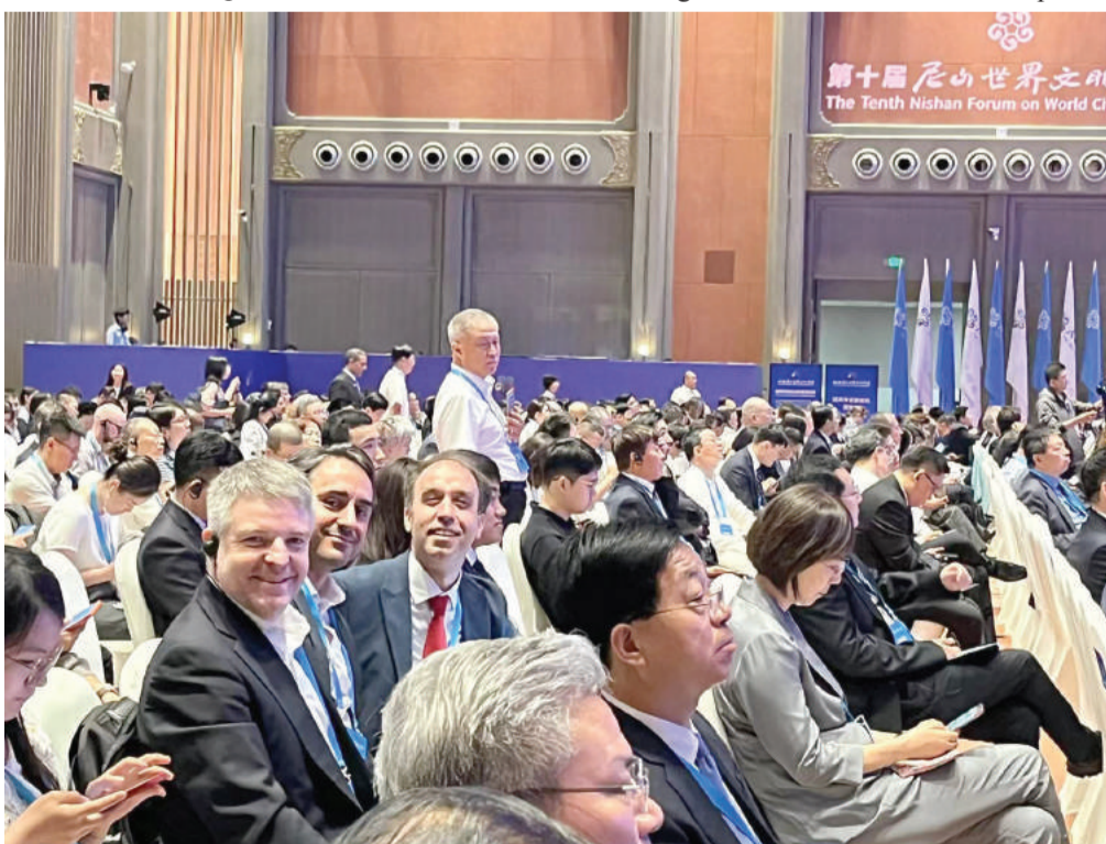
Members of the Macau press delegation are posing for a snap shot while attending yesterday's opening session of the forum.