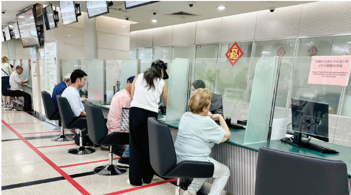
This photo taken yesterday shows foreign permanent Macau residents, who have made their appointment online, applying for their special mainland travel permits at four dedicated service counters at China Travel Service (Macao) Limited on the first floor of Nam Kwong Building in Zape.