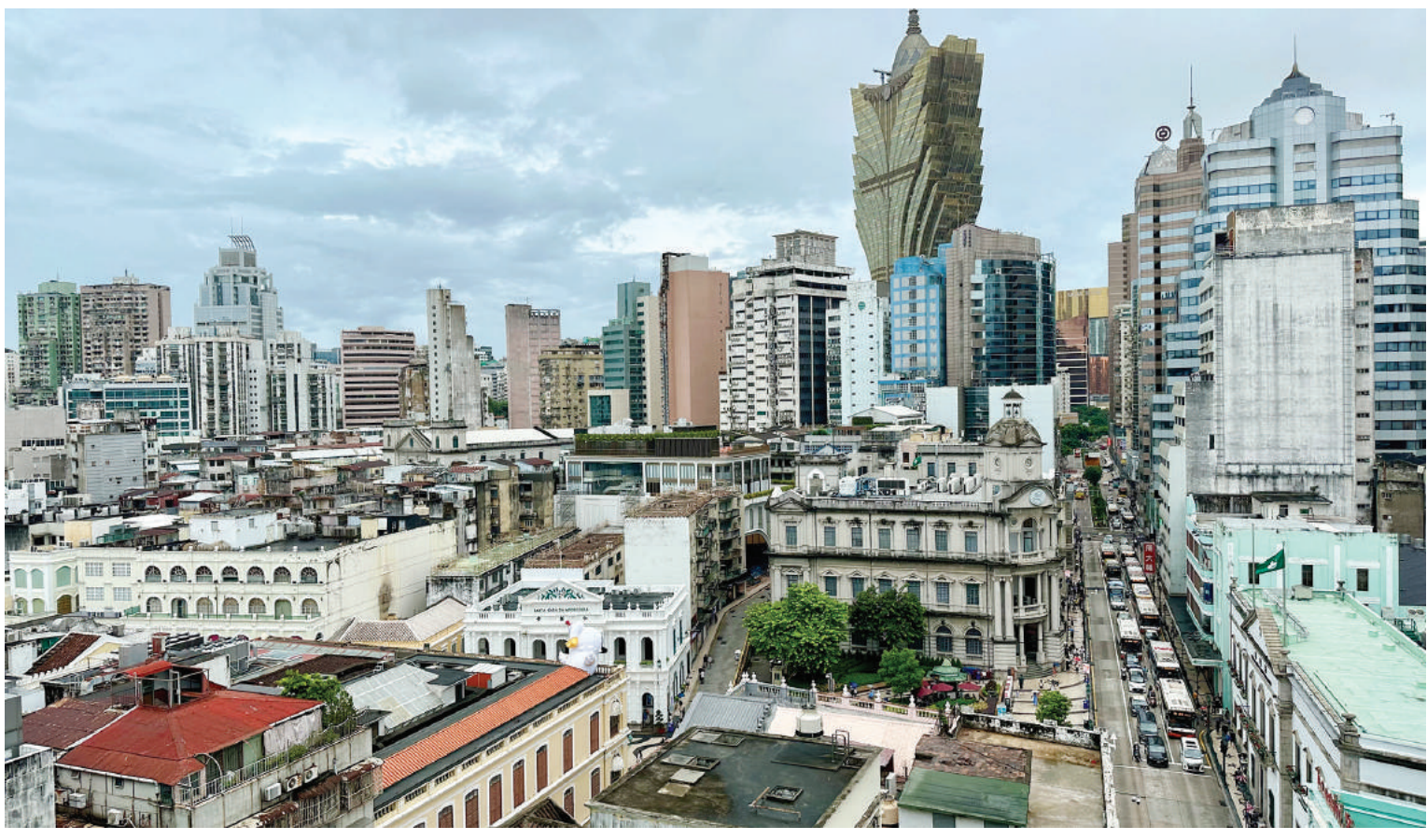
This photo taken from Hotel Central's sightseeing promenade on Monday gives a bird's eye view of a part of the city centre.

In addition, the Macau Monetary Authority (AMCM) issued on April 20 new guidelines to standardise the mortgage loan-to-value