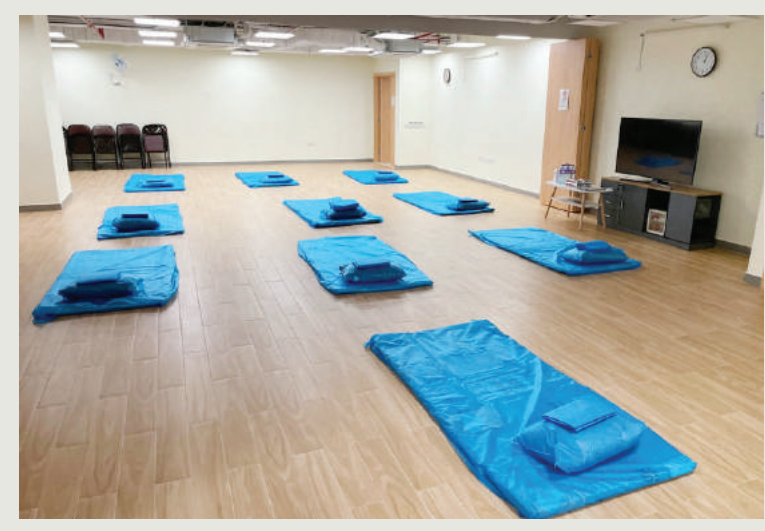
This undated file photo provided by the Social Welfare Bureau (IAS) in 2021 shows the cooling shelter at the Ilha Verde Refuge Centre.