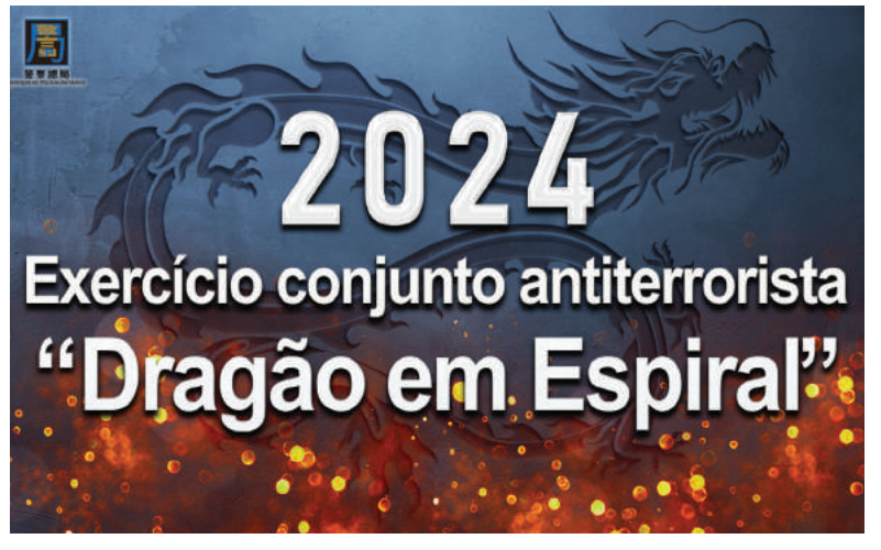
This poster provided by the Unitary Police Service (SPU) yesterday reminds the public of tomorrow's joint anti-terrorism drill "Coiling Dragon" at the Macau East Asian Games Dome.

According to the statement, the drill will simulate a terrorist attack and hold-up involving