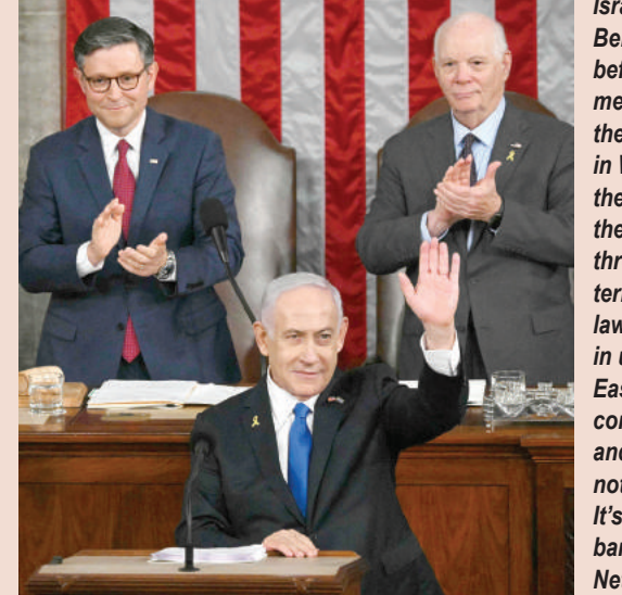
Israeli Prime Minister Benjamin Netanyahu waves before addressing a joint meeting of Congress at the US Capitol yesterday, in Washington, DC. Israel, the United States and the Arab world are under threat from Iran's "axis of

Netanyahu was addressing a joint session of Congress in a high-profile speech. The US is against Hamas.