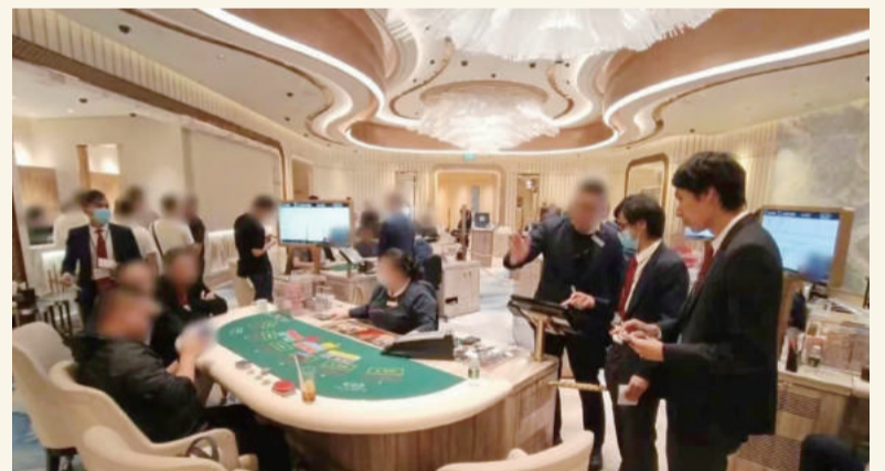
This undated handout photo released by the Gaming Inspection and Coordination Bureau (DICJ) on Wednesday shows its inspectors working next to a gaming table in a local casino.

According to the statement, the special inspections and audits also included measures aiming to prevent illegal gambling activities in the casinos, such as the possible operations of illegal parallel betting schemes (aka betting under the table), as well as unlicensed