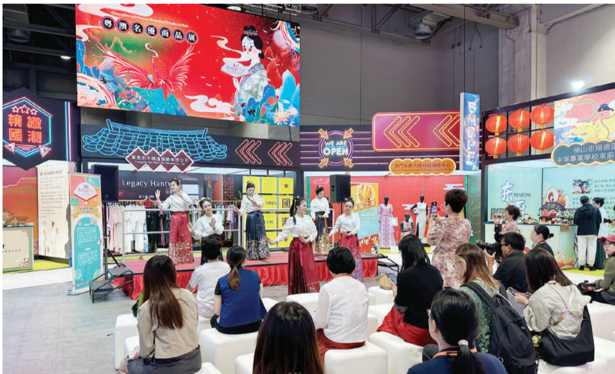
Dancers wearing traditional "hanfu" garb at the Guangdong & Macau Branded Products Fair's China Chic Area on its opening day yesterday.

He added that the focus of this year's fair is "innovation", which, for the first time, includes three featured areas, namely Hotel Facilities & Services Area, Smart Devices Area, and China Chic Area, guiding potential customers to gain a deeper understanding of the new market demands brought