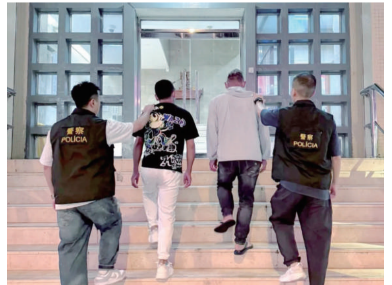
This undated handout photo released by the Public Security Police (PSP) yesterday shows two PSP officers escorting the two shoplifters to the PSP headquarters, which is also the No. 2 PSP station, in Zape.

The spokesperson said that after scrutinising the supermarket's CCTV footage and the police forces' citywide CCTV camera system, PSP officers identified the three shoplifters, after which