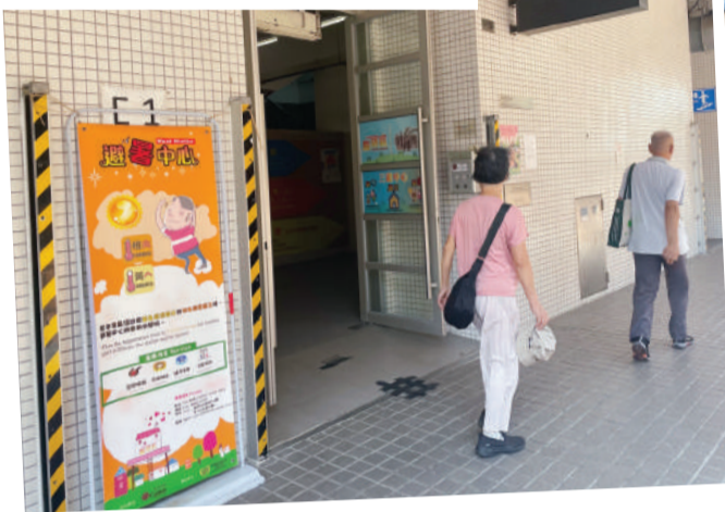
Two pedestrians walk past the entrance to the centre yesterday.

Join us to celebrate our 20 th Anniversary