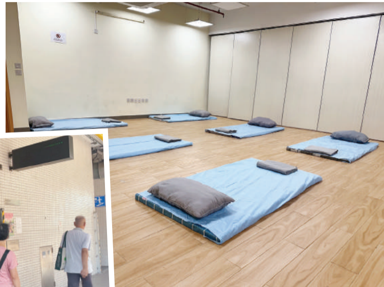
This photo taken yesterday shows sleeping pads provided by the temporary cooling shelter.