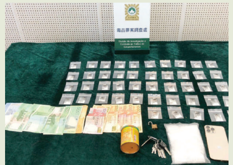
Cocaine, cash, and other pieces of evidence seized by the police are displayed in a pressroom of the PJ headquarters yesterday.

Biseko was transferred to the Public Prosecutions Office (MP) yesterday, facing a drug-trafficking charge, according to Lou. ■