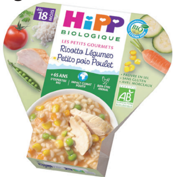
This undated file photo downloaded from the official website of "HiPP Biologique" last night shows the problematic baby food "Risotto Légumes Petits Pois Poulet (18 mois)".