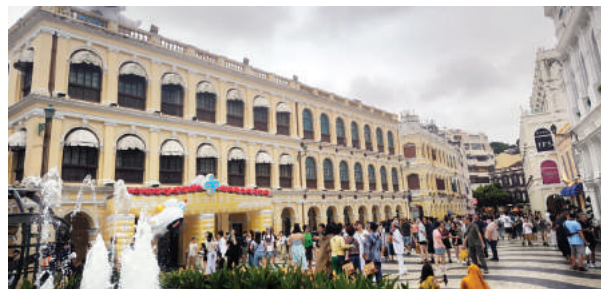
Visitors gather in the city's main square, Largo do Senado, yesterday, with an installation of Macau's tourism mascot MAK MAK on the top of the Ritz Building.