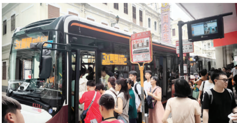
Passengers catch a No. 3X bus on Avenida de Almeida Ribeiro, the city's main thoroughfare, en route to the Barrier Gate checkpoint yesterday.