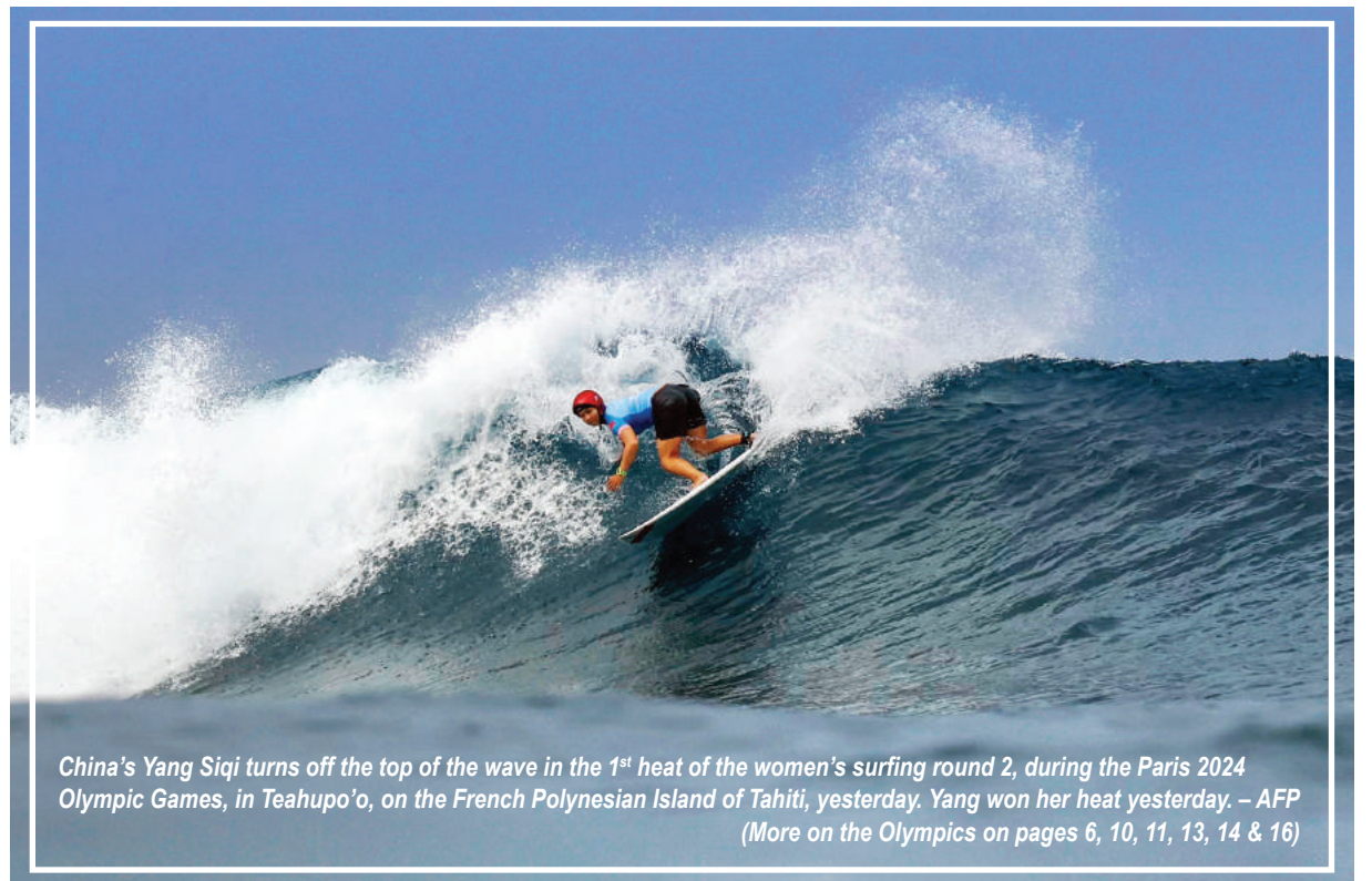
China's Yang Siqi turns off the top of the wave in the 1st heat of the women's surfing round 2, during the Paris 2024 Olympic Games, in Teahupo'o, on the French Polynesian Island of Tahiti, yesterday. Yang won her heat yesterday. — AFP (More on the Olympics on pages 6, 10, 11, 13, 14 & 16)

Hezbollah has a strong presence in east Lebanon's Bekaa valley, which borders Syria, and in south Lebanon, where it has been launching near daily attacks on Israeli positions since October in support of ally Hamas. (More on p. 10) — AFP