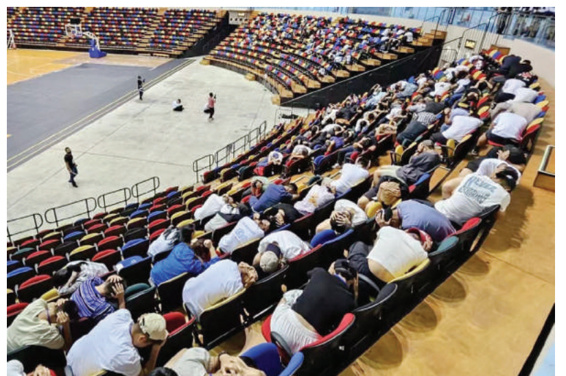
The "Coiling Dragon" joint anti-terrorism drill takes place at the Macau East Asian Games Dome in Cotai on Friday, simulating half a dozen terrorists forcing their way into a large-scale concert and threatening the audience inside.

The statement noted that 1,038 officers and officials from the Macau Customs Service (SA),