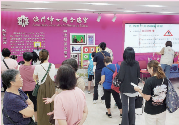
This undated handout photo provided by the Health Bureau (SSM) on Saturday shows a community infectious disease awareness day activity held in May at the Women's General Association of Macau (Fu Luen) headquarters on Rua da Barca.

For more information about hepatitis B and hepatitis C, call the bureau on 2870 0800 or visit the bureau's official website at www.ssm.gov.mo/hepday . ■