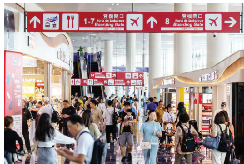
on Friday shows passengers walking past duty-free shops in the local airport's boarding area.

The statement said that passengers on mainland China routes accounted for 46 percent of the total passenger numbers during the first half of this year,