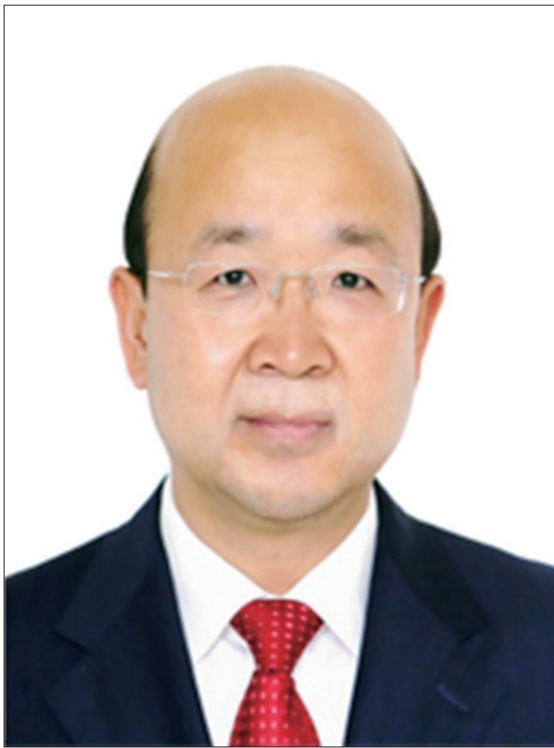
Undated file photo of Commissioner of the Ministry of Foreign Affairs (MFA) of the People's Republic of China (PRC) in the Macao Special Administrative Region (MSAR) Liu Xianfa

As Chinese modernization has been advanced continuously through reform and opening up, it will surely embrace broader horizons through further reform and opening up. The present and the near future constitute a critical period for our endeavor to build a great country and move toward national rejuvenation on all fronts through Chinese modernization. To deal with complex environments both at home and abroad, adapt to the new round of scientific and technological revolution and industrial transformation, and live up to the new expectations of our people, it is vital that we continue to advance reform. It was pointed out at the Third Plenary Session of the 20 th CPC Central Committee that the overall objectives of further deepening reform comprehensively are to continue improving and developing the system of socialism with Chinese characteristics and modernize China's system and capacity for governance. By 2035, China will have finished building a high-standard socialist market economy in all respects, further improved the system of socialism with Chinese characteristics, generally modernized our system and capacity for governance, and basically realized socialist modernization. All of this will lay a solid foundation for building China into a great modern socialist country in all respects by the middle of this century. To steadily advance reform, we will focus on building a high-