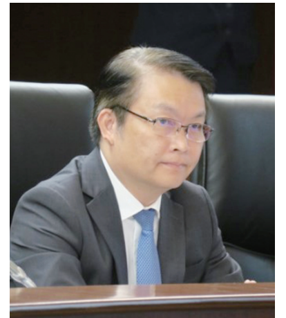
Secretary for Economy and Finance Lei Wai Nong addresses yesterday's plenary session in the Legislative Assembly's (AL) hemicycle.

The law also raises the fines for administrative offences, with the Monetary Authority of Macau