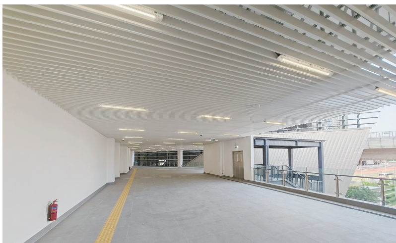
These two handout photos released and taken by the Public Works Bureau (DSOP) yesterday shows the newly completed LRT cross-platform interchange's corridor (left) and its location entering the Hengqin section's HE1 station.

The newly completed cross-platform interchange will enable LRT passengers to change trains