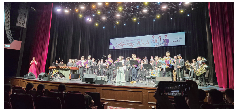
Performers pose after the "Amazing Winds" show at The Parisian Theatre last night.

A notable highlight was the performance's ability to captivate the audience, as most members of the audience remained in their seats post-intermission, which truly marked the performers' ability to appeal to a diverse audience with its genuine quality. ■