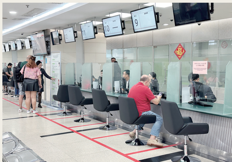
This file photo taken on July 10 shows the four dedicated service counters for processing applications by foreign permanent residents of Macau for special travel permits to enter mainland China at China Travel Service (Macao) Limited on the first floor of Nam Kwong Building in Zape.

Speaking to the Post on WeChat, Chan noted that among the about 1,700 applicants who have made online appointments, about 820 have meanwhile been processed, with nationals from Portugal, Malaysia and the Philippines accounting for most of the applicants. ■