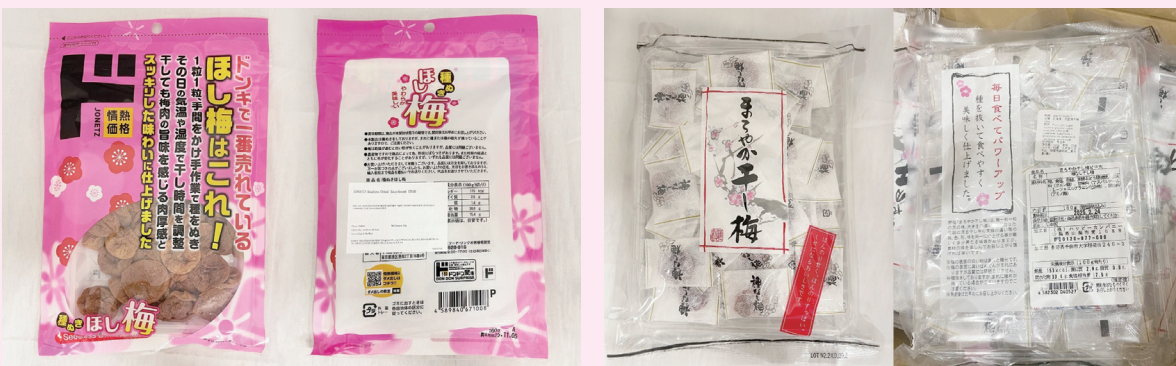
This undated handout photo shows the "Seedless Dried Sour-Sweet UME" and "干梅" product that was found by the Macau Municipal Affairs Bureau (IAM) to contain excessive amounts of the sweetener aspartame.