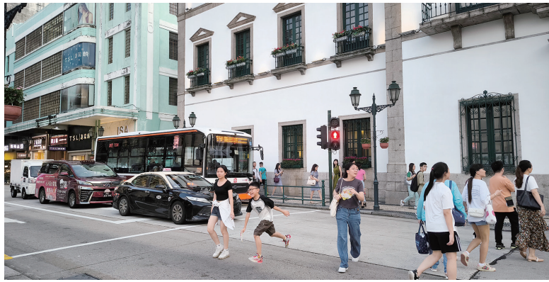
A black taxi and a radio taxi behind it stop at the traffic light-controlled crossing outside the Municipal Affairs Bureau (IAM) headquarters on Avenida de Almeida Ribeiro yesterday.

If a debate motion is passed by lawmakers during a plenary session, the legislature will then request government officials to attend another plenary session in the near future for a formal and public debate between the officials and legislators on the matter raised by the debate motion. Yesterday's rejection of the two debate motions means that the legislature will not schedule plenary sessions for debates for either of the two debate motions.