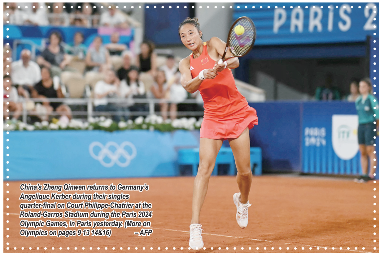
China's Zheng Qinwen returns to Germany's Angelique Kerber during their singles quarter-final on Court Philippe-Chatrier at the Roland-Garros Stadium during the Paris 2024 Olympic Games, in Paris yesterday. (More on Olympics on pages 9 13 14&16) – AFP

"The Committee judges that the risks to achieving its employment and inflation goals continue to move into better balance," the Fed said, adding that it was "attentive to the risks to both sides of its dual mandate." – AFP