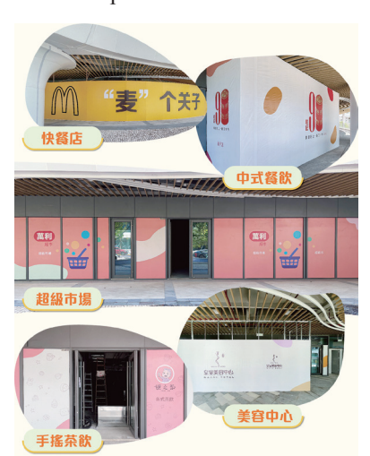
This undated MUR combo photo released yesterday shows the under-decorated fast-food restaurant, Chinese restaurant, supermarket, bubble tea shop and beauty salon.