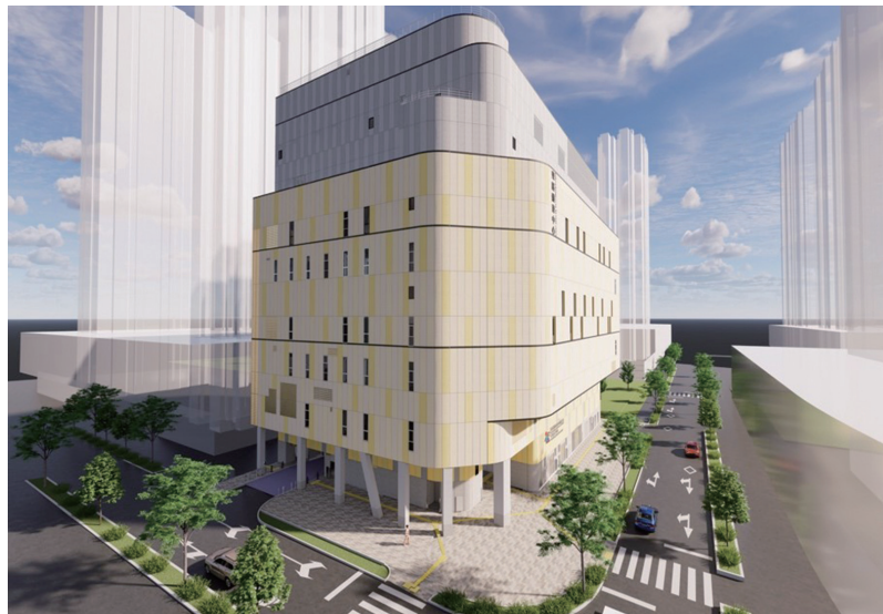
This artist's rendition downloaded from the Public Works Bureau's (DSOP) website yesterday shows the future sports complex on Plot A9 in Zone A.

The bureau launched a public tender in May for the project on Plot A8, which drew also 21 bids, which were unsealed by DSOP officials in June. The A8 project is slated to get off the ground in the next quarter.