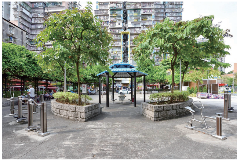
This undated handout photo downloaded from the Municipal Affairs Bureau's (IAM) website yesterday shows the sitting-out area located at the corner of Rua Oito do Bairro Iao Hon and Avenida da Longevidade in Iao Hon district.

The public housing building will also include commercial and community facilities.