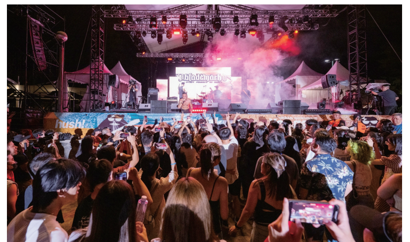
This undated handout photo provided by the Cultural Affairs Bureau (IC) yesterday shows a performance taking place during a previous edition of hush!

Moreover, "Art Installations", a new activity featured this year, will be held on the beach and the adjacent woodland area, the statement said, enabling participants to create and