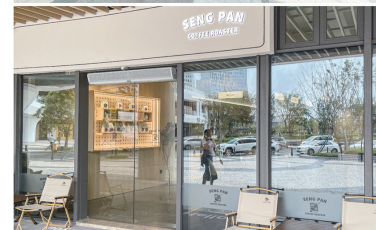
This undated combo photo released by Macau Urban Renewal Limited (MUR) yesterday shows the current convenience store, express courier outlet and café in the Macau New Neighbourhood (MNN) residential estate in Hengqin.