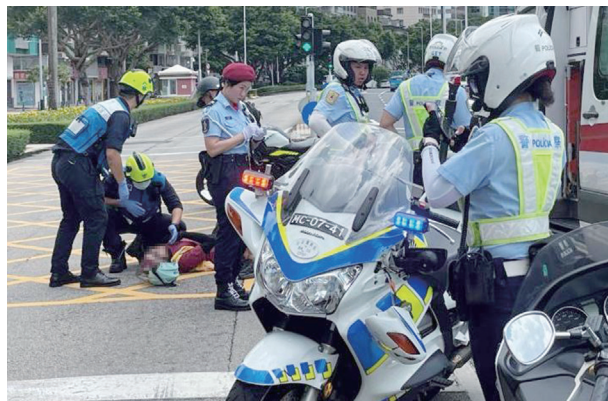
Police officers and paramedics attend to the injured in Nam Van after yesterday's crash involving two motorbikes, one of them ridden by a traffic police officer. The photo has been pixelated by the Post.

The Public Security Police stressed in the statement that they will follow up on the accident in accordance with the law, adding that the officer involved has meanwhile been admonished. The statement also underlined that safety awareness and related training of PSP officers in driving vehicles will be enhanced, and in particular, strengthen the operational coordination in discharging official duties. ■