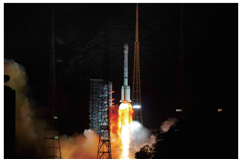
A Long March-3B carrier rocket carrying a new high-orbit internet-services satellite blasts off from the Xichang Satellite Launch Center in Sichuan Province yesterday. The satellite was launched at 9:14 p.m. aboard a Long March-3B carrier rocket and entered its preset orbit successfully. The launch marks the 529th flight mission of the Long March carrier rocket series.

"The humanoid robots will not only assist or replace humans in completing some tasks but also bring more emotional value," he said.