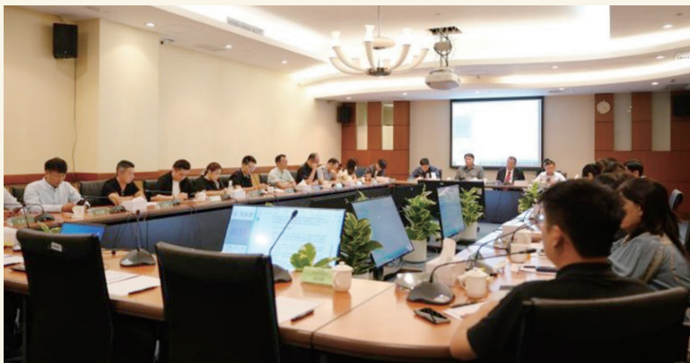
Northern District Community Service Consultative Council members attend yesterday's regular meeting at the Government Services Centre in Areia Preta district.