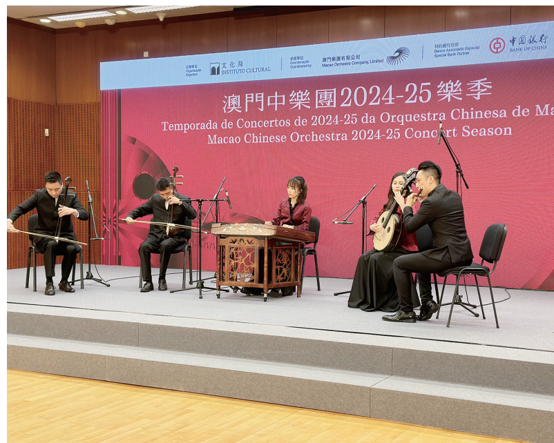
Members of the Macao Chinese Orchestra perform during yesterday's press conference.

new season will kick off at 8 p.m. on September 1 with “Splendour of the Strings”.