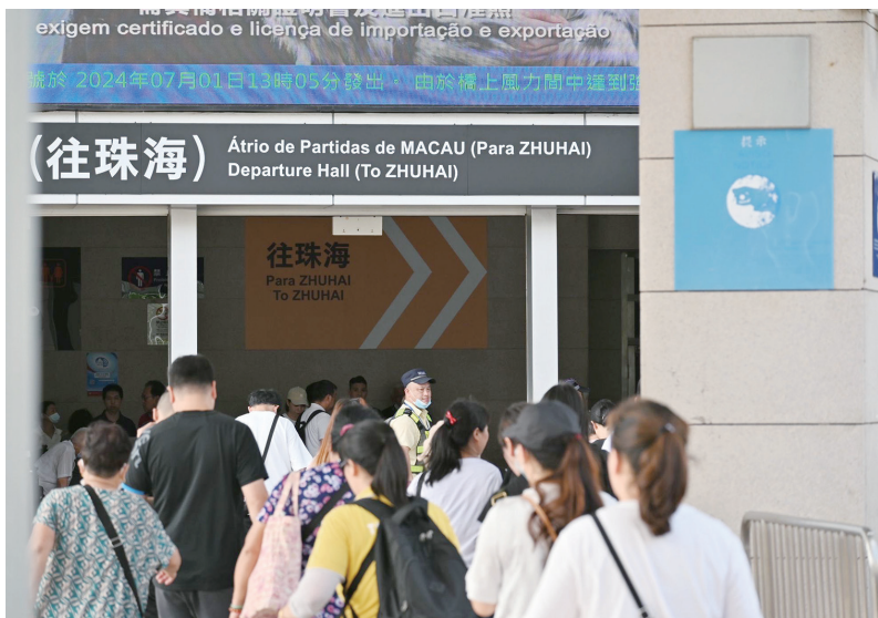
This file photo taken in July shows border-crossers entering the Barrier Gate checkpoint's departure hall.

Personal baggage items, according to the ministry, carried by travellers crossing the “first-tier” Hengqin checkpoint will be allowed to be carried free of duty within a “reasonable” quantity for personal use. There is no restriction on the duty-free quota of 12,000 yuan, which implies that, subject to fulfilment of the new measure’s conditions, duty-free goods exceeding 12,000 yuan can be carried into the Guangdong-Macau In-depth Cooperation Zone