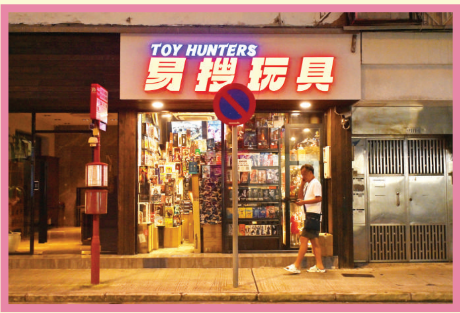
This photo shows Lei's shop called Toy Hunters.