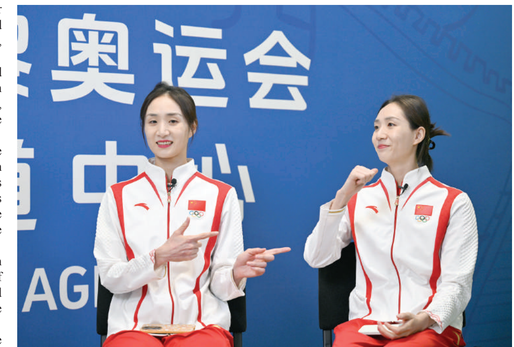
Team China's artistic swimming gold medalists Wang Liuyi (right) and Wang Qianyi gesture during an interview with Xinhua at the main press center of the Paris 2024 Olympic Games in the French capital