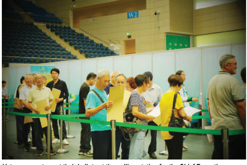
Voters queue to cast their ballots at the polling station for the Chief Executive Election Committee's industrial, commercial and financial segments at the Macao Polytechnic University's (MPU) Multi-Sport Pavilion in Zape yesterday morning.

Concerning the remaining 56 members of the committee – whose seats were not up for grabs