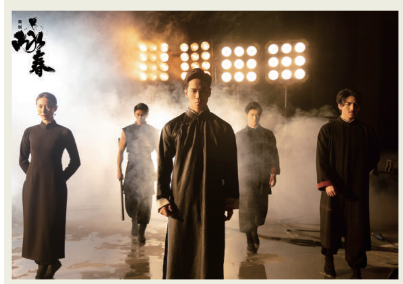
This undated handout photo provided by the Cultural Affairs Bureau (IC) promotes the "Performance to Celebrate the 75th Anniversary of the National Day of the People's Republic of China and the Haojiang Moonlight Night - Dance Drama Wing Chun", which is slated for next month.

Tickets, priced between 200 patacas and 800 patacas, are now available, with more ticketing details available on www.macauticket.com or by calling 2855 5555. Show details can also be found on www. icm.gov.mo, or on the bureau's social media pages.