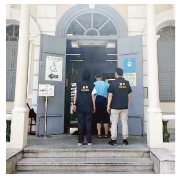
This undated handout photo provided by the Public Security Police (PSP) yesterday shows two PSP officers escorting the local suspect to the northern district's police station on Avenida do Almirante Lacerda.

The suspect, who told the police that he is jobless, has been transferred to the Public Prosecutions Office (MP), facing a charge of the illegal sale of Mark Six lottery tickets.