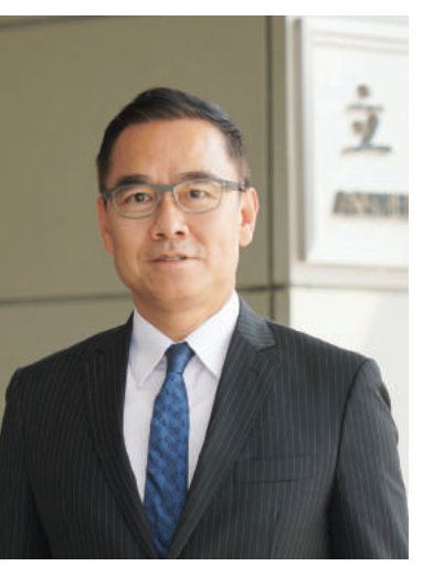
Undated file photo provided by lawmaker Ho lon Sang yesterday

special open spaces, activity plazas, fitness facilities, and play areas. ■