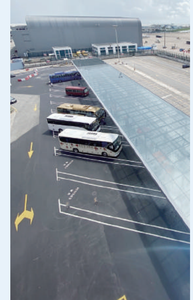
This photo taken from the airport's