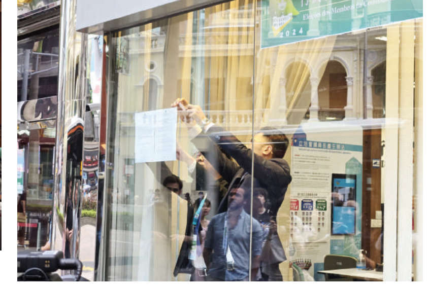
The election results are being stuck on the ground-floor display window of the Public Administration Building on Rua do Campo yesterday.

Any pedestrian walking past the building can read the detailed