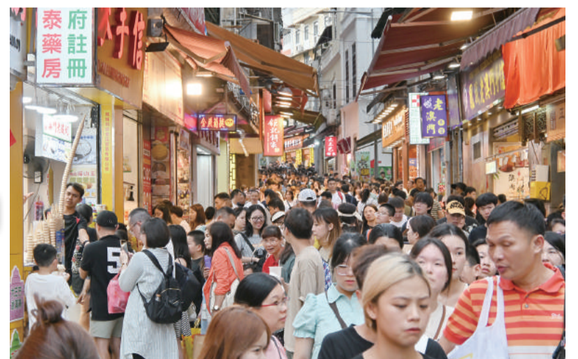
Tourists throng Rua de S. Paulo last week, a narrow pedestrian-only street near the UNESCO World Heritage-listed St. Paul’s Ruins landmark.

Moreover, yesterday’s MGTO statement also said that according to its provisional data, Macau recorded 1.48 million visitor arrivals between August 1 and 12, representing a daily average of about 124,000, adding that Saturday last week saw the highest single-day number of 154,542 during the 12-day period. ■