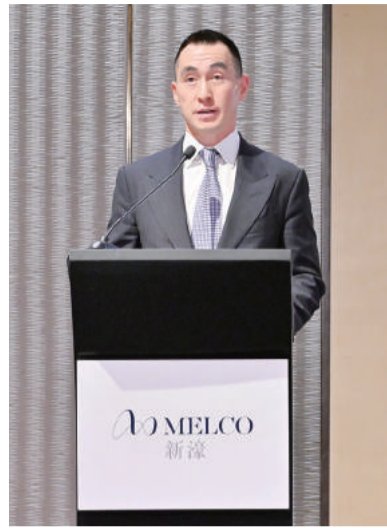
Melco Resorts & Entertainment Chairman and CEO Lawrence Ho Yau-lung delivers a speech during yesterday’s launch ceremony for the 3 rd Melco Star Youth Talent Competition at Studio City in Cotai.

Meanwhile, the company also announced in a separate statement last night that the “Melco Style Presents: 2024 Macau Lin Dan Cup Badminton Open” will take place at the Studio City Event Centre next month,