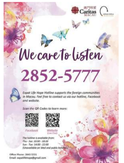
This poster from the Caritas Macau website shows its Expat Life Hope Hotline 2852 5777 for Macau’s non-Chinese speaking communities.

Those needing support are urged to phone Caritas Macau’s Life Hope Hotline on 2852 5222 (Chinese) or Expat Life Hotline on 2852 5777 (English) or the Social Welfare Bureau’s (IAS) 24-hour Counselling Hotline on 2826 1126. ■