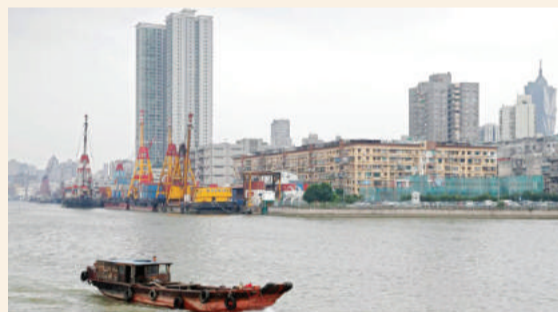
This undated file photo downloaded from the Macau Government Tourism Office (MGTO) last night shows Macau's Inner Harbour.