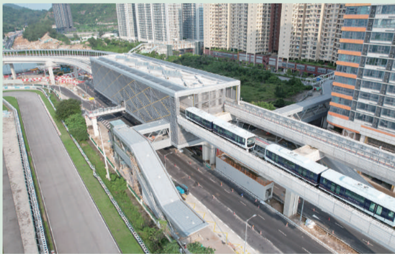
This photo taken by the Public Works Bureau (DSOP) in May shows the undeveloped plot next to the newly completed Light Rail Transit (LRT) Seac Pai Van Station, the Lok Kuan Building social rental housing estate (top), and the private residential estate Praia Park (right).

The site is an undeveloped plot located between Avenida da