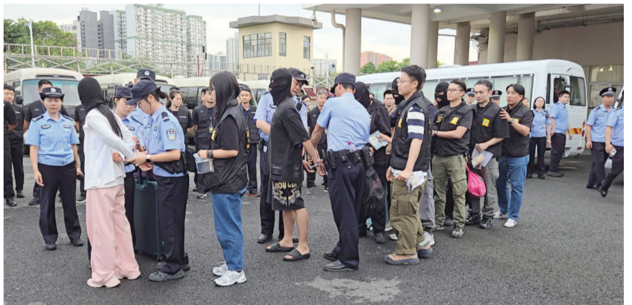
The 36 mainland illegal money exchange dealers are being transferred to the mainland authorities in the area between Zhuhai's Gongbei and Macau's Barrier Gate border checkpoints yesterday.