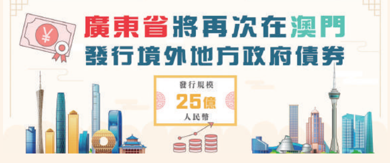
Poster in Chinese released by the Macau Monetary Authority (AMCM) on its Facebook page yesterday about Guangdong's upcoming issuance of 2.5-billion-yuan bonds in Macau.

The statement pledged that the Macau Monetary Authority will continue to promote local financial institutions' stronger participation in the in-depth cooperation zone's development.