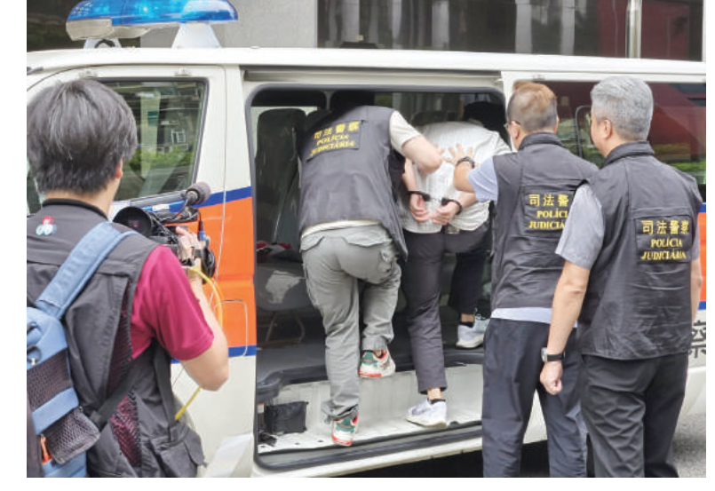
The mainland theft suspect is being transferred to a police vehicle outside the Judiciary Police (PJ) headquarters yesterday.

The police urged residents and tourists to take care of their belongings when using public transport.