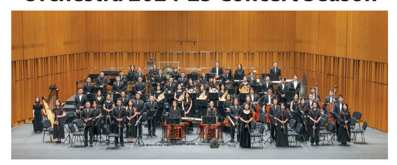
This undated handout photo provided by the Cultural Affairs Bureau (IC) yesterday shows members of the Macao Chinese Orchestra posing for a group photo.