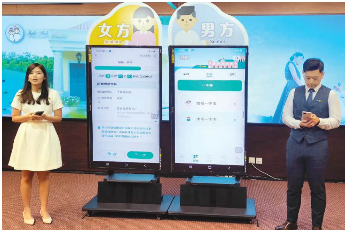
Two civil servants show reporters how to use the new marriage integrated public service on the Macao One Account during yesterday's press conference.

The newly launched "marriage integrated public service" and "birth integrated public service" can get off the ground thanks to personal data sharing and connection between the various related public entities as well as with the private Kiang Wu Hospital, statutorily enabled by the newly amended civil registration law