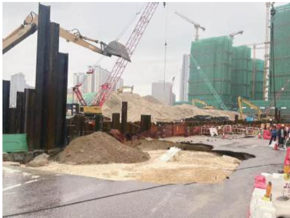
This handout photo released by the Public Works Bureau (DSOP) yesterday shows the sinkhole at a location where Rotunda de Hou Kong meets Avenida Doutor Ma Man Kei in Zone A.