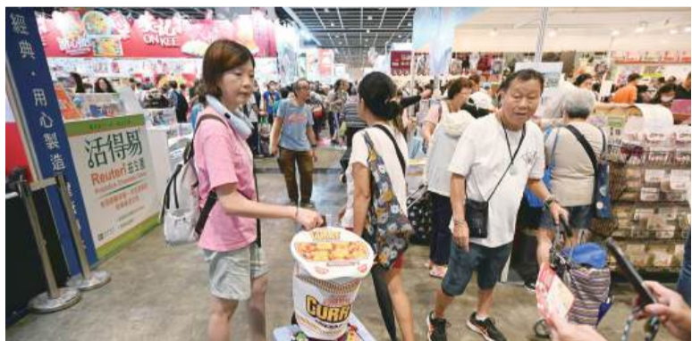
Fairgoers visit a food expo at the Hong Kong Convention and Exhibition Centre yesterday.

Yesterday's press conference also included a session where two government staff members, simulating an occasion of them being a couple, showed reporters how to use the new marriage integrated and birth integrated public services on the Macao One Account. ■