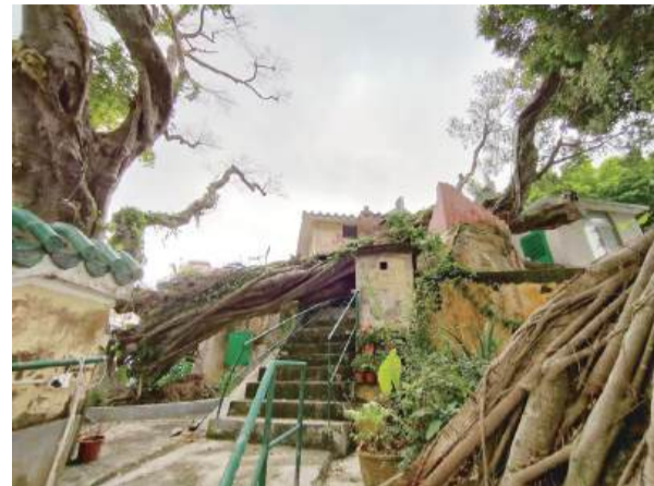
This handout photo released by the Municipal Affairs Bureau (IAM) and Cultural Affairs Bureau (IC) yesterday shows the fallen banyan tree in the Tin Hau Temple complex on Rua dos Pescadores.

Yesterday's case came after an old tree fell in the complex in June last year.