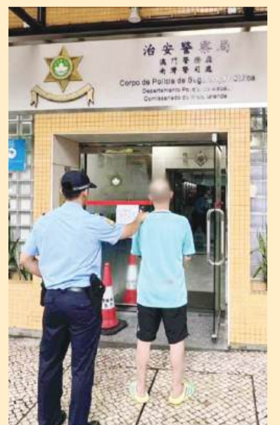
shows a police officer taking the suspect to the Nam Van Police Station for questioning.