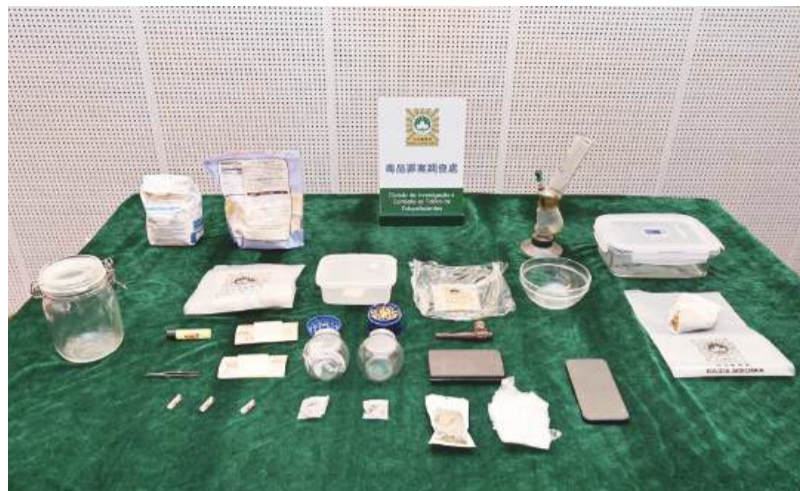
Evidence seized from the suspect such as cannabis cookies, cannabis buds, drug paraphernalia, flour and oats is displayed at the Judiciary Police (PJ) headquarters yesterday.

PJ officers then went to Lau's flat in Taipa and seized two packets of cannabis buds weighing 0.58