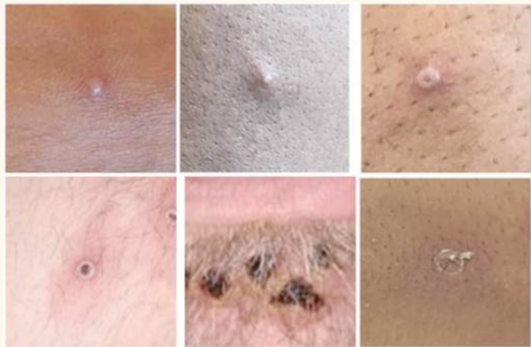
This set of images from 2019 and downloaded from Wikipedia last night, shows the stages of mpox lesion development.