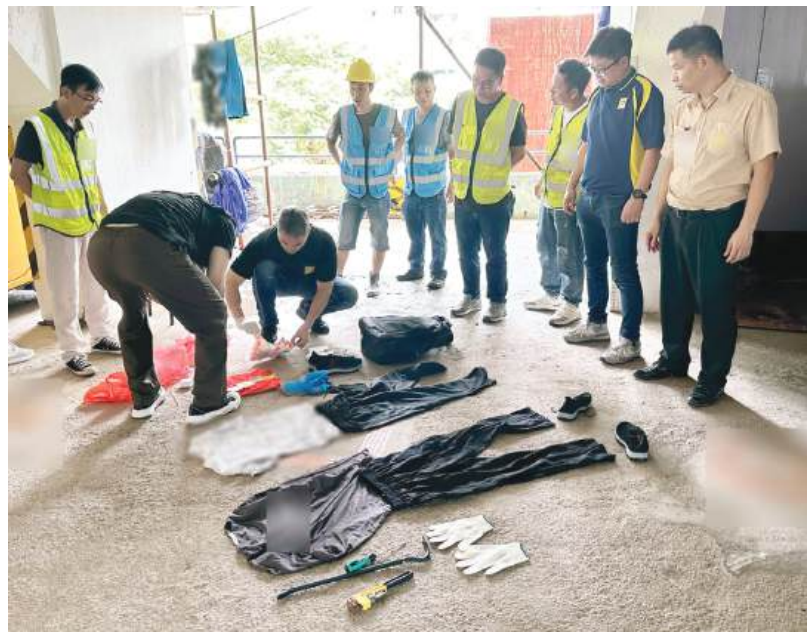
This undated photo provided by the Judiciary Police (PJ) yesterday shows evidence including a backpack, clothes and shoes being examined by the police at a residential building in Taipa, as construction workers look on.

With the aid of CCTV footage, the police identified the duo and arrested them later that day. The police also requested the building's estate manager to enquire whether