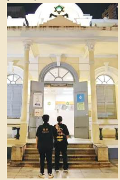
This undated handout photo provided by the Public Security Police (PSP) yesterday shows a PSP officer escorting the local Filipina theft suspect to a police station in the northern district.