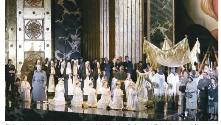
This undated handout photo provided by the Cultural Affairs Bureau (IC) on Friday shows a performance of Tosca – Opera in Three Acts by Giacomo Puccini.