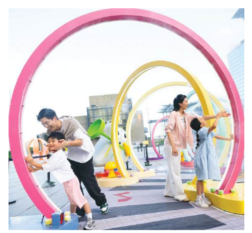
This undated handout photo provided by the Cultural Affairs Bureau (IC) yesterday shows the upcoming "MICAF Fun Day" Arts Carnival at the Cultural Centre Plaza. 10 a.m. to 12 p.m. and from 3 p.m. to 5 p.m. respectively, targeting children aged 5 to 12 years old.

Details of the programme can be found on the Macao House of Literature's website at www.clm. gov.mo. For enquiries, one can call 8399 6211 during office hours. ■