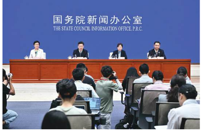
This handout photo provided by the State Council Information Office shows National Immigration Administration (NIA) officials addressing yesterday's press conference about the new mainland travel permits for foreign permanent residents in Hong Kong and Macau the and talent travel permits for residents from Beijing, Shanghai and the Greater Bay Area (GBA) allowing them to enter Hong Kong and Macau.

In addition, the NIA also announced during yesterday's press