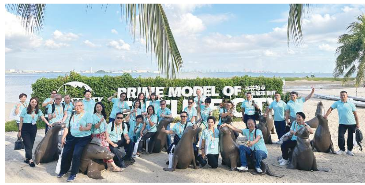
Members of the Macao ASEAN International Chamber of Commerce (MAICC) business delegation pose after yesterday's visit to Forest City in Iskandar Puteri, Johor, Malaysia.

According to the project operator, the four-kilometre-long RTS Link will run from Johor Bahru in Malaysia to Singapore's Woodland North Mass Rapid Transit (MRT) station, with an estimated capacity of 10,000 passengers per hour in one direction, and about 150,000 passengers per day. With the planned completion of the Johor Bahru Rapid Transit (SBRT) system in late 2026, including the building of a new Immigration, Customs and Quarantine (ICQ) Complex next to the station at Bukit Chagar in Malaysia, the project is aimed to ease the traffic congestion at the Johor-Singapore