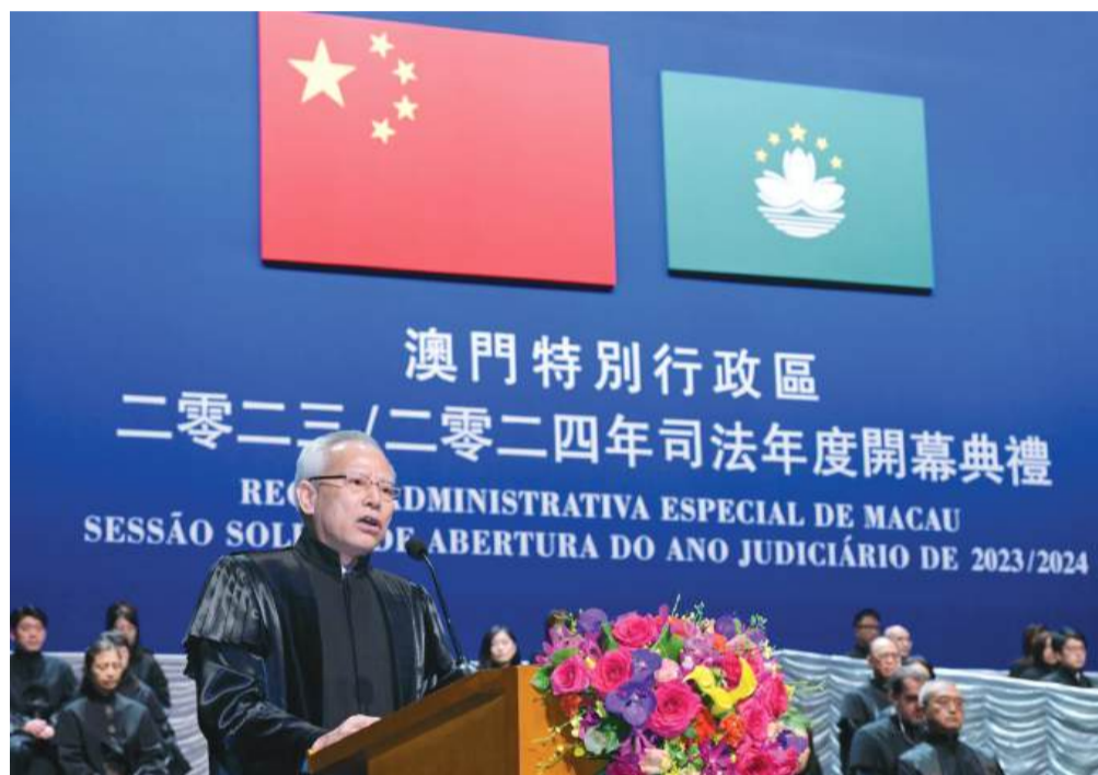
This handout photo provided by the Court of Final Appeal (TUI) shows its president Sam Hou Fai delivering a speech during the Solemn Opening Session of the 2023/2024 Judicial Year at the Macau Cultural Centre (CCM) on October 20 last year.

Born in Guangdong Province, Sam was admitted to the Peking University’s Law