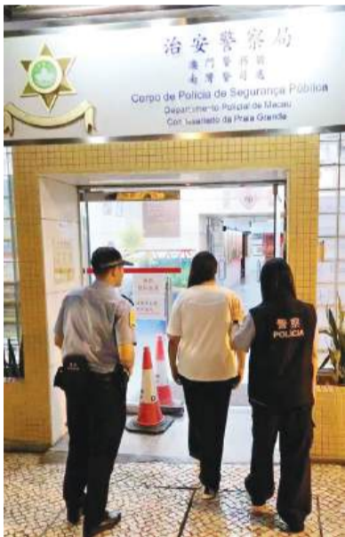
This undated photo provided by the Public Security Police (PSP) yesterday shows a PSP officer escorting the female theft suspect to the Nam Van Police Station.