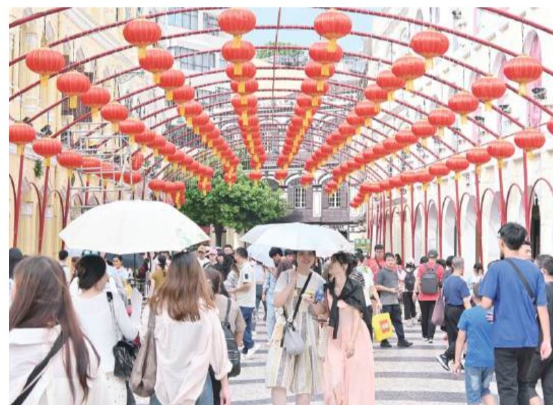
Tourists walk in the city's main square, Largo do Senado, on Sunday.

Sunday's statement also said that according to its provisional data, Macau recorded 5.90 million visitor arrivals between July 1 and Saturday last week, or a daily average of 107,313, returning to 91.9 percent of the level recorded in the same period of pre-pandemic 2019, while 302,229 foreign visitors were recorded during the period, reaching 74.9 percent of the level recorded in the same period of 2019. ■