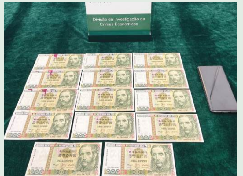
This undated handout photo provided by the Judiciary Police (PJ) yesterday shows the counterfeit HK banknotes.