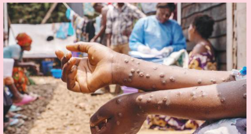
A patient suffering from mpox sits on a bench at Kavumu Hospital, 30 km north of Bukavu in eastern Democratic Republic of the Congo, on Saturday. – AFP

It causes fever, muscle pains and skin lesions and in an increasing number of cases, death. – AFP