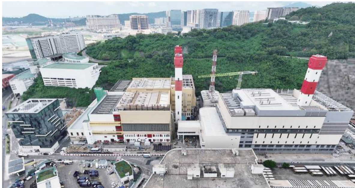
This undated handout photo released by the Environmental Protection Bureau (DSPA) shows the solid waste incineration complex at Pac On in Taipa including the first-phase and second-phase incineration plants (centre), the newly completed third-phase plant (right), and the newly completed administrative building (left, bottom).