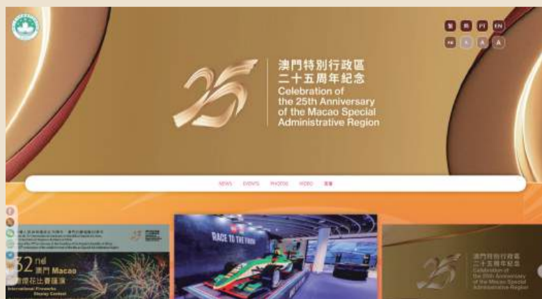
This screenshot captured last night shows the home page of the government's info website for MSAR's 25 th anniversary celebration.

the government will hold a raft of events soon enabling residents and visitors alike to celebrate the 25 th anniversary of the establishment