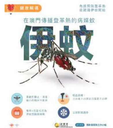
Poster in Chinese released by the Health Bureau (SSM) on Friday about Aedes albopictus mosquitoes.

As of last week, according to the SSM statement, 10,913 cases of dengue fever had been recorded in Singapore this year, a year-on-year increase of 96.13 percent compared to the same period of last year, while 90,533 cases had been reported in Malaysia, a year-