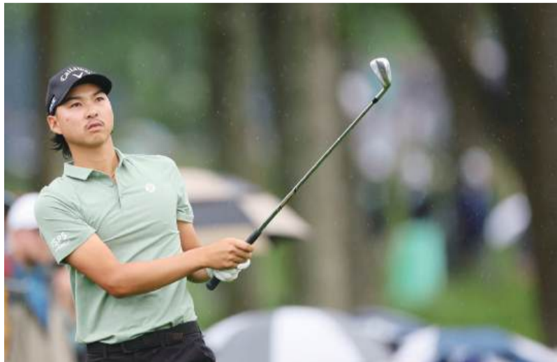
Photo shows Min Woo Lee at 2024 PGA Championship - Round Two on May 17, 2024 in Louisville, Kentucky.

Lee's score last year smashed the event's previous lowest winning