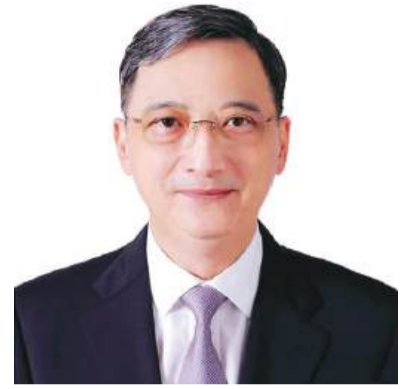
Undated file photo of lawmaker-cum-physician Chan Iek Lap

With the increasing demand for healthcare in the community, even though there has been an increase in the number of healthcare professionals in Macau in recent years, the problem of a shortage of public medical practitioners still exists. According to a statement by the Health Bureau in mid-June, the Macao Academy of