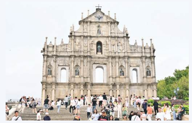
This recently taken photo shows visitors walking around the UNESCO World Heritage-listed Ruins of St. Paul's.

Enquiries can be made by calling the bureau on 2836 6320 during office hours. ■