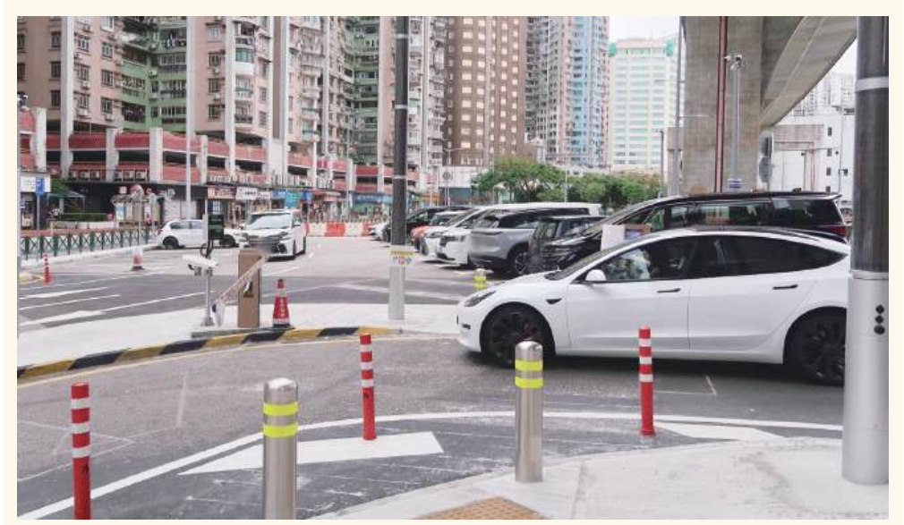
This photo taken in late May shows cars parked in the Estrada Governador Albano de Oliveira Open-air Public Carpark outside the now-defunct Macau Jockey Club in Taipa.

The new Light Rail Transit (LRT) Seac Pai Van section, which is scheduled to open at the end of this year, has two stations — one on Estrada do Istmo outside the Macao Union Hospital and the other one outside Coloane's sprawling Seac Pai Van public housing community.