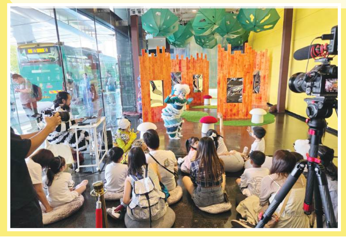
Performers act as butterflies at the end of the play.

*https://www.macaupostdaily.com/news/18698