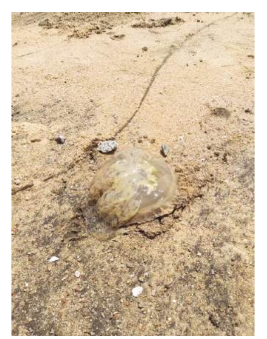
This undated handout photo released by the Marine and Water Bureau (DSAMA) yesterday shows a jellyfish found at one of Coloane's two beaches.

According to the DSAMA website, when the yellow flag is hoisted on a beach it means