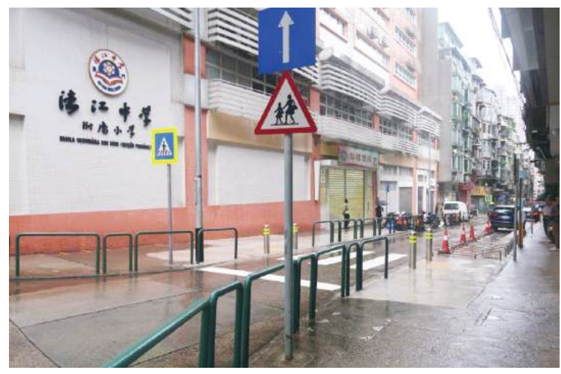
This undated handout photo along with a joint statement provided by the Transport Bureau (DSAT), Public Security Police (PSP) and the Education and Youth Development Bureau (DSEDJ) yesterday shows a pedestrian crossing in front of Hou Kong Middle School (Primary Section) on Rua de Afonso de Albuquerque.

The statement quoted the Transport Bureau's commitment during the meeting that most of the roadworks carried out during the summer holidays will be completed