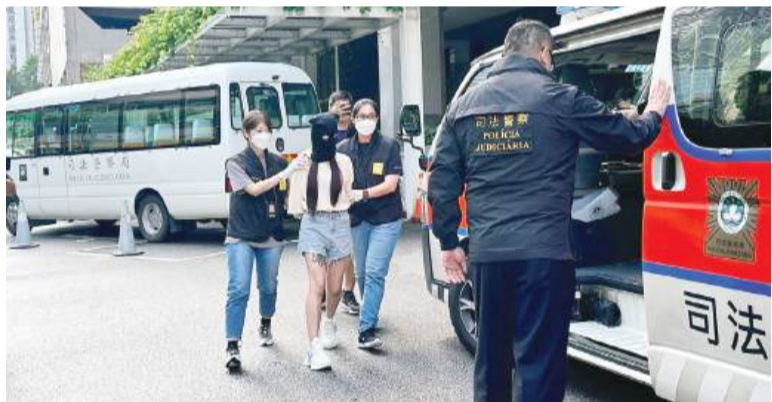
Judiciary Police (PJ) officers escort the hooded fraud suspect from Hong Kong involving a "guess who I am" phone scam from the PJ headquarters in Zape to a PJ vehicle yesterday.