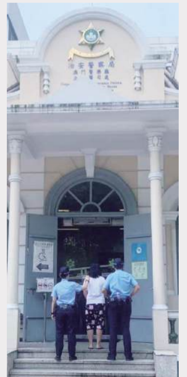
This undated handout photo provided by the Public Security Police (PSP) yesterday shows two PSP officers escorting the theft suspect to the police station in the northern district.

The woman has been transferred to the Public Prosecutions Office (MP), facing a theft charge, according to the spokesperson. ■