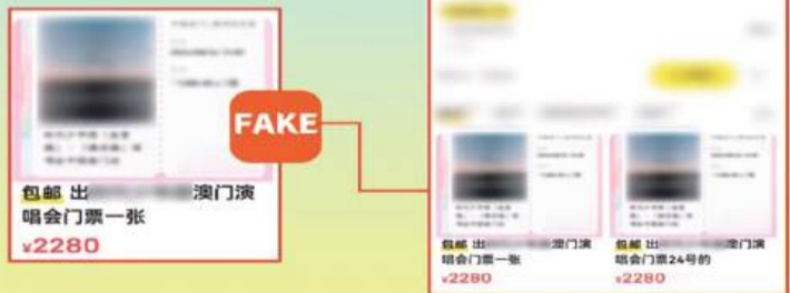
This poster provided by the Judiciary Police (PJ) yesterday warns members of the public about a concert ticket scam.

Renowned Boy Band from Mainland China held concert in Macao Over 20 "fans" fell prey to concert ticket scam