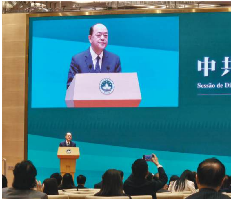
Chief Executive Ho Iat Seng delivers a speech during yesterday afternoon's seminar to promote the spirit of the third plenary session of the 20 th Central Committee of the Communist Party of China (CPC).

Particularly in economic and trade cooperation and cultural exchange with Portuguese-speaking