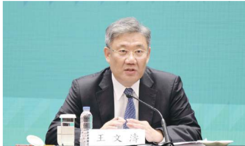
Minister of Commerce Wang Wentao (left) and Shen Chunyao, a vice chairman of the National People's Congress (NPC) Constitution and Law Committee and the director of the Legislative Affairs Commission of the NPC Standing Committee, address yesterday afternoon's session about the spirit of the third plenary session of the 20 th Central Committee of the Communist Party of China (CPC), at the Forum Macao Complex.

The MSAR government held two sessions yesterday, one in the morning and the other in the