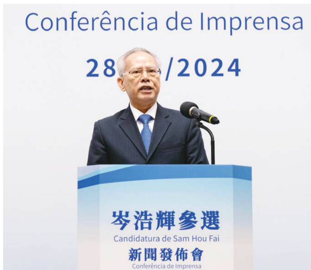
Sam Hou Fai announces his candidacy for the sixth-term chief executive election during yesterday's press conference at the Macau Science Centre in Nape.

Macau's former chief judge added that in the past 25 years since Macau's return to the