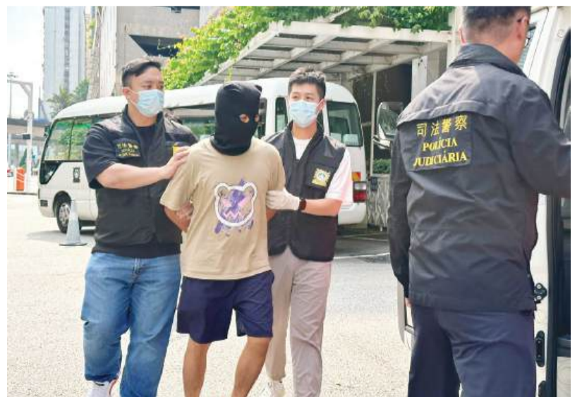
Judiciary Police (PJ) officers escort the hooded fraud suspect from the mainland involved in a “guess who I am” phone scam from the PJ headquarters in Zape to a PJ vehicle yesterday.