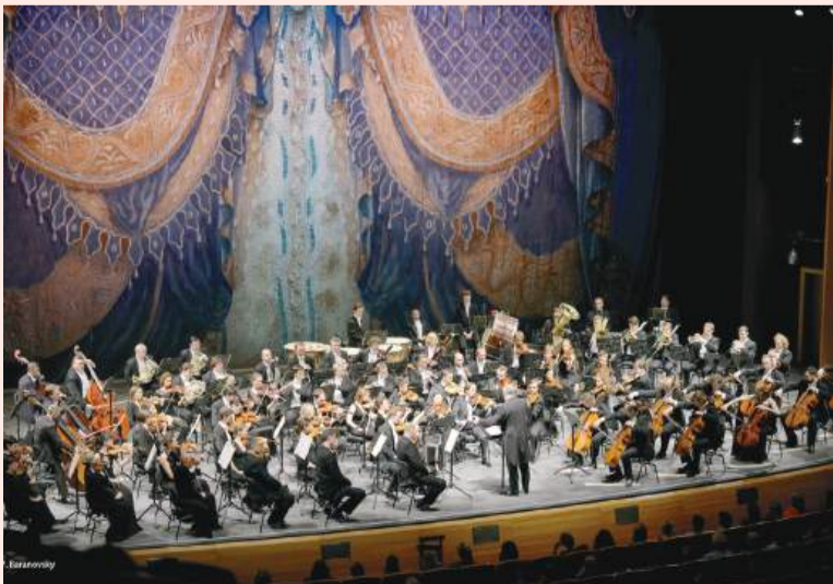
This undated handout photo provided by the Cultural Affairs Bureau (IC) yesterday shows a performance by the Mariinsky Orchestra.

More information can be found on www.icm.gov.mo/fimm and the "Macao International Music Festival" Facebook page. ■