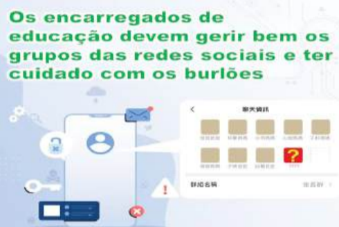
This poster provided by the Judiciary Police (PJ) yesterday warns residents to stay vigilant of fraudsters pretending to be school staff personnel or class teachers in group chats in communication software.