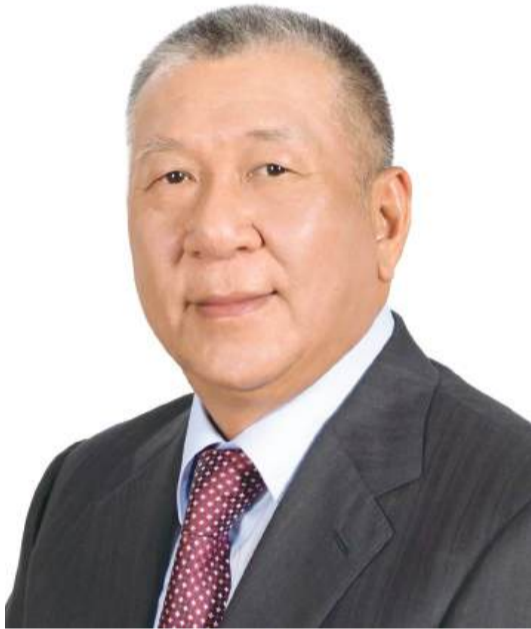
Undated file photo of National Committee of the Chinese People's Consultative Conference (CPPCC) Vice President Edmund Ho Hau Wah.

Praises outgoing CE Ho Iat Seng for 'constructive projects'