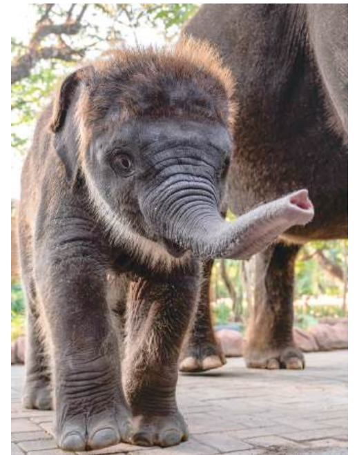
A male Sumatran elephant calf named Rocky Balboa, born on May 25, stands next to his mother, a 40-year-old elephant named Lembang, at the Surabaya Zoo during the introduction of the 3-month-old calf to the public in Surabaya on Saturday.

The city-state carries out the death penalty by hanging.