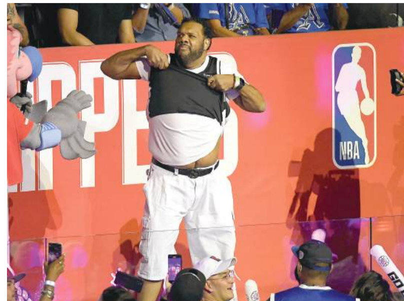
US Rapper Fatman Scoop performs during a time out in the second half in game four of the Western Conference Finals between the Phoenix Suns and the LA Clippers at Staples Center on June 26, 2021 in Los Angeles, California.

Hip-hop star Missy Elliott wrote on X that Scoop's “voice and energy