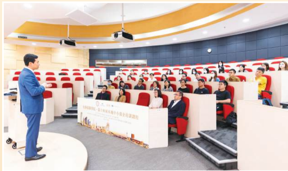
This undated handout photo provided by Sands China yesterday shows participants of the Sands Procurement Academy during a lesson at The Venetian Macao's Adelson Advanced Education Centre.

One can also call 8118 7866 for enquiries.