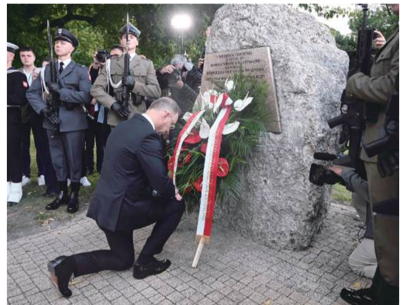
Poland's President Andrzej Duda lays a wreath at the monument in memory of victims of the Nazi bombing on September 1, 1939, following the ceremony marking the 85th anniversary of the start of World War II in Wielun early yesterday.

Polish President Andrzej Duda took part in commemorations in the