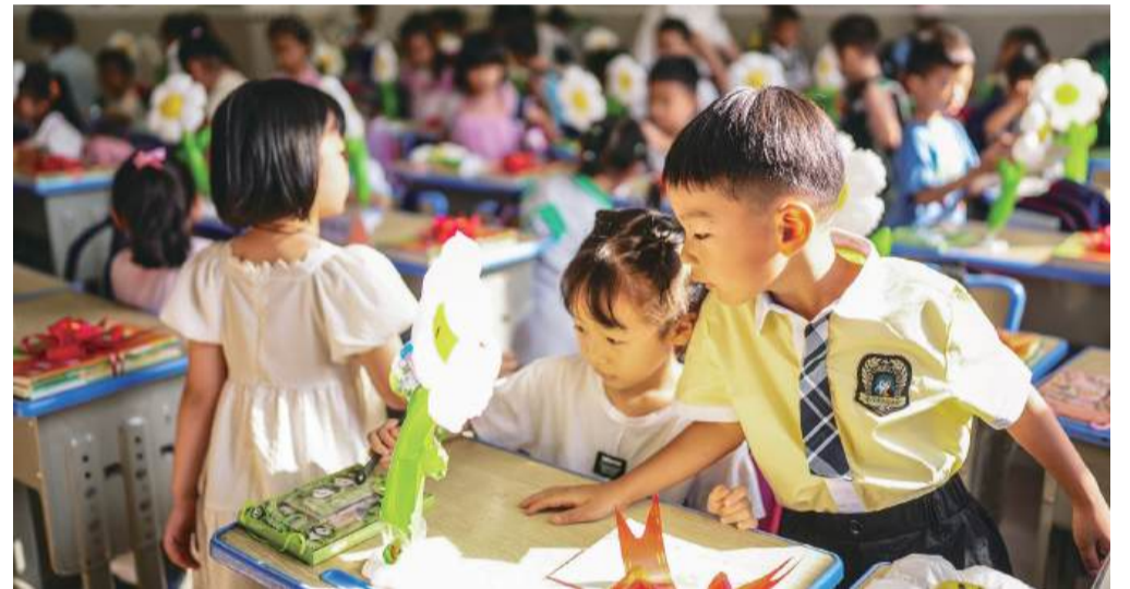
First graders sort out their desks at a primary school in Guiyang, Guizhou Province, yesterday. Schools across mainland hosted activities to mark the start of the new semester yesterday. — Xinhua

The summer travel rush is usually a busy season for the country's railway system as college students return home for the summer vacation, while family visits and tourist trips also increase during the period. — Xinhua