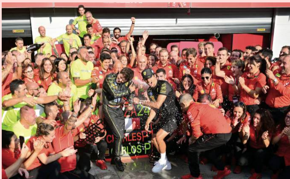
Ferrari's Monegasque driver Charles Leclerc (centre, left) celebrates with his team after winning the Italian Formula One Grand Prix race at Autodromo Nazionale Monza circuit, in Monza yesterday.