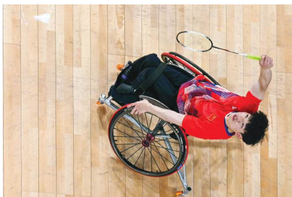
▲ China's Qu Zi Mo plays a shot as he competes in the Badminton Men's singles WH1 semi-final at La Chapelle Arena in Paris yesterday, during the Paris 2024 Paralympic Games.