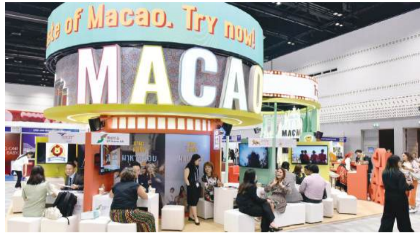
This undated handout photo provided by the MGTO on Wednesday shows the Macau travel trade network during Pacific Asia Travel Association (PATA) Travel Mart, which was held from August 27 to 29 in Bangkok.