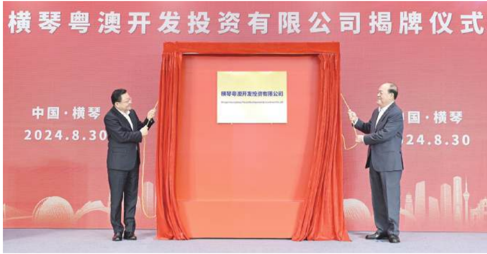
Chief Executive Ho Iat Seng (right) and Guangdong Governor Wang Weizhong unveil the inaugural plaque of the newly established Hengqin Guangdong-Macau Development and Investment Company Limited in Hengqin on Friday.

The Macau government's current 1+4 appropriate economic diversification model aims to consolidate and diversify the development of the city's tourism and leisure industry while putting special emphasis on promoting the development of four nascent industries, namely 1) big health mainly driven