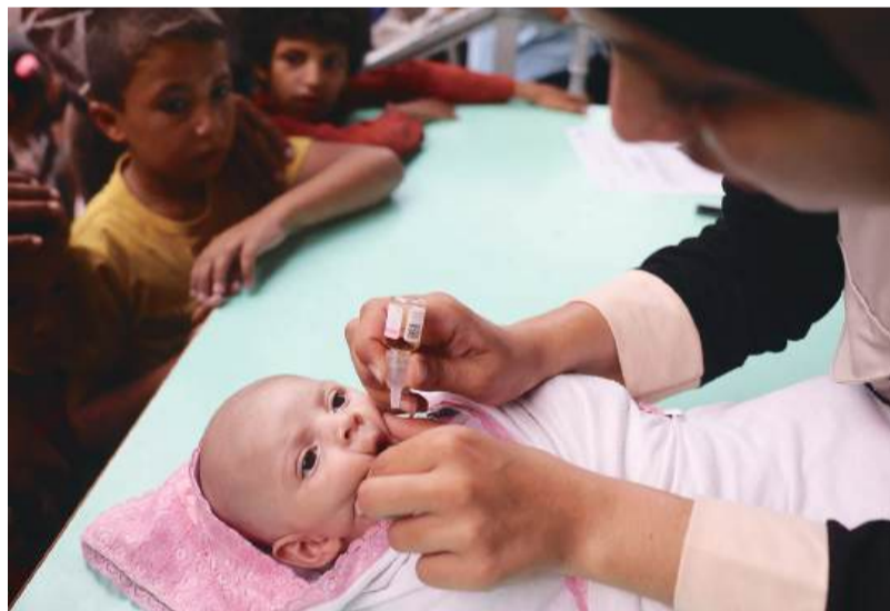
A health worker administers the Polio vaccine to a baby in Zawayda in the central Gaza Strip yesterday, amid the ongoing conflict between Israel and the Palestinian militant group Hamas. – AFP

Yesterday, rescuers in the Gaza Strip said 10 people had been killed in Israeli bombardment and an air strike. – AFP