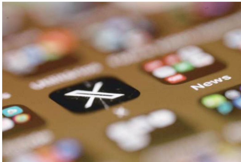
Photo illustration of the logo of the social media platform X (formerly Twitter) in Rio de Janeiro, Brazil on Saturday.

Meanwhile, Musk will want to watch out if he challenges Moraes to a cage fight, as he did with fellow tech titan Mark Zuckerberg – and as some internet wags have been hoping: Moraes has studied “muay thai,” the martial art known as Thai boxing.