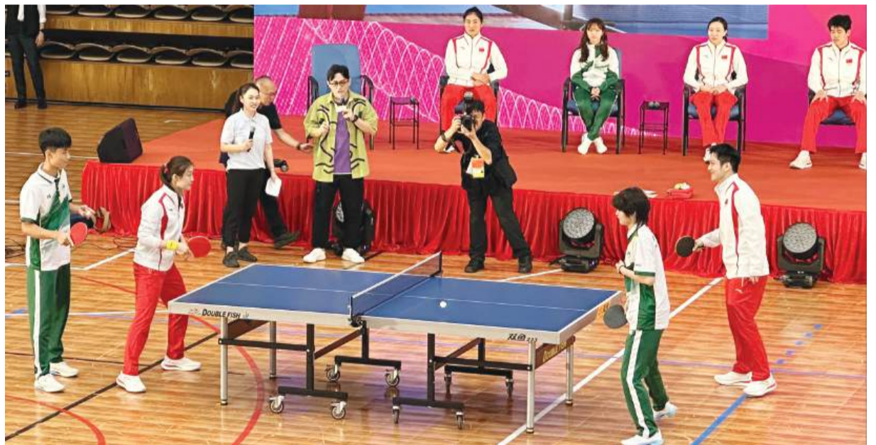
Men's singles and women's singles gold medallists Fan Zhendong (right) and Chen Meng (left) as well as two local paddlers play mixed doubles after yesterday's exchange session at the Olympic Sports Centre in Taipa.