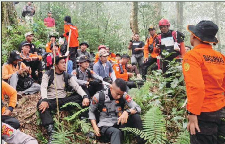
This handout photograph released by Tabanan's Regional Disaster Management Agency yesterday shows rescue personnel during their week-long joint search mission since August 26, to locate a missing French teenager who disappeared while trekking on Mount Batukaru, in Bali.