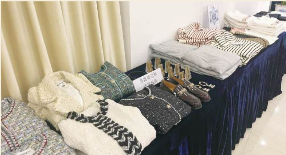
A total of 57 bogus clothing items seized on Thursday, displayed at the Macau Customs Service (SA) headquarters in Barra.

The spokesperson said that the suspect has been transferred to the Public Prosecution Office (MP). According to the Industrial Property Code Decree-Law No 97/99/M, the suspect faces a hefty fine and up to six months in jail. ■