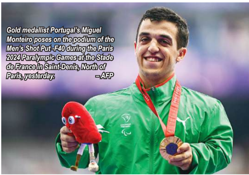
Gold medalist Portugal's Miguel Monteiro poses on the podium of the Men's Shot Put-F40 during the Paris 2024 Paralympic Games at the Stade de France in Saint-Denis, North of Paris, yesterday.