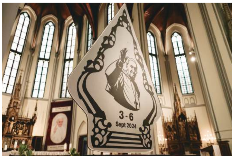
A signboard welcoming Pope Francis is displayed at the Jakarta Cathedral in Jakarta on Friday. By embarking aged 87 on the farthest journey of his papacy, Pope Francis is doing something some believed impossible - and seeking to silence those who doubt his ability to fulfil his role. The pontiff's 12-day trip to Indonesia, Papua New Guinea, East Timor and Singapore starting next week involves 43 hours of flight time and a distance of 32,000 kilometres.

Francis will take most of the first day in Jakarta to recover from the flight, and the next day hold talks with outgoing President Joko Widodo, as well as separate meetings with a group of young people, diplomats and local clergy.