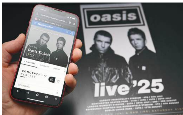
A fan uses a smart phone to access an on-line ticket sales website to purchase tickets for Oasis' “Live ‘25” tour taking place in 2025, at home in Marsden, northern England on Saturday. Millions of Oasis fans queued online early Saturday to buy tickets for the British legends' eagerly-awaited reunion tour next year, but many were frustrated after booking websites appeared overwhelmed.

Once the “Outlaws” frenzy dies down, connoisseurs will shift their attention to “Star Wars Eclipse”, a space epic by French studios Quantic Dream, who have yet to announce a release date.