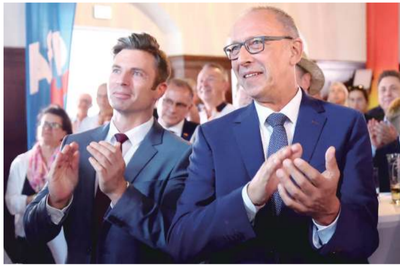
Joerg Urban (right), top candidate of the far-right Alternative for Germany party (AfD) reacts after the first exit polls during the party's election night in Dresden, eastern Germany, yesterday.

BSW scored between 14.5 and 16 percent in Thuringia and between 11.5 and 12 percent in Saxony, according to the polls.