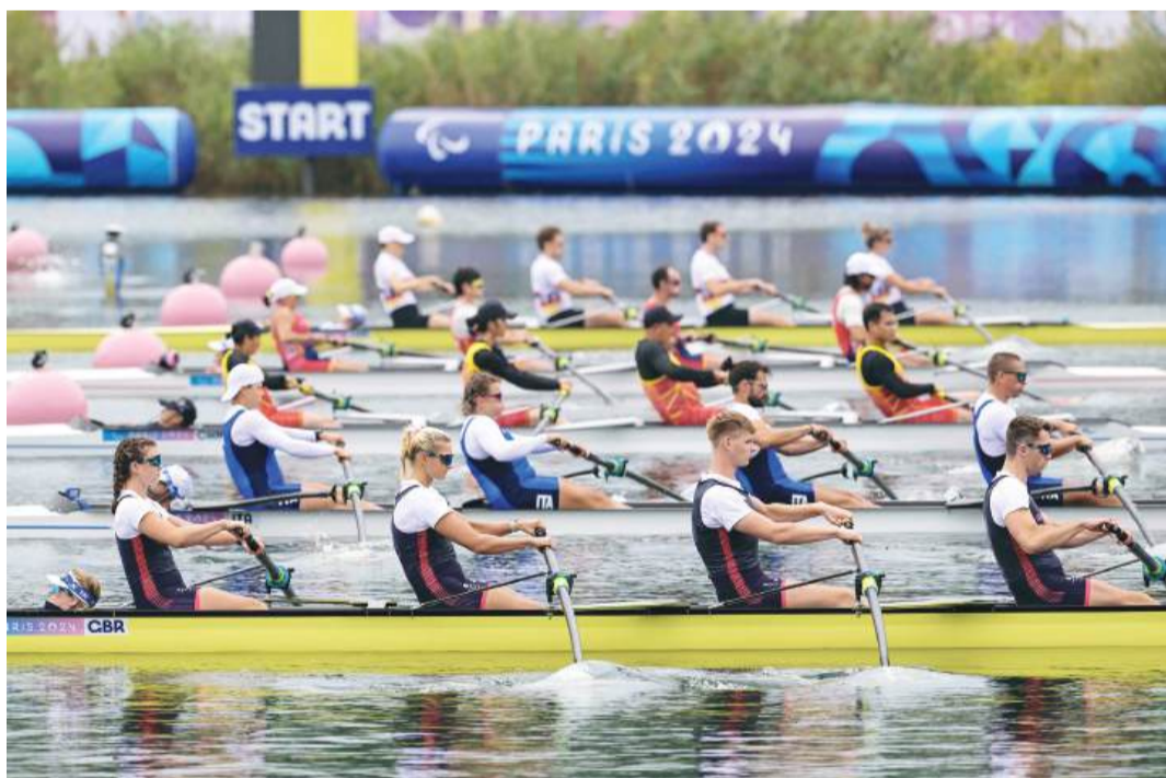
▲ Great Britain, (from front to back) Italy, China, Spain and Germany compete in the PR3 mixed coxed four with coxswain heat 1 rowing event of the Paris 2024 Paralympic Games at Vaires-sur-Marne Nautical Centre in Vaires-sur-Marne, east of Paris, on Friday.