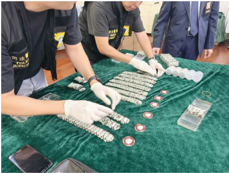
This photo taken on Friday shows Judiciary Police (PJ) officers displaying the seized fake chips during Friday's special press conference at the Judiciary Police (PJ) headquarters.