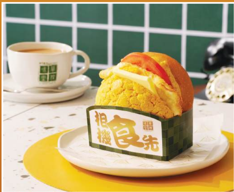
This undated handout photo recently provided by Galaxy Macau shows the "Waso Signature Pineapple Bun" and the "Hong Kong-Style Milk Tea"