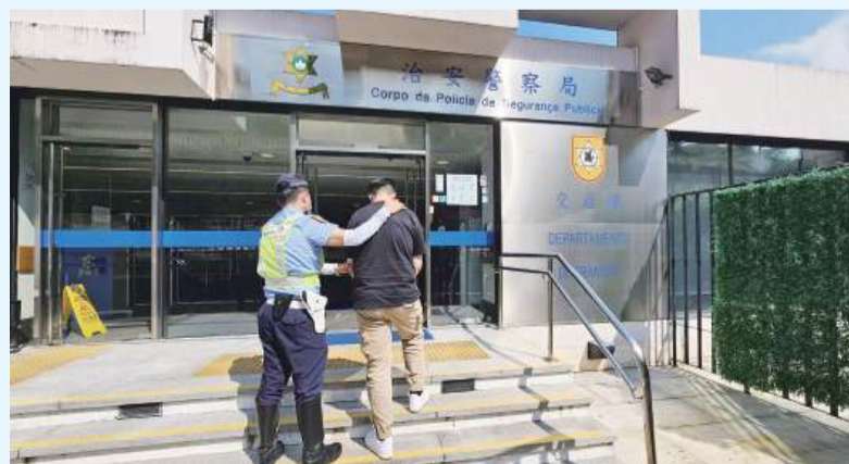
This undated photo provided by the Public Security Police (PSP) yesterday shows a PSP officer escorting one of the drunk driving suspects to the Traffic Police Headquarters.