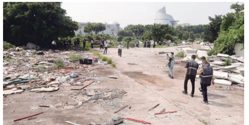
This DSSCU photo shows government officials repossessing the plot near the Macau Science Centre (MSC) yesterday.