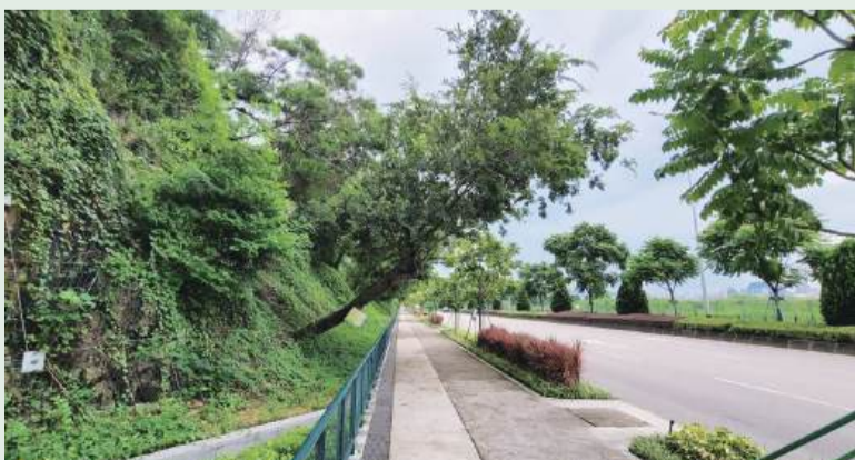
This undated handout photo provided by the Municipal Affairs Bureau (IAM) yesterday shows a heavily leaning Chinese hackberry tree on Estrada Almirante Marques Esparteiro in Taipa.

If anyone finds a tree displaying any abnormalities, they should call the bureau on 2833 7676 or report the issue on the IAM website: https://app.iam.gov.mo/iamconnect . ■