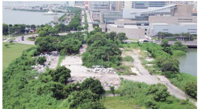
This handout photo released by the Lands and Urban Construction Bureau (DSSCU) yesterday shows the illegally occupied plot near the Macau Cultural Centre (CCM) in Nape.

As the occupants had still not cleared the items and returned the plot to the government after the deadline, the statement said, DSSCU officials, in collaboration with officials from several other government entities, took action