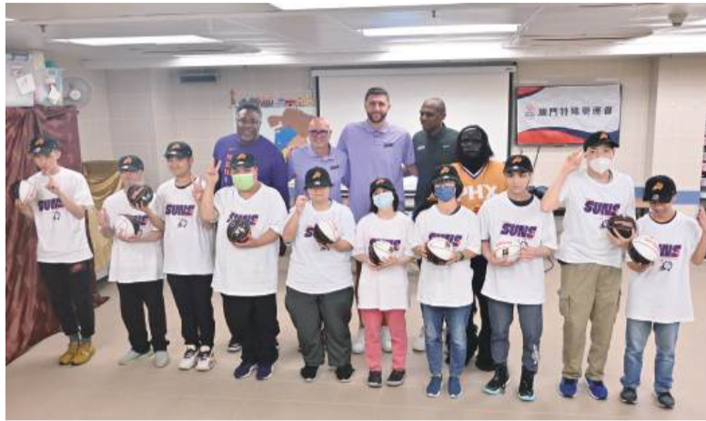
Suns legends Cedric Ceballos (2nd row, left to right), Rex Chapman, Phoenix Suns' Starting Centre Jusuf Nurkić, Phoenix Suns President, General Manager and former NBA player James Jones, and the team's mascot "Go the Gorilla" pose with Macau Special Olympics' young athletes and their souvenirs at Ngai Chun Services Complex at Seac Pai Van yesterday.