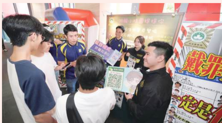
This undated handout photo provided by the Judiciary Police (PJ) yesterday shows PJ officers interacting with students on the Macao Polytechnic University (MPU) campus in Zape during the ongoing "Crime Prevention Week" series activities.

The Judiciary Police will continue to study and adjust various prevention strategies in response to the trend of telecommunication network fraud crimes, and maintain close contact and cooperation with the education sector, so as to enhance students' anti-fraud awareness, the statement pointed out. ■