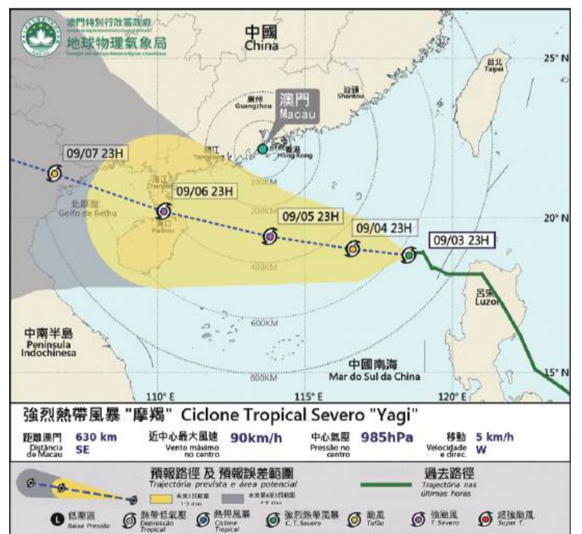
This graphic provided by the Meteorological and Geophysical Bureau (SMG) at 11 p.m. yesterday shows the projected trajectory of Tropical Storm Yagi moving westwards towards the South China Sea.

Another statement issued yesterday by the Macau Productivity and Technology Transfer Centre (CPTM) and the Economic and Technological Development Bureau (DSEDT) appealed to business operators, especially small and medium-sized enterprises (SMEs) located in low-lying areas to make proper preparations and take precautionary measures against flooding and rainstorms in order to avoid loss of goods and equipment. ■