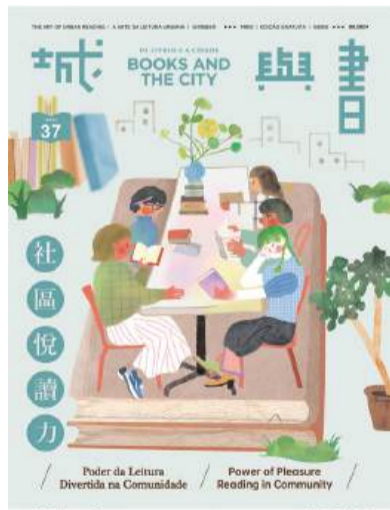
This image provided by the Cultural Affairs Bureau (IC) yesterday shows the front cover of the 37 th issue of the "Books and the City" magazine.

More details and the magazine's online version are on www.library.gov.mo . ■