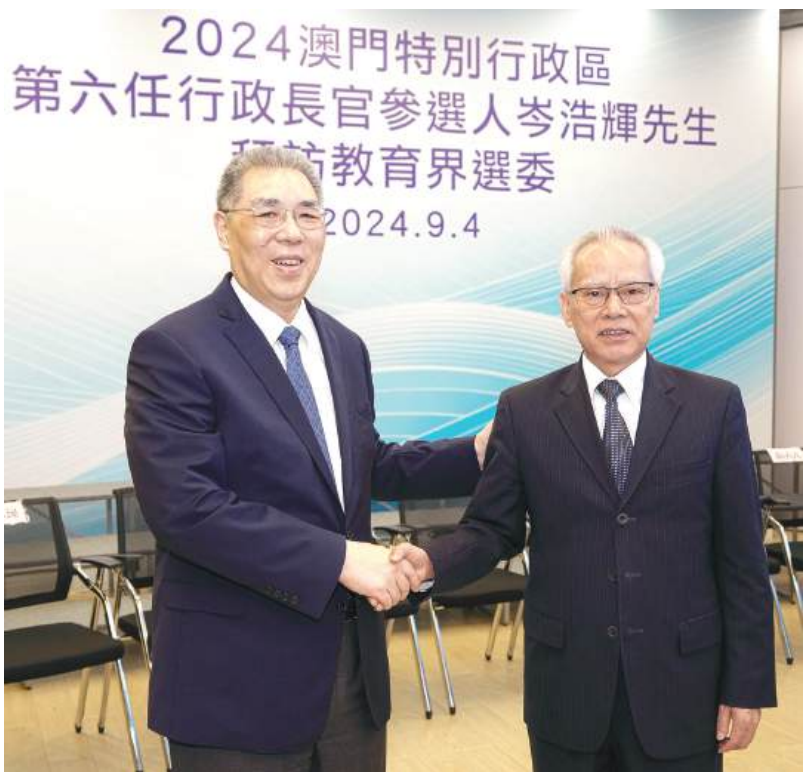
This handout photo provided by the Sam Hou Fai Election Campaign Office yesterday shows Fernando Chui Sai On – Macau's third- and fourth-chief executive – and potential sixth-term chief executive candidate Sam Hou Fai shaking hands on the sidelines of yesterday's meeting with all 29 members of the 400-member Chief Executive Election Committee's education sector constituency, at The Chinese Educators Association of Macau on Rua do Campo.