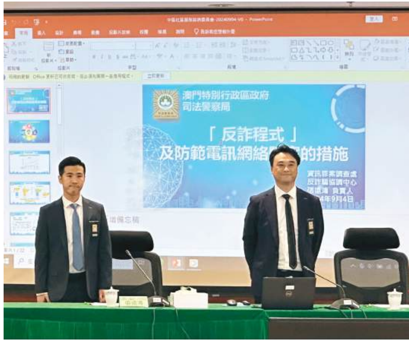
Two senior Judiciary Police (PJ) officers address the government-appointed committee's regular meeting at the Patane Activity Centre yesterday.