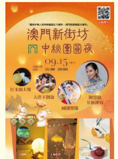
This poster provided by Macau Urban Renewal Limited earlier this week promotes the upcoming "Mid-Autumn Festival at Macau New Neighbourhood" event at MNN in Hengqin.