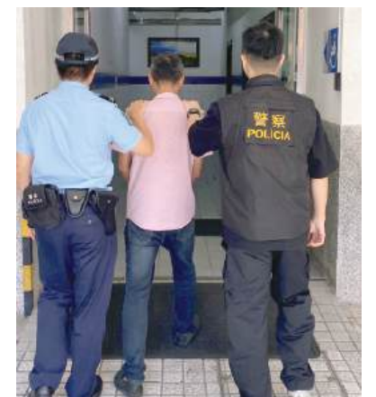
This undated handout photo provided by the Public Security Police (PSP) yesterday shows the mainland theft suspect being escorted by PSP officers to a police station in Taipa.