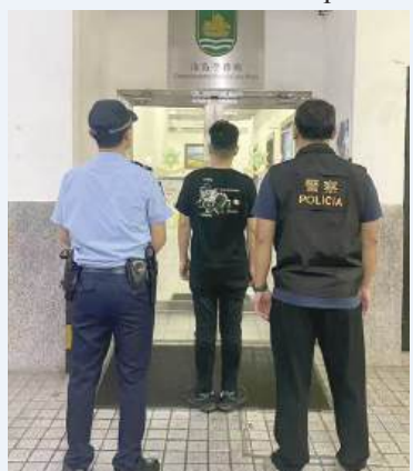
This undated handout photo provided by the Public Security Police (PSP) yesterday shows the mainland fraud suspect being escorted by PSP officers to a police station in Taipa.

The two suspects have been transferred to the Public Prosecutions Office (MP), facing fraud charges. ■