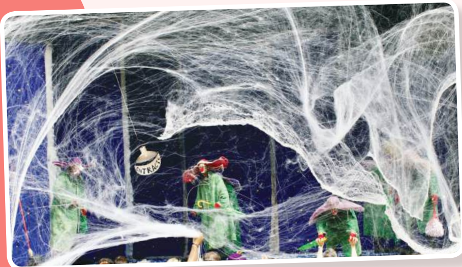
These undated handout photos provided by the Macau Cultural Centre (CCM) yesterday shows various performances of Slava's Snowshow.