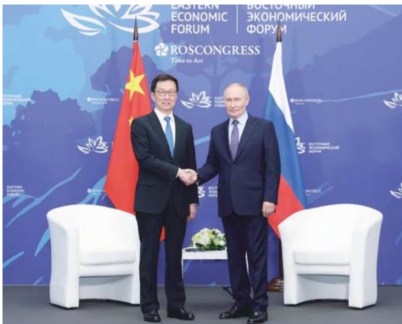
Vice President Han Zheng (left) shakes hands with Russian President Vladimir Putin in Vladivostok, Russia, yesterday.

for the 9 th Eastern Economic Forum and asked him to convey his cordial greetings and best wishes to Xi.