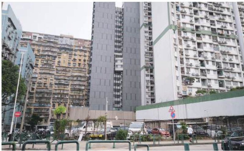
This photo taken yesterday shows an undeveloped plot in Toi San district, which is currently being used as an open-air private carpark and will be earmarked for a hotel project, with the grey high-rise next to the plot being a budget hotel, Jin Jiang Inn, which opened in 2019.

The plot earmarked for the new hotel project is located on the corner of Travessa do Canal das Hortas and Rua da Fábrica, situated in the northern part of Toi San district,