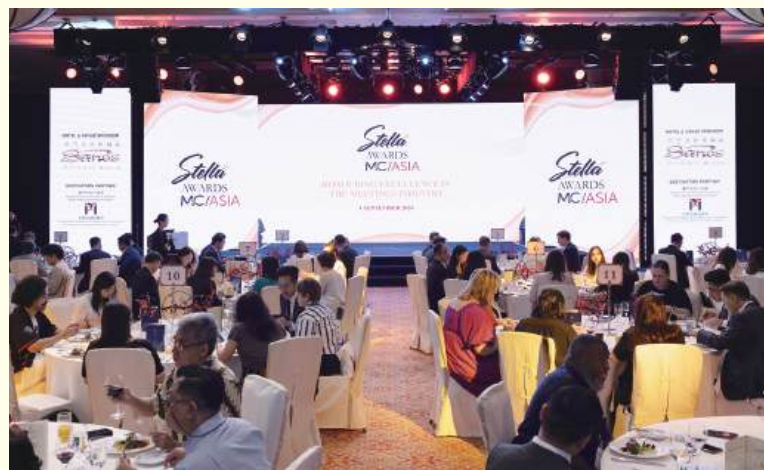
This handout photo released by the Commerce and Investment Promotion Institute (IPIM) yesterday shows the M&C Asia Connections event held in Cotai in Macau yesterday.

The statement noted that the M&C Asia Connections event is organised by Northstar Meetings Group headquartered in Singapore. ■