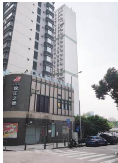
This photo taken yesterday shows the Jin Jiang Inn, with its adjacent plot earmarked for a new hotel project (right).