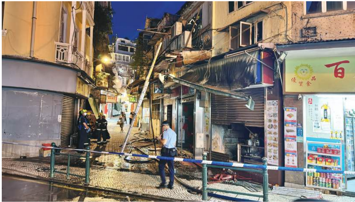
Firemen stand in front of the fire-gutted takeaway and clothes shop on Rua dos Mercadores yesterday evening after extinguishing a smoky blaze which broke out on the first floor of the takeaway early in the morning.

The firefighters immediately pried open the door, and found a fire inside the takeaway, the roof of which had already collapsed, while the blaze had meanwhile spread to a shop next to it, the statement said, adding that the takeaway has a wooden interior structure.