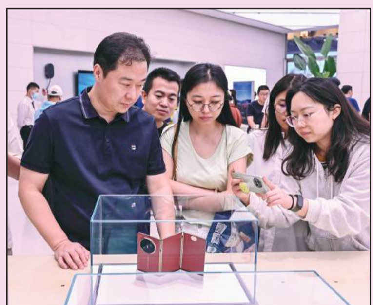
Visitors take pictures of Huawei Mate XT, a new triple-folding phone, at a Huawei store in Beijing yesterday. Chinese tech giant Huawei yesterday unveiled the world's first triple-folding phone at more than three times the price of the newest iPhone, hours after its US competitor lifted the curtain on its own new handset built for AI. (More on p.7)

Macau's most popular English-language newspaper – Your trustworthy source of news & views