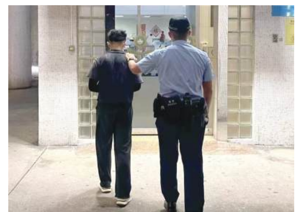
This undated handout photo provided by the Public Security Police (PSP) yesterday shows the local theft suspect being escorted by a PSP officer to a police station.