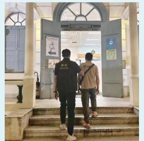
This undated handout photo provided by the Public Security Police (PSP) yesterday shows the sexual harassment suspect being escorted by a PSP officer to a police station in the northern district.

The man has been transferred to the Public Prosecutions Office (MP), facing a sexual harassment charge, according to the spokesperson. ■