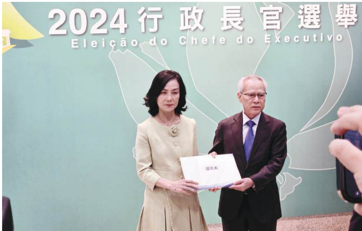
Potential chief executive candidate Sam Hou Fai submits his nomination form to a representative of the Electoral Affairs Commission for the Chief Executive Election (CAECE) yesterday morning at the Public Administration Building on Rua do Campo.

Sam underlined that when he decided to run the campaign, he did