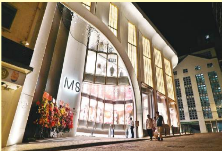
Pedestrians last night walk past M8, which, according to a statement provided by the mall last night, holds the Guinness World Record for the "Largest Curved Stone-Laminated Glass".