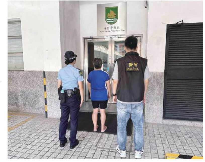
This undated handout photo provided by the Public Security Police (PSP) yesterday shows two PSP officers escorting the local suspect to a police station in Taipa.

Under questioning, the local suspect, surnamed Wong, admitted that she began selling the tickets after she started operating her newspaper stand in July 2022, which "a man" had suggested she do, reselling each Mark Six lottery