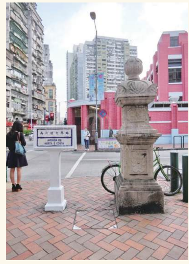
This undated photo downloaded from the website of the government's Macau Foundation's (FM) Macau Memory shows

The bureau has preliminarily concluded that the company has "cut corners" in carrying out the project, the statement said, adding that as the case involves fraud, the bureau has reported the case to the police.