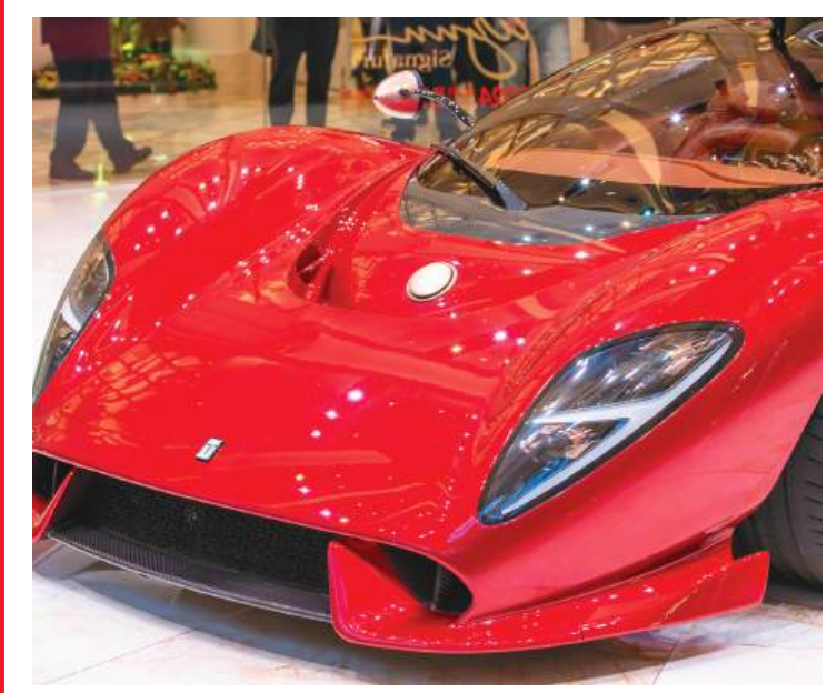
This undated handout photo provided by Wynn Resorts on Wednesday shows the De Tomaso P72 displayed at the South Atrium of Wynn Palace in Cotai.

* The De Tomaso P72 is a sports car manufactured by the Italian automobile manufacturer De Tomaso. Based on the underpinnings of the Apollo Intensa Emozione, the P72 is designed as an homage to the De Tomaso P70 prototype racing car. – Source: Wikipedia