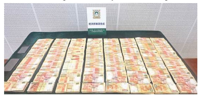
Evidence seized from the fraud suspect ts such as two smartphones and cash is displayed at the Judiciary Police (PJ) headquarters yesterday.

PJ officers retrieved a HK$2.4 million of the ill-gotten cash