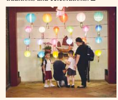
A family tries to solve lantern riddles at the Mandarin's House yesterday evening.

Meanwhile, Albergue SCM located on Calçada da Igreja de S. Lázaro hosted its own Mid-Autumn Garden Party. The celebration featured free snacks, live music performances, and special lantern displays. As an added attraction, artists gave live demonstrations of lantern painting, offering visitors the opportunity to immerse themselves in the Mid-Autumn Festival traditions and celebrations.