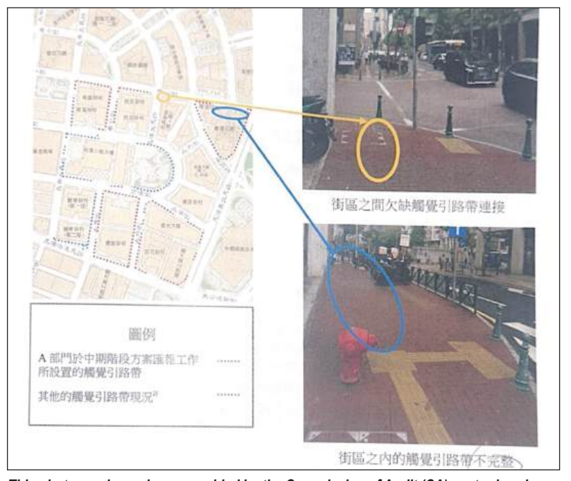
This photo combo and map provided by the Commission of Audit (CA) yesterday shows some projects with a lack of tactile guide path connections to major public places.

In addition, the completion time and exact task as well as the workload were not clearly specified