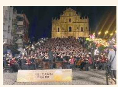
The Macao Chinese Orchestra (OCHM) performs at the Ruins of St. Paul's last night.