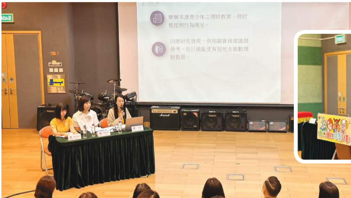
Young Men's Christian Association of Macau (YMCA) representatives present the findings of their survey on the attitudes and behaviours of young local people towards financial management, during yesterday's press conference at the Social Welfare Bureau's (IAS) Healthy Life Education Centre in Areia Preta.