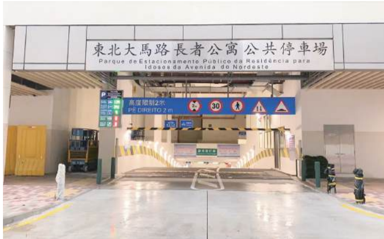
This undated handout photo released by the Transport Bureau (DSAT) yesterday shows the entrance and exit of the Plot P seniors' rental residential building's public carpark, which will open tomorrow.

According to the statement, the new public carpark, which will start