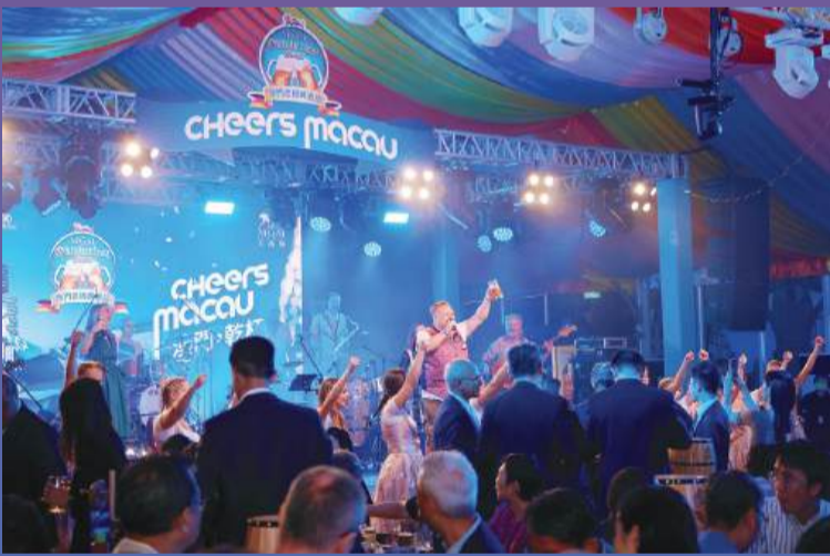
This undated handout photo recently provided by MGM shows Germany’s Högl Fun Band performing during a previous edition of Oktoberfest Macau at MGM.