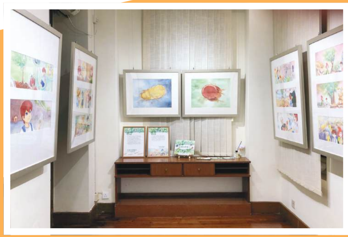
These photos taken last week show the Picture Book Festival exhibitions at 10 Fantasia.