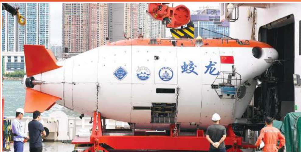
Manned submersible Jiaolong ("Flood Dragon"), onboard China's research vessel Deep Sea No. 1, is readied for public display at Tsim Sha Tsui Ocean Terminal in Hong Kong where it arrived yesterday, the ship's first visit to the special administrative region. The vessel and deep-sea submersible are on their home-bound voyage after completing a scientific mission in the Western Pacific Ocean. During their two-day stay in Hong Kong, scientists on board will give lectures to Hong Kong students and hold a number of international seminars to share the results of their latest scientific expedition.