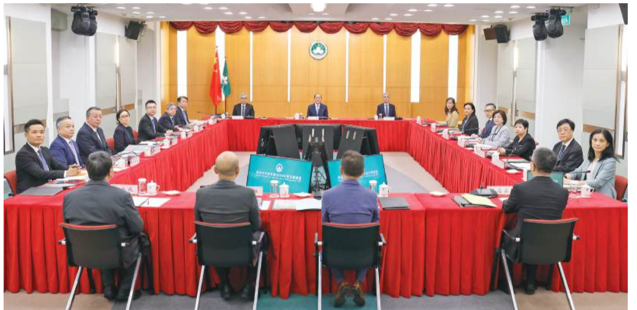
This handout photo provided by the Government Information Bureau (GCS) shows Chief Executive Ho Iat Seng (centre) addressing the Cybersecurity Commission's annual plenary meeting at Government Headquarters on Avenida da Praia Grande yesterday.

bureaux and other public entities keep abreast of the times, coordinate development and security, enhance their awareness of risks, keep optimising and upgrading the level of cybersecurity governance, play an active role in the participation in the exchange and cooperation projects within the Guangdong-Hong Kong-Macau Greater Bay Area (GBA), and adopt a multi-pronged approach to improve the mechanism of cyber security management, while strengthening the capacity of cyber security protection. ■