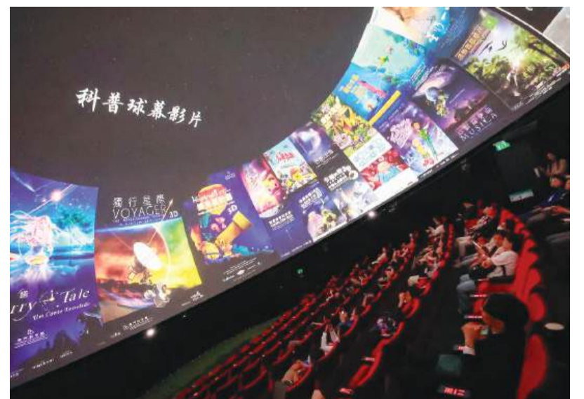
This handout photo provided by the Macau Government Tourism Office (MGTO) shows participants in yesterday’s educational tourism resources seminar at the Macau Science Centre (MSC) in Nape yesterday.

MGTO will continue to work hand in hand with the tourism industry and organisations in various fields to contribute to the development of educational tourism and Macau’s appropriate economic diversification, with a view to enhancing the attractiveness and influence of Macau as an educational tourism destination, the statement said. ■