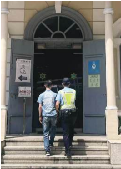
This undated photo provided by the Public Security Police (PSP) yesterday shows a PSP officer escorting the male drunk-driving suspect to a police station in the northern district.