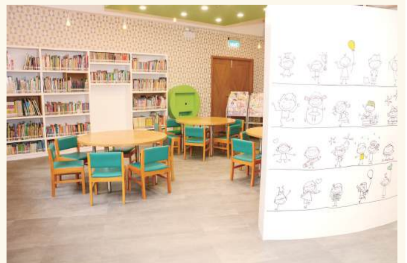
This undated handout photo downloaded from the website of the public libraries' network yesterday shows part of the current Ilha Verde Library.

The bureau said earlier this year that the new library will cover an area of 1,060 square metres, over double the size of the current Ilha Verde Library, which opened in 1995 and was revamped in 2017. ■