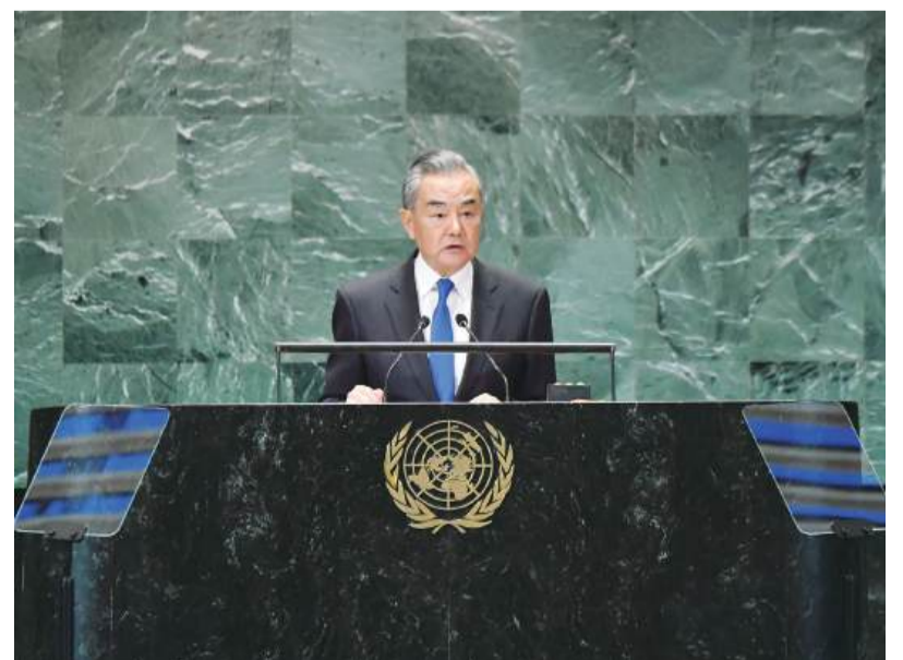
Wang Yi, special representative of Chinese President Xi Jinping, member of the Political Bureau of the Communist Party of China (CPC) Central Committee and foreign minister, addresses the UN Summit of the Future in New York on Monday.