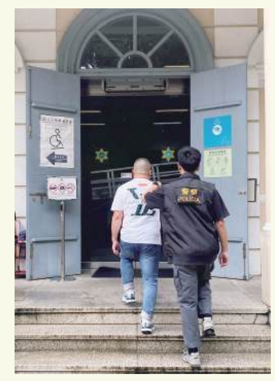
This photo provided by the Public Security Police (PSP) yesterday shows a PSP officer escorting the mainland theft-by-finding suspect to a police station on Tuesday.