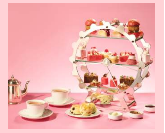
This undated handout photo provided by Conrad Macao earlier this week shows the PINK afternoon tea set at Churchill's Table at The Londoner Macao

For details, visit Conrad's Macao's Facebook and Instagram, or on <a href="https://www.">https://www.</a> londonermacao.com/offers/conrad-macao/ pink-inspired-2024.html ■