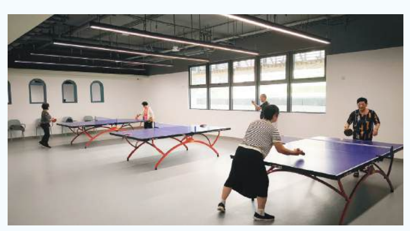
Seniors joining yesterday's tour play table tennis in the estate's indoor sports

According to yesterday's media tour, an area of the clubhouse will first be used for the Health Bureau's health facility on a temporary basis after the estate's operational start at the middle of next month. The health facility will be relocated to its permanent area on the same floor after its decoration is completed. ■