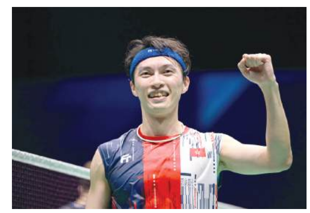
Men's singles champion Angus Ng Ka-long from Hong Kong celebrates his victory.