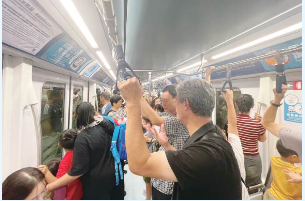
This photo taken yesterday afternoon shows LRT passengers stuck in one of the carriages during the breakdown.

The breakdown lasted for about an hour. According to a notice issued by the LRT