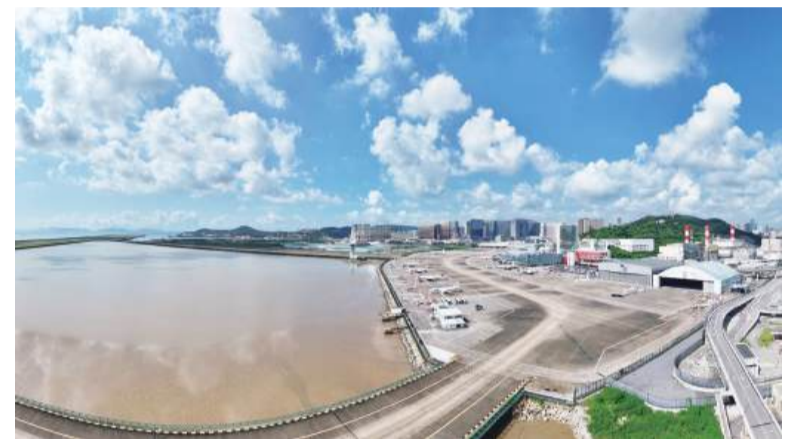
This undated handout photo released by CAM last night shows the local airport's apron.

The reclamation area will be 1.29 square kilometres. ■