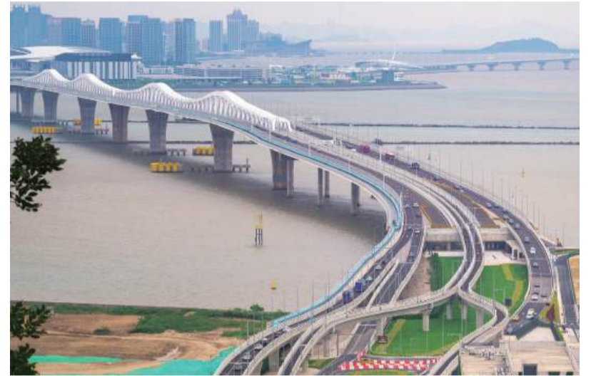
Vehicles travel on Macau Bridge soon after it opened on Tuesday afternoon.