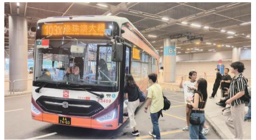
Passengers catch a No.103X bus at the Taipa Ferry Terminal on Wednesday.