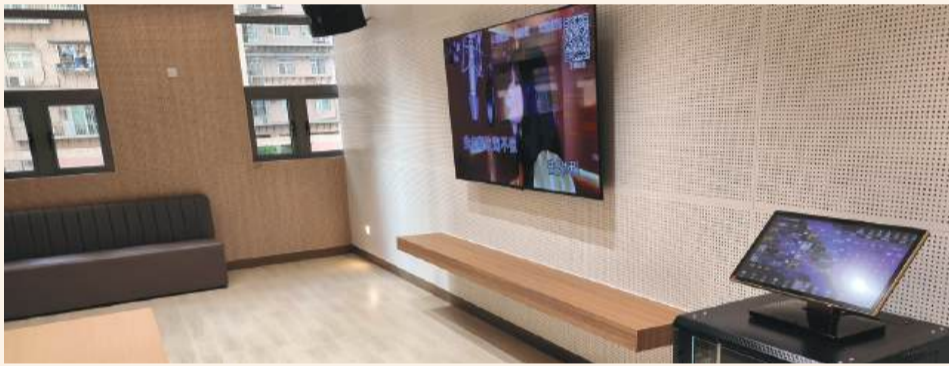
This photo taken during last week's media tour shows a karaoke room on the second floor of the Plot P seniors' rental housing estate.