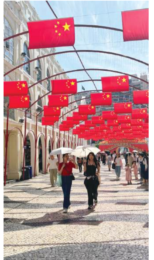
Tourists stroll along the city's main square, Largo do Senado, yesterday, the third of the mainland's seven-day National Day "Golden Week" holiday.

Meanwhile, according to a statement by the Public Security Police (PSP), PSP officers, between Wednesday and yesterday, accused a cabbie of malpractice involving driving at an inappropriate or illegal speed while carrying passengers, while they also referred a case of