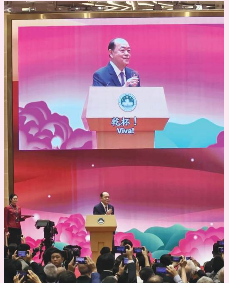
Macau Chief Executive Ho Iat Seng offers a toast during Tuesday morning's National Day reception at the Forum Macao Complex in Nam Van.

The chief executive, who had announced recently that for health reasons he had decided not to seek a second five-year term at the helm of the local government, also said that his administration