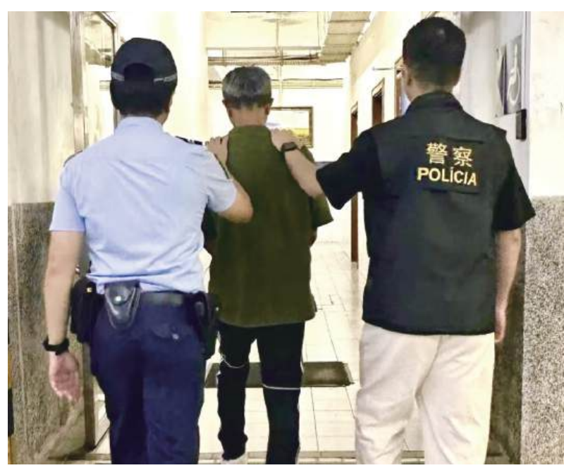
This undated photo provided by the Public Security Police (PSP) Friday shows a PSP officer escorting the male vandalism suspect to a police station in Taipa.

During the interrogation, the to move the victim's vehicle,