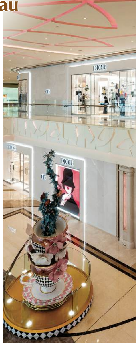
This undated handout photo shows the recently unveiled reinvented Dior Galaxy Macau boutique in Cotai.

The boutiques design, the statement said, is magnified by Dior codes – including Versailles parquet and cannage graphics – and punctuated by furniture that "combines audacity and sophistication in soft shades of white, beige and grey". Moreover, artworks by several artists are also showcased, while there is also VIP private shopping areas for both men and women, according to the statement.