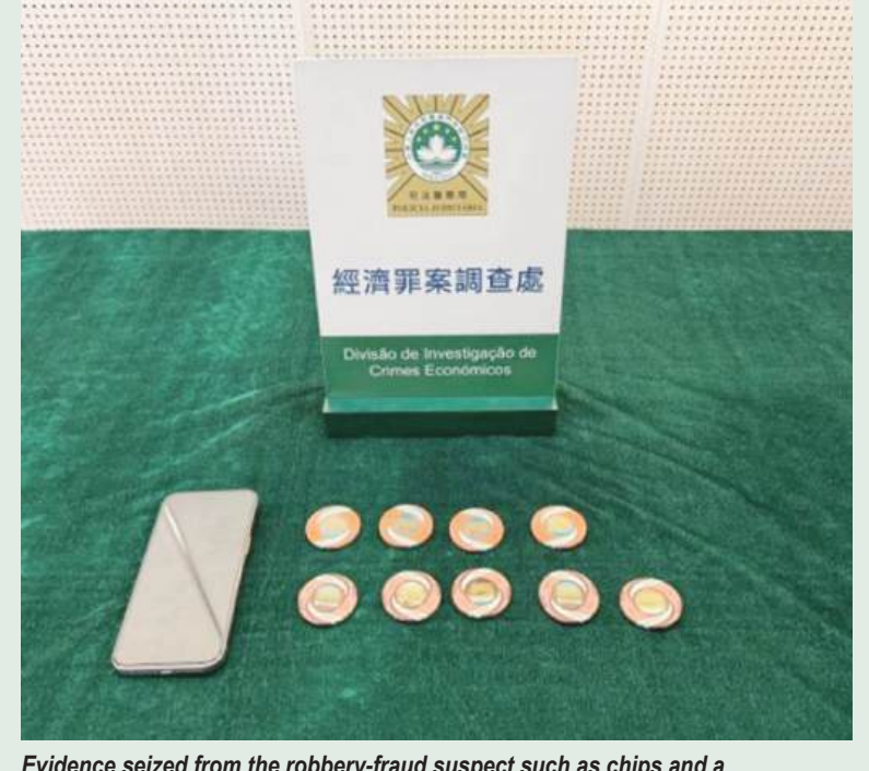
Evidence seized from the robbery-fraud suspect such as chips and a smartphone are displayed during Friday's regular press conference at the Judiciary Police (PJ) headquarters.

Anyone with suicidal thoughts looking for assistance is urged to call the Caritas hotline 2852 5222 for Chinese-language speakers or 2852 5777 for English-language speakers, or the Social Welfare Bureau's (IAS) 24-hour counselling hotline 2826 1126. ■