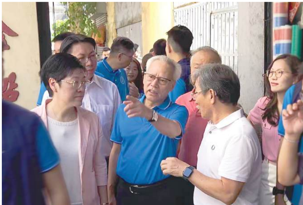
Macau's chief executive candidate Sam Hou Fai visits the southern part of the Inner Harbour neighbourhood during yesterday's walkabout.