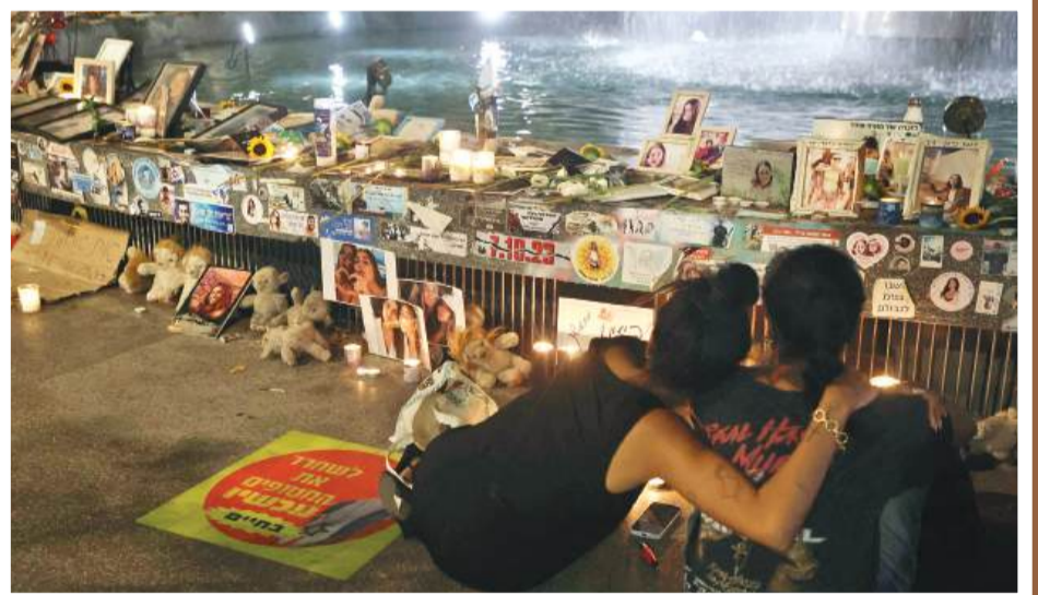
People gather to mark the first anniversary of the October 7, 2023 attacks, in the Israeli coastal city of Tel Aviv yesterday. Israel marked the first anniversary of the deadliest attack in its history, with Prime Minister Benjamin Netanyahu saying the Gaza and Lebanon wars would ensure the violence it endured last October 7 could never be repeated. (More on p. 10)

During a rally last month, the 78-year-old former reality TV star said Harris should be prosecuted over President Joe Biden's border policies and called illegal immigrants "animals," out to "rape, pillage, thief, plunder and kill."