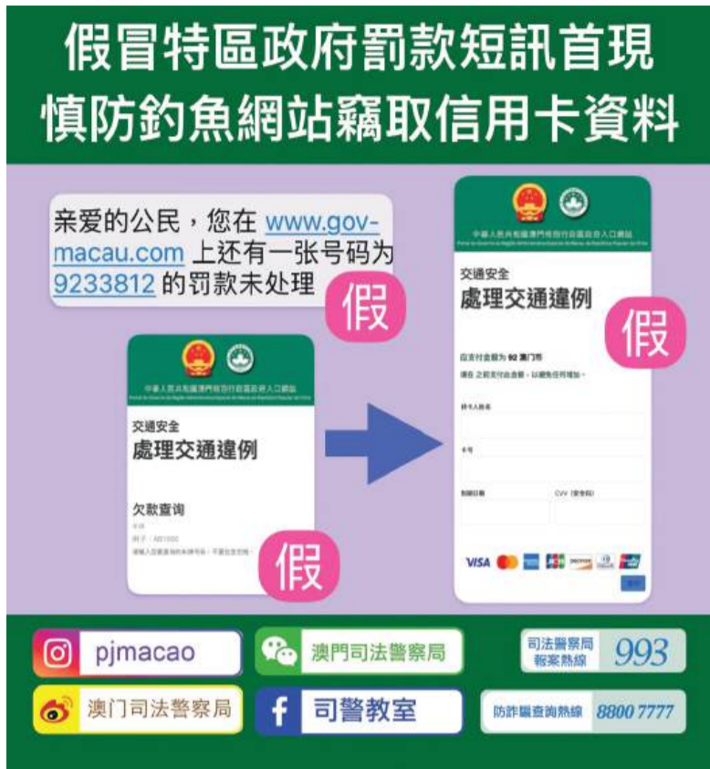
This poster provided by the Judiciary Police (PJ) yesterday warns members of the public of the fake "pay fines for 'traffic offences'" phishing SMS.

The statement underlined that to avoid data theft, the Judiciary Police Anti-Fraud and Coordination Centre is warning