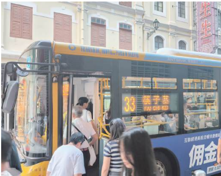
Passengers catch a No.33 bus on Avenida de Almeida Ribeiro, the city's main thoroughfare, on Sunday.

Yesterday's statement also said that the city recorded a total of 3.616 million public bus passengers during a five-day period from October 2 to 6, or a daily average of 723,000, a 15-percent increase from the same period of last year. ■