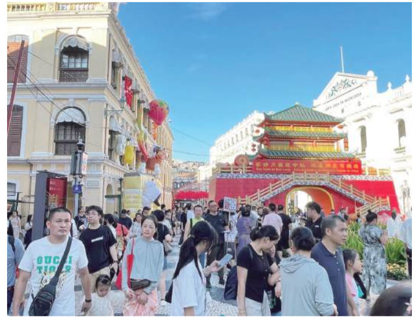
This handout photo released by the Macau Government Tourism Office (MGTO) last week shows tourists strolling through the city's main square, Largo do Senado, during the National Day Golden Week holiday.

Tourism Office (MGTO) said in a statement on Thursday last week that on October 2, Macau recorded 166,100 visitor arrivals, adjusted by MGTO from PSP immigration statistics.