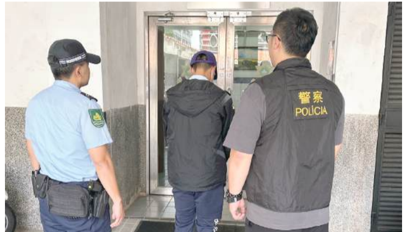
This undated handout photo provided by the Public Security Police (PSP) yesterday shows the local sexual harassment suspect being escorted by two police officers to a police station in Taipa.