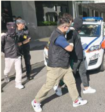
The two hooded male loan-sharking suspects from the mainland are escorted by Judiciary Police (PJ) officers from the PJ headquarters in Zape to a vehicle after yesterday's special press conference.