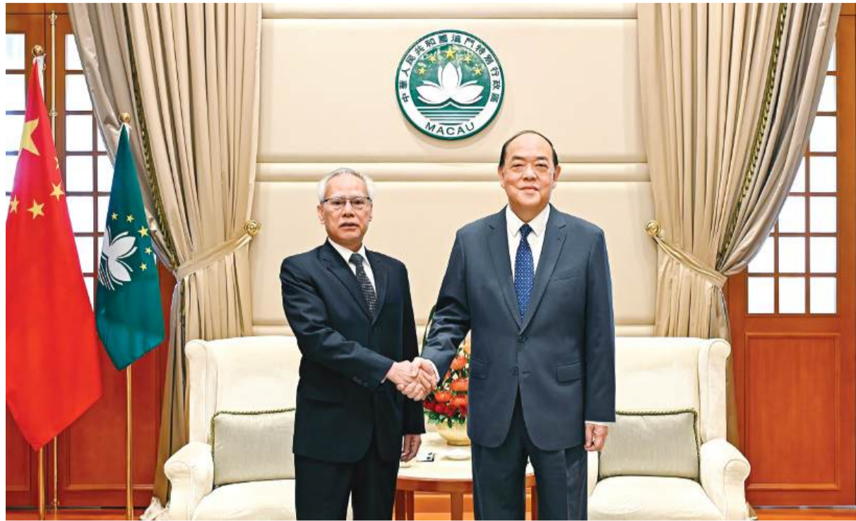
Current Chief Executive Ho Iat Seng (right) shakes hands with Chief Executive-elect Sam Hou Fai on the sidelines of their meeting at Government Headquarters yesterday.

statement, Ho noted during yesterday's meeting that after the completion of the necessary statutory procedures for the final confirmation of the election results, the local government will then submit a report on the election results to the Central People's Government requesting its appointment of Sam as the MSAR's sixth-term chief executive.