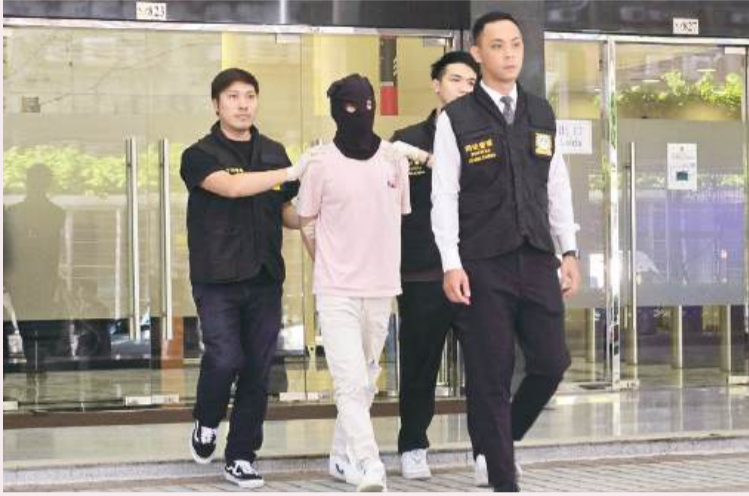
The hooded organised-crime and fraud suspect from Hong Kong is escorted by Judiciary Police (PJ) officers from the PJ headquarters to a police vehicle in Zape after yesterday's special press conference.