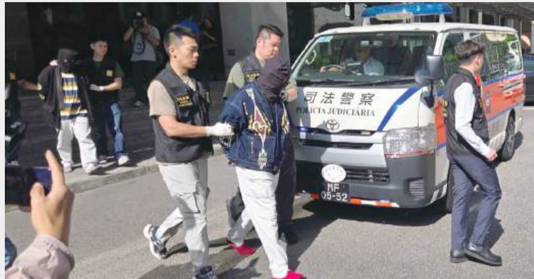
Judiciary Police (PJ) officers escort the two hooded suspects from the mainland to a police vehicle outside the PJ headquarters in Zape yesterday.