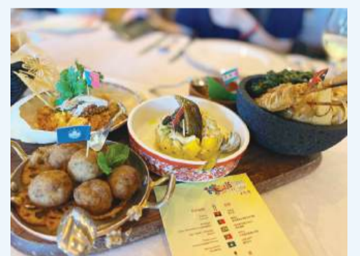
A Portuguese-speaking (PSCs) culinary showcase at Forum Macao Complex featured speciality menus and food presentations by chefs from PSCs and Macau yesterday.

was also held at the Forum Macao Complex yesterday, featuring speciality menus and food presentations by chefs from PSCs and Macau.