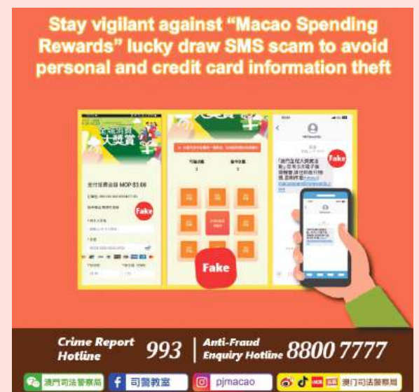
This poster provided by the Judiciary Police (PJ) yesterday warns members of the public of the "Macao Spending Rewards" lucky draw SMS scam.

The Judiciary Police's Anti-Fraud Coordination Centre warned members of the public not to click on unknown links embedded in any SMS message and to verify the information with official institutions. One should also verify a website's authenticity when personal information, bank and credit card details are requested.