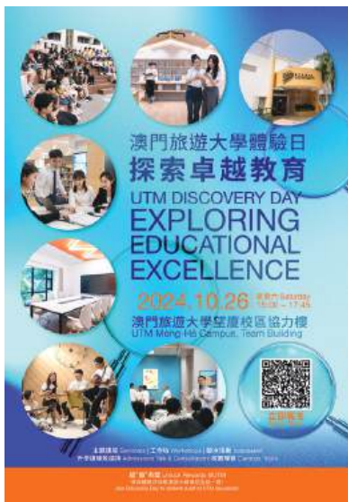
This poster provided by the Macao University of Tourism (UTM) promotes its Discovery Day next Saturday.

The event will be held at the public university's Mong-Ha campus's Team Building, the statement said.