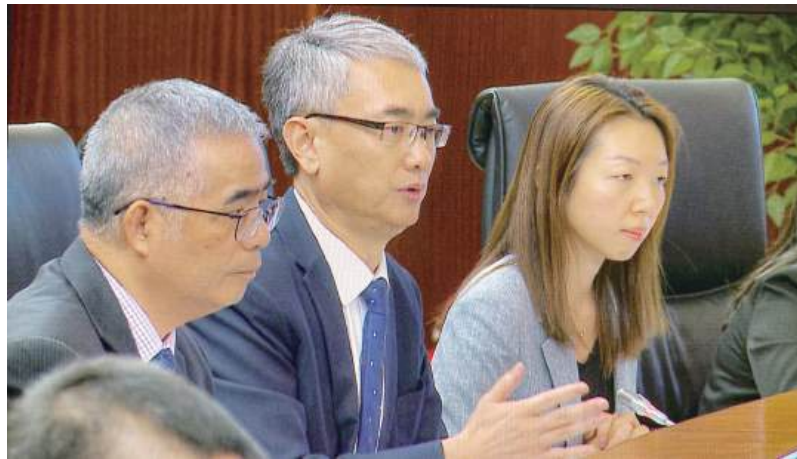
Flanked by officials under his portfolio, Secretary for Administration and Justice André Cheong Weng Chon addresses yesterday's plenary session in the legislature's hemicycle.

The bill's initial version proposed that the affected landlords would be able to benefit from the streamlined procedures if the tenants were at least five months behind in paying their rent. However, after the legislature's