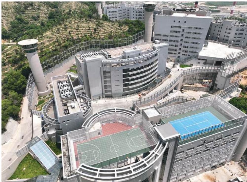
This undated file photo taken from the website of the Public Works Bureau (DSOP), which oversaw the construction project, shows the new Coloane prison in Ka Ho.

The construction project of the new prison, divided into four phases, commenced in August 2010, when the government said it expected the project to be completed by the end of 2014. The first two phases of the new prison project, including the construction of external roads, watchtowers, electricity substations and liquefied petroleum gas (LPG) rooms, as well as the construction of prison cell blocks and the whole complex, were started in August 2010 and March 2016 respectively. At that time, the first phase of the project was scheduled to be completed in 2012, but in the end, due to "problems with