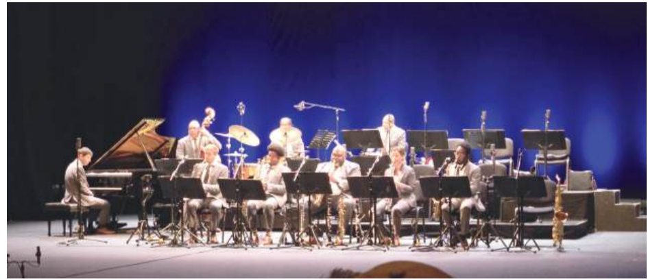
The Jazz at Lincoln Center Orchestra plays an encore at the Macao Cultural Centre's (CCM) Grand Auditorium on Saturday night, with Wynton Marsalis in the second row.

Admittedly, no concert is flawless. I personally would have welcomed fewer Chinese-themed compositions, which I found to be lacklustre at times, and wished they had more solos which many of us had