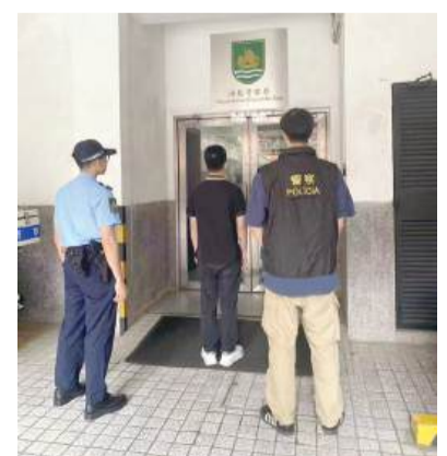
This undated handout photo provided by the Public Security Police (PSP) yesterday shows the sexual harassment suspect being escorted by two police officers to a police station in Taipa.

Yeh has been transferred to the Public Prosecutions Office (MP), facing a sexual harassment charge, according to Wong. ■