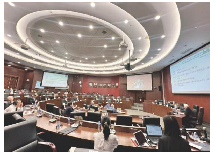
This photo taken yesterday shows the first day of the two-day forum on “‘One Country, Two Systems’ with Macau Characteristics: Review and Prospects” held on the University of Macau (UM) campus.