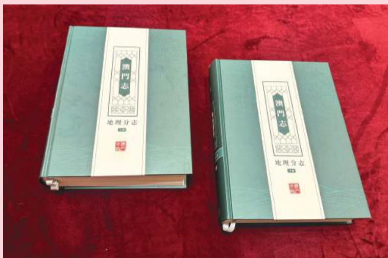
This photo taken yesterday shows the two-volume "Macao Gazetteer Series: Book of Geography" displayed at the University of Macau (UM).

This chronicle aims to document Macau's historical development and current status from ancient times to the establishment of the MSAR, serving not only as an objective record of Macau's history and development but also providing references for governance, historical insights, local education, cultural heritage, cultural exchanges, and the promotion of economic and social development, according to the press conference. ■