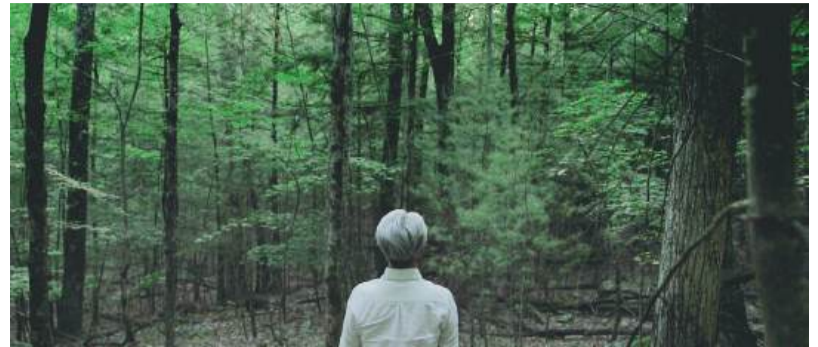
This undated handout photo provided by the Cultural Affairs Bureau (IC) shows a still from the 2017 documentary film Ryuichi Sakamoto: CODA, which will be screened at Cinematheque•Passion this Sunday.

The 2017 documentary film follows award-winning musician Ryuichi Sakamoto* (1952-2023) as he reflects on his over four-decade long career, as well as his life. The movie, according to a summary on Wikipedia, tells his experiences surviving cancer, as well as covers