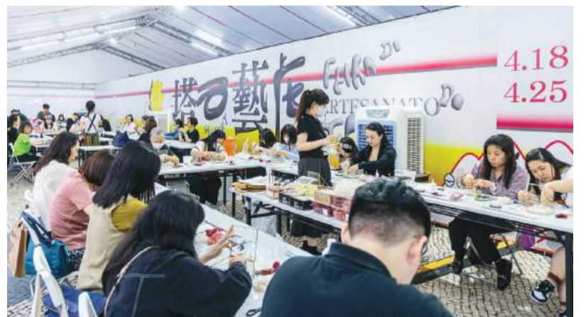
This undated handout photo yesterday shows a workshop taking place during a previous edition of the Tap Siac Craft Market.

Enquiries can be made by calling 8399 6289 or 8399 6209. ■