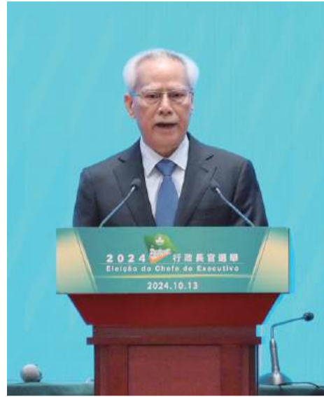
Sam Hou Fai, the sixth-term Chief Executive-elect of the Macau Special Administrative Region (MSAR), delivers his acceptance speech after his election by a 400-member committee at the Forum Macao Complex in Nam Van on October 13. Sam garnered 394 of the 398 votes cast, or 98.99 percent. Two electors were absent. Sam is slated to be sworn in as the MSAR's fourth chief executive on December 20, coinciding with the 25 th Anniversary of the establishment of the MSAR, in accordance with the "One China, Two Countries" principle.

Macau's political system is based on traditional Asian consensus politics. It is devoid of Western-style party politics. ■