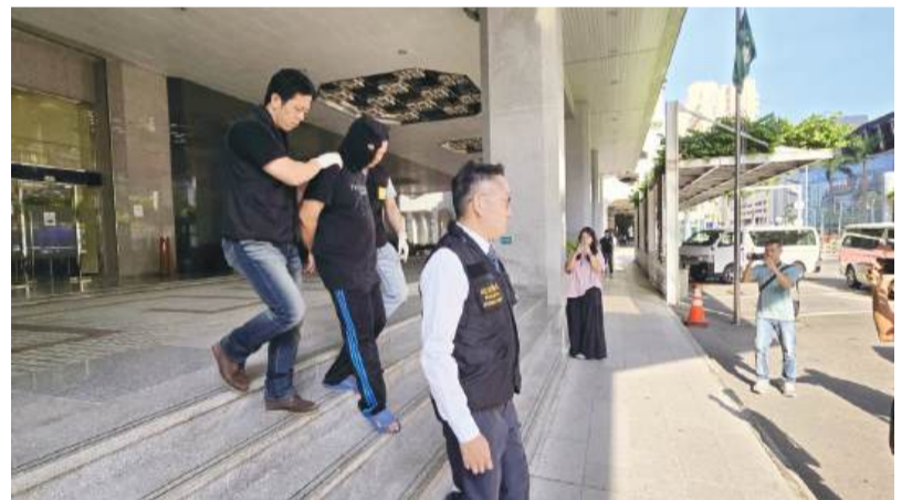
The hooded money laundering suspect is being escorted by Judiciary Police (PJ) officers from the PJ headquarters in Zape to a vehicle yesterday.