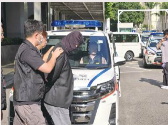
The hooded theft suspect is escorted by Judiciary Police (PJ) officers from the PJ headquarters in Zape to a vehicle yesterday.