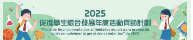
This banner downloaded from the Education and Youth Development Bureau (DSEDJ) website yesterday promotes the "Annual Activity Funding Scheme for Promoting Comprehensive Student Development in 2025".

Tickets for this year's Grand Prix go on sale from 10 a.m. today, with the price ranging from 400 to 1,200 patacas, and each purchase is limited to a maximum of 20. The MGP Organising Committee has set up a total of 15 sales points in Macau, Hong Kong and the mainland, as well as online, telephone, email and mobile app purchase channels. ■