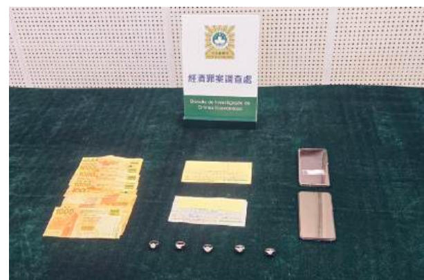
Evidence seized from the suspects such as rings and Hong Kong dollar notes are displayed during yesterday's press conference at the Judiciary Police (PJ) headquarters.