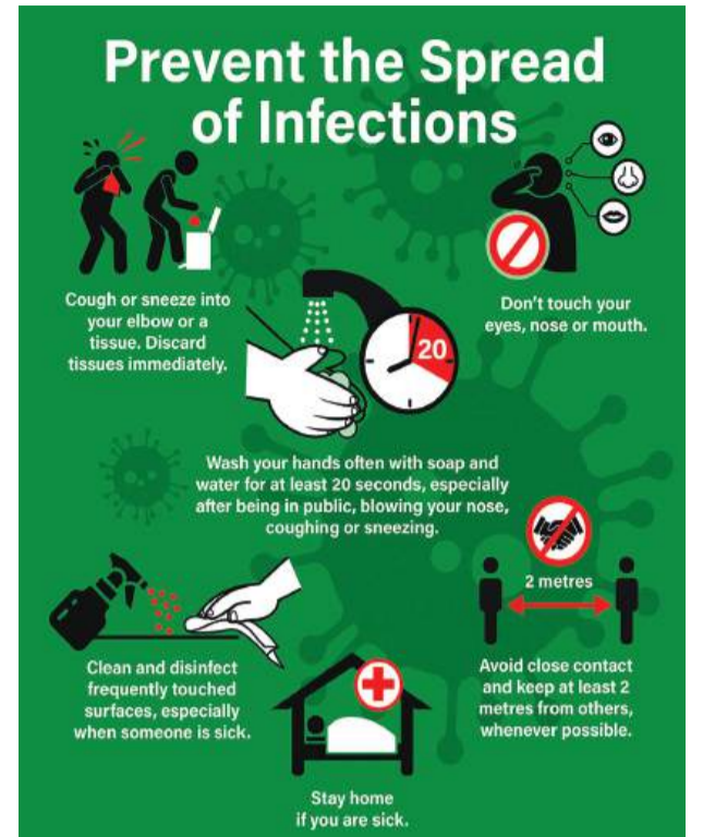
Poster courtesy of Canadian Centre for Occupational Health and Safety

Meanwhile, the bureau logged on Monday Macau's 15 th travel-associated dengue fever case, in which the victim was identified as a 68-year-old local man living in Polytec Garden Building (Block 6) on Rua Central da Areia Preta (黑沙環中街), who visited relatives in Foshan City, some 100 km north of Macau, on October 7-10 and came down with fever last Wednesday. ■