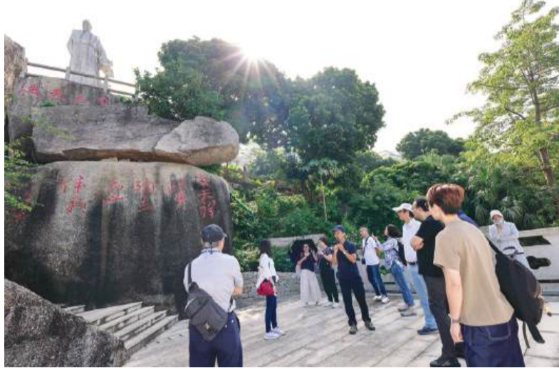
This undated handout photo provided by the Macau Government Tourism Office (MGTO) yesterday shows participants in the recent fact-finding trip visiting a tourist attraction on one of Zhuhai's Wanshan islands.

The visit, according to the statement, also aimed to encourage participants to "promote multi-destination island travel to Macau and Zhuhai in their own countries and showcase the shared strengths and appeal of tourism resources" in the Greater Bay Area (GBA) and tap into international markets. ■