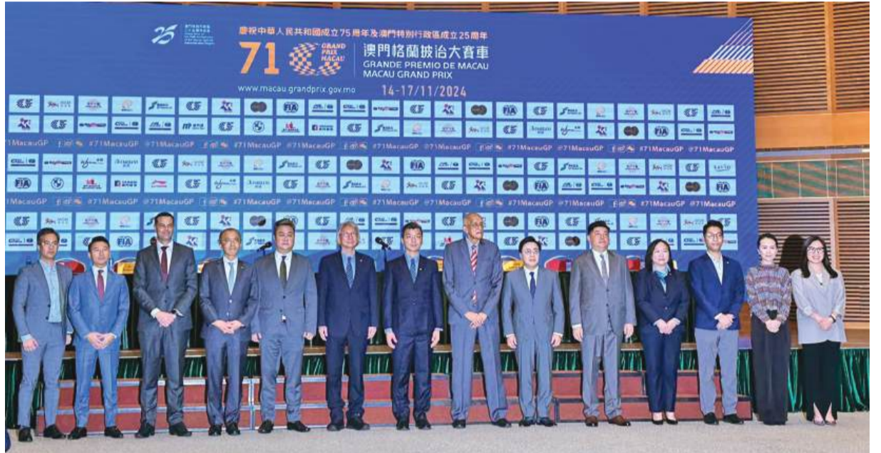
Macau Grand Prix Organising Committee (MGPOC) members pose during yesterday's press conference.