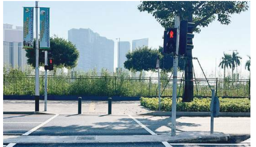
This file photo taken on October 13 shows traffic lights in Nam Van.