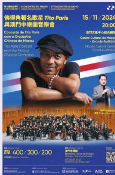
This poster provided by the Cultural Affairs Bureau (IC) promotes next month's concert by Cape Verdean Singer Tito Paris and the Macao Chinese Orchestra.

The one-night event will start at the Macau Cultural Centre's (CCM) Grand Auditorium at 8 p.m., with tickets priced at 200, 300 and 400