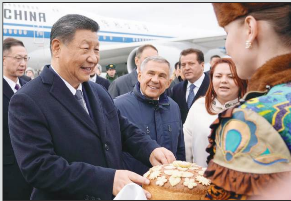
President Xi Jinping arrives at the Kazan airport to attend the three-day BRICS summit, hosted in the Russian city until tomorrow. In Russia, guests are traditionally welcomed with bread and salt, both symbolising prosperity and health. Kazan is the capital of the Russian Federation's Republic of Tartarstan. - (More about the BRICS summit on pages 6,7 & 11)