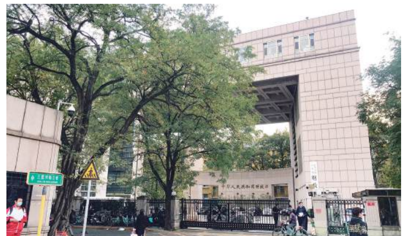
This October 2020 file photo shows the headquarters of the Ministry of Finance in Beijing.

The two-billion-yuan sovereign bonds issued in Macau in 2019 comprised 1.7 billion yuan offered to institutional investors and retail bonds worth 300 million yuan offered to members of Macau's general public. ■