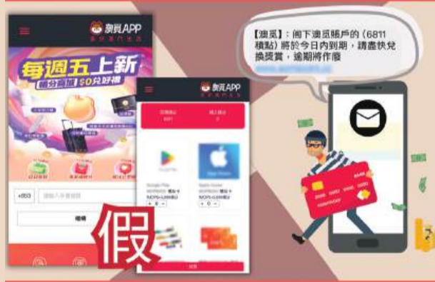
This poster provided by the Judiciary Police (PJ) yesterday warns members of the public of the "Aomi (澳覓)" redeeming points SMS scam.

Those suspecting fraud can use the Judiciary Police's "Anti-Fraud Programme" to check the scam risk index or call 8800 7777 or 993 for assistance. ■