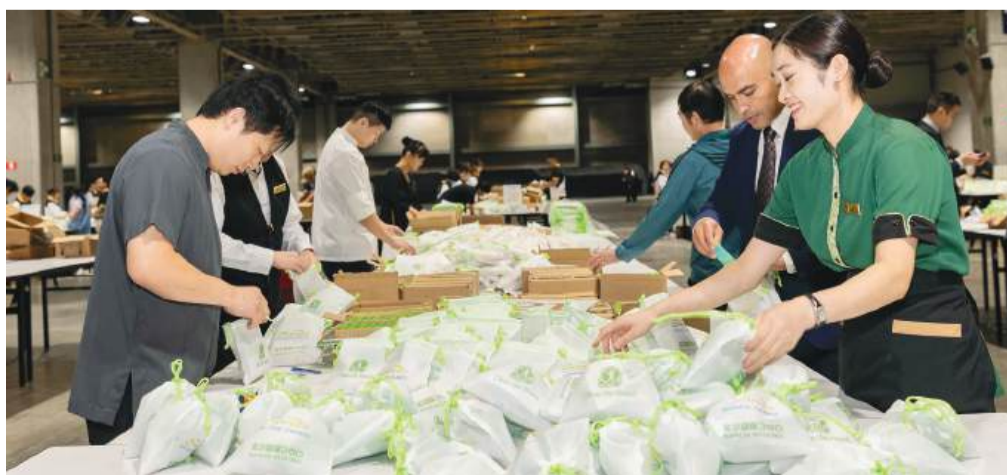
This recently taken photo provided yesterday by Sands China shows staff and volunteers assembling hygiene kits at The Venetian Macao's Cotai Expo.