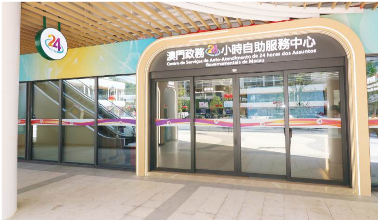
This undated handout photo provided by the Identification Services Bureau and the Public Administration and Civil Service Bureau (SAFP) yesterday shows the Macau government's 24/7 self-service centre at the Guangdong-Macao In-Depth Cooperation Zone in Hengqin.

The centre, jointly launched by the Macau government and the Executive Committee of Guangdong-Macao In-Depth Cooperation Zone in Hengqin, provides nearly 70 cross-border public services to local residents working, studying, living and developing their career in the zone, covering 12 public entities, including the Identification Services Bureau, Public Security Police (PSP) and Financial Services Bureau