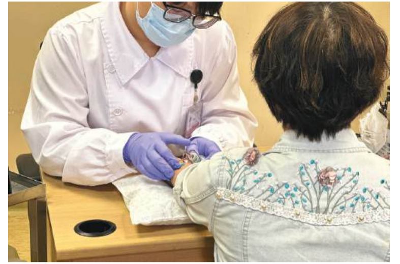
A local woman undergoes painless blood sampling yesterday.

317 patients in about five months to reduce the pain they felt during the injections with painless intravenous infusion.