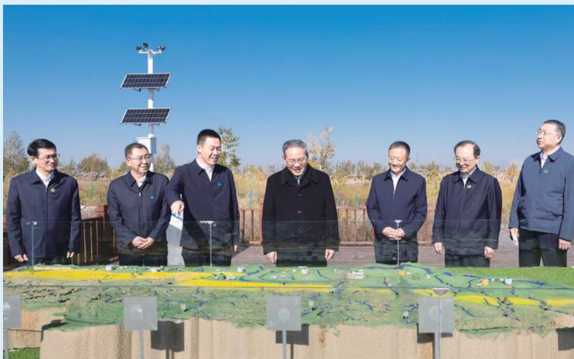
Premier Li Qiang (center), also a member of the Standing Committee of the Political Bureau of the Communist Party of China (CPC) Central Committee, inspects soil and water conservation management in Ordos City of the Inner Mongolia Autonomous Region on Wednesday.