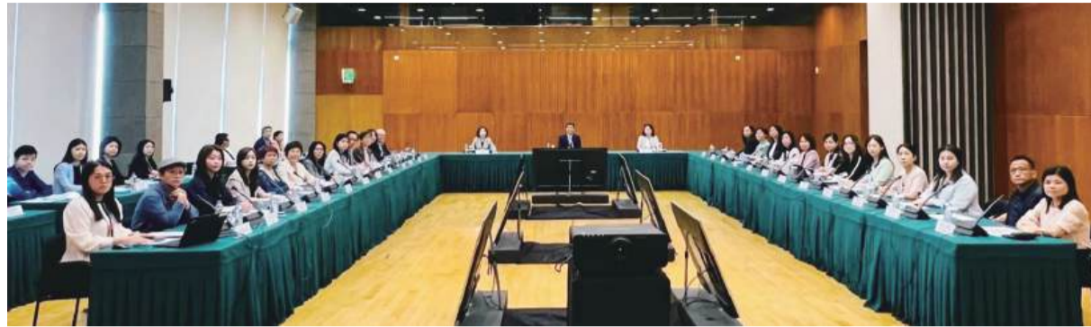
The government-appointed Women and Children Affairs Committee holds this year's second plenary meeting at the Macau Cultural Centre (CCM) yesterday.