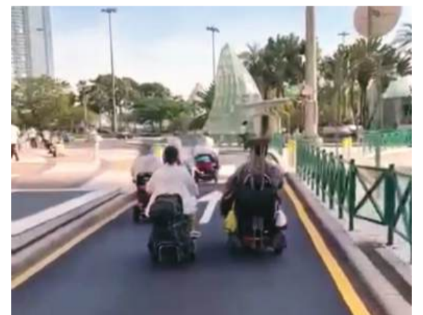
This video grab retrieved yesterday from a video clip circulated on social media shows wheelchair users from the mainland on a roadway in Praça de Ferreira do Amaral (亞馬喇前地).

The Public Security Police underlined in the statement that both wheelchair users and pedestrians should use pavements and pedestrian crossing facilities, urging wheelchair users to ensure their own safety and that of other road users by using the facilities in a law-abiding and safe manner. ■