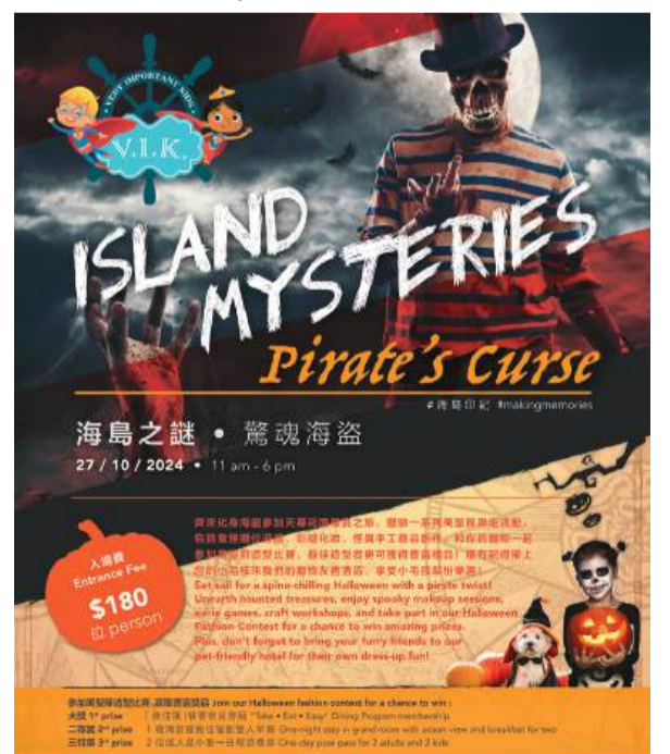
This poster recently provided by Grand Coloane Resort promotes the upcoming "Island Mysteries Pirate's Curse".

Tickets for the carnival are priced at 180 patacas per person, while children under five get in for free. ■