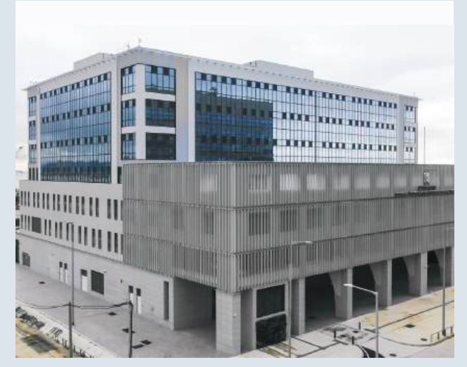
This handout photo released by the Macau Customs Service earlier this month shows its new headquarters at Pac On in Taipa.

The new PSP complex in Zone E1 was officially inaugurated by Chief Executive Ho Iat Seng a fortnight ago. ■