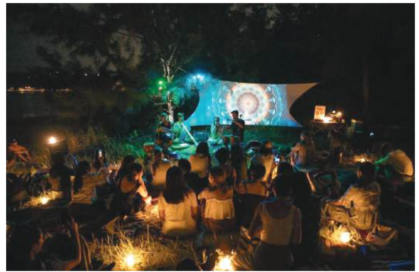
This undated handout photo recently provided by the Cultural Affairs Bureau (IC) shows one of the previous activities - "Rhythm Music Tribe - Music Fiesta Under the Starry Sky". An event of the same name is set to take place on Saturday at the Entrance to Hac Sa Beach Park.

The statement added that musical instrument experiences for families and a music festival are set