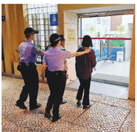
This undated handout photo provided by the Public Security Police (PSP) yesterday shows a police officer escorting the mainland theft-by-finding suspects to the Nam Van Police Station for questioning.