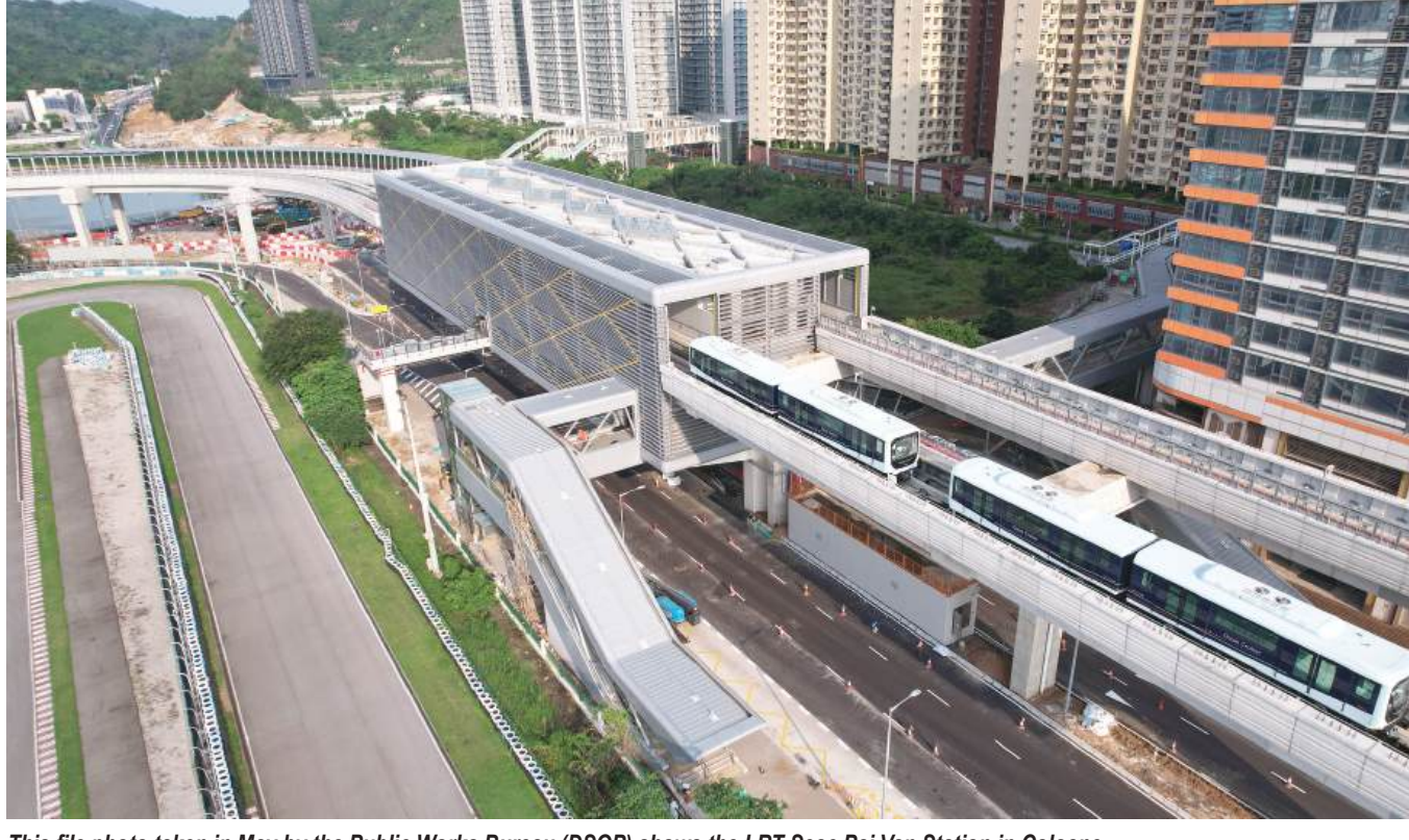
This file photo taken in May by the Public Works Bureau (DSOP) shows the LRT Seac Pai Van Station in Coloane.

The LRT fare is calculated according to the number of stations. Except for journeys between the Barra and Ocean stations, a general single ticket for a ride of 10 to 12 stops amounts to 12 patacas.