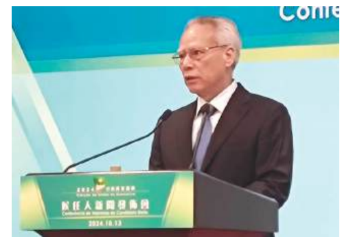
Sam Hou Fai, then chief executive-elect and now chief executive-designate, addresses a press conference at the Forum Macao Complex on October 13 following his election as Macau's sixth-term and fourth chief executive.

Sam was born in May 1962 in Zhongshan City, some 40 kilometres north of Macau in