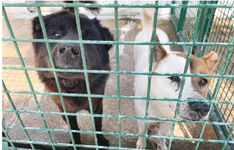
This file photo taken last year shows two abandoned dogs at the Coloane Municipal Kennel.

Referring to the bureau's earlier comments that its TNA (Trap-Neuter-Adopt) initiative had achieved certain results, Lei urged the bureau to evaluate the effectiveness of its existing measures and continue to step up its efforts in promoting the concepts of animal protection, early neutering and adoption instead of purchase: