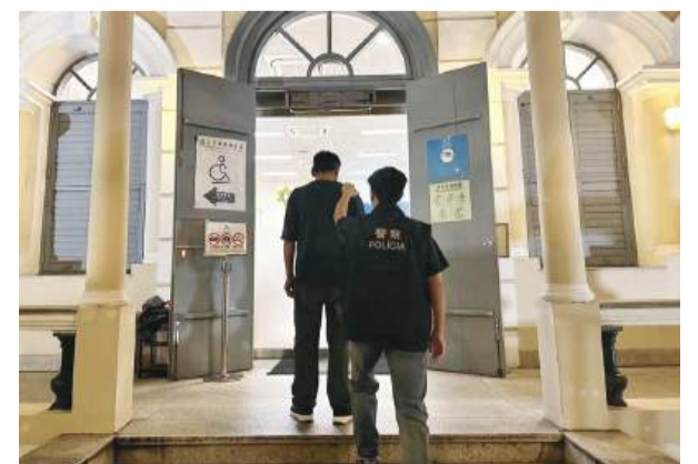
This undated handout photo provided by the Public Security Police (PSP) yesterday shows a police officer escorting the Mongolian suspect to a police station in the northern district.