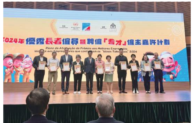
Outstanding senior employees and their employers are awarded during yesterday's Outstanding Senior Employees and Seniors Employers Recognition Programme awarding ceremony held at Macau Science Centre (MSC).