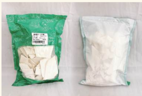
This undated handout photo provided by the Municipal Affairs Bureau (IAM) yesterday shows the pre-packed kudzu product that was found to contain an excessive amount of sulphur dioxide (SO 2 ).

For more information, please refer to the new issue of Macau Consumer magazine at https://www.consumer.gov.mo . ■