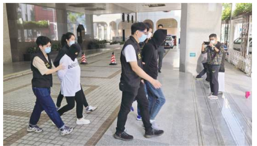
The hooded illegal currency exchange dealers from the mainland are escorted by Judiciary Police (PJ) officers from the PJ headquarters to a PJ vehicle in Zape after yesterday's special press conference.

Yao and Qian were apprehended on the spot. The police confiscated the HK$30,000 worth of chips from the gambler, who then became