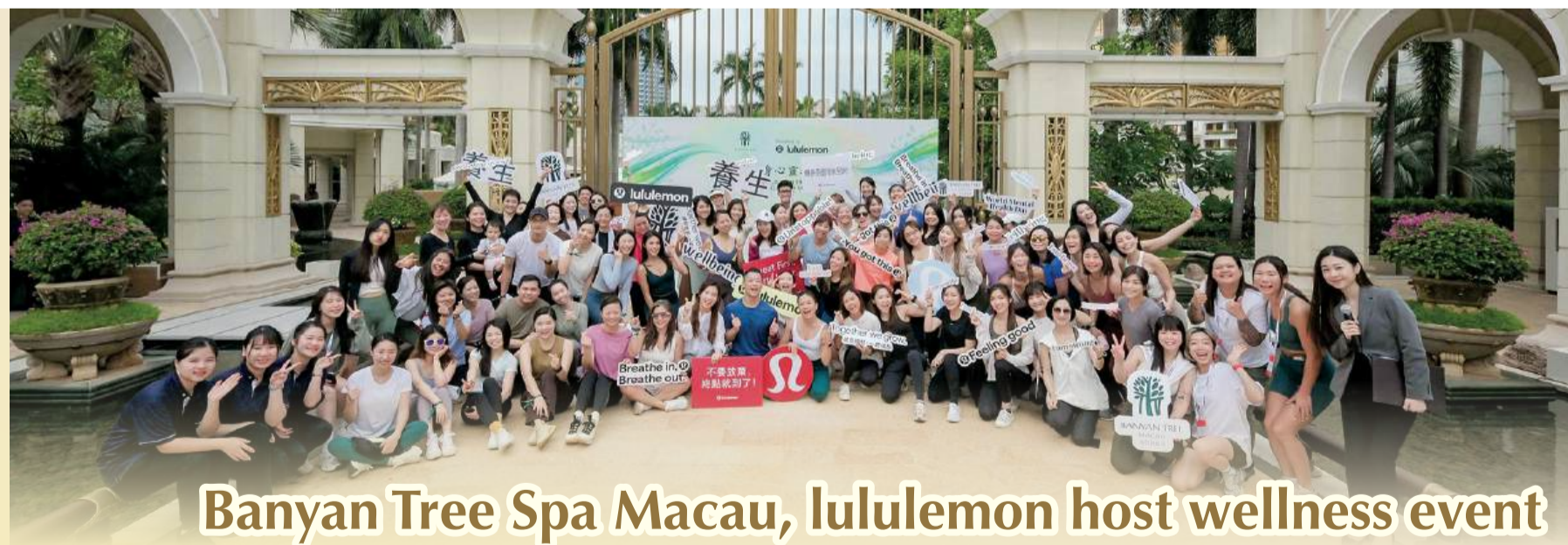
This handout photo taken on Sunday shows participants in the “Embracing World Mental Health Day through Yoga and Movement” posing on the second floor of Banyan Tree Macau at Galaxy Macau in Cotai.

“Through these engaging and informative car racing themed activities, SJM hopes to spark a deeper understanding and interest in racing among children, contributing to the legacy of Macau’s racing culture and competitive spirit”, the SJM statement noted.