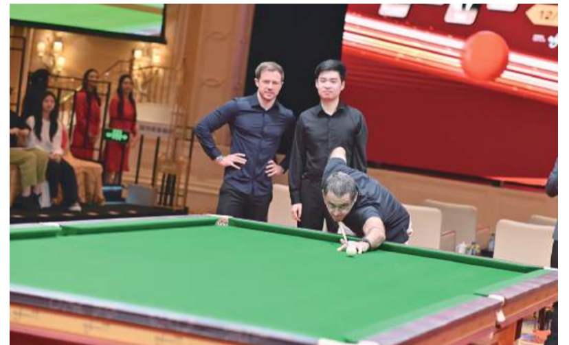
Professional snooker players Si Jiahui (right, standing) and Jack Lisowski (left, standing) watch Ronnie O’Sullivan as he attempts a trick shot after yesterday’s press conference at Wynn Macau.