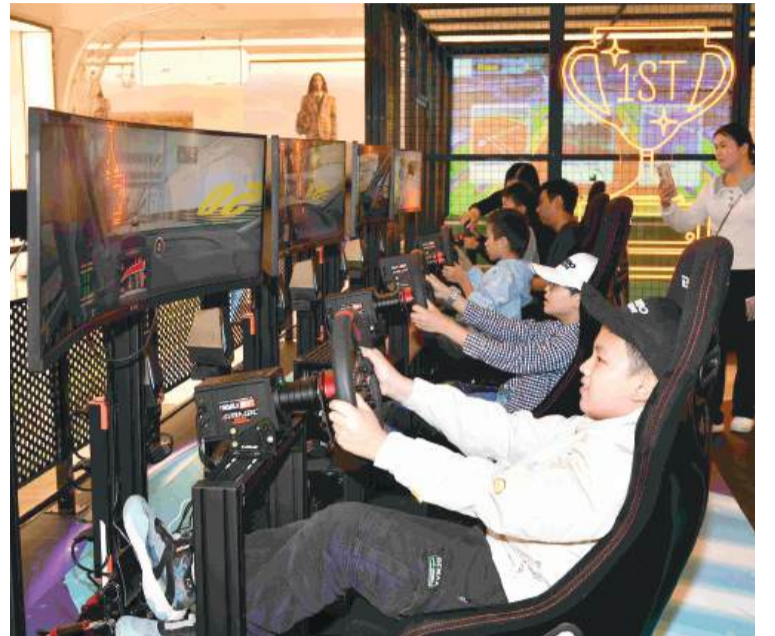
This handout photo provided by SJM Resorts and taken on Saturday at Grand Lisboa Palace (GLP) in Cotai shows children playing games during the recent “Little Driver, Grand Racing” event at the integrated resort in Cotai.