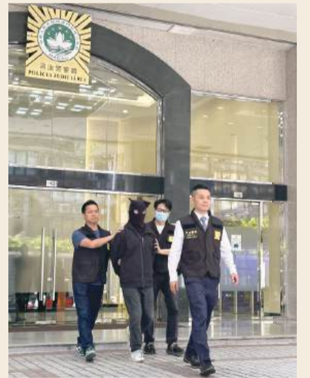
The hooded illegal currency exchange dealer from the mainland is escorted by Judiciary Police (PJ) officers from the PJ headquarters in Zape to a vehicle yesterday.

The Judiciary Police once again warned the public that both locals and non-locals who offer illegal currency exchange deals for the purpose of gambling are now facing a maximum prison term of five years, with all money and valuables used in the illegal business to be confiscated by the authorities, strongly urging residents and tourists alike to exchange money only at legitimate financial entities. ■