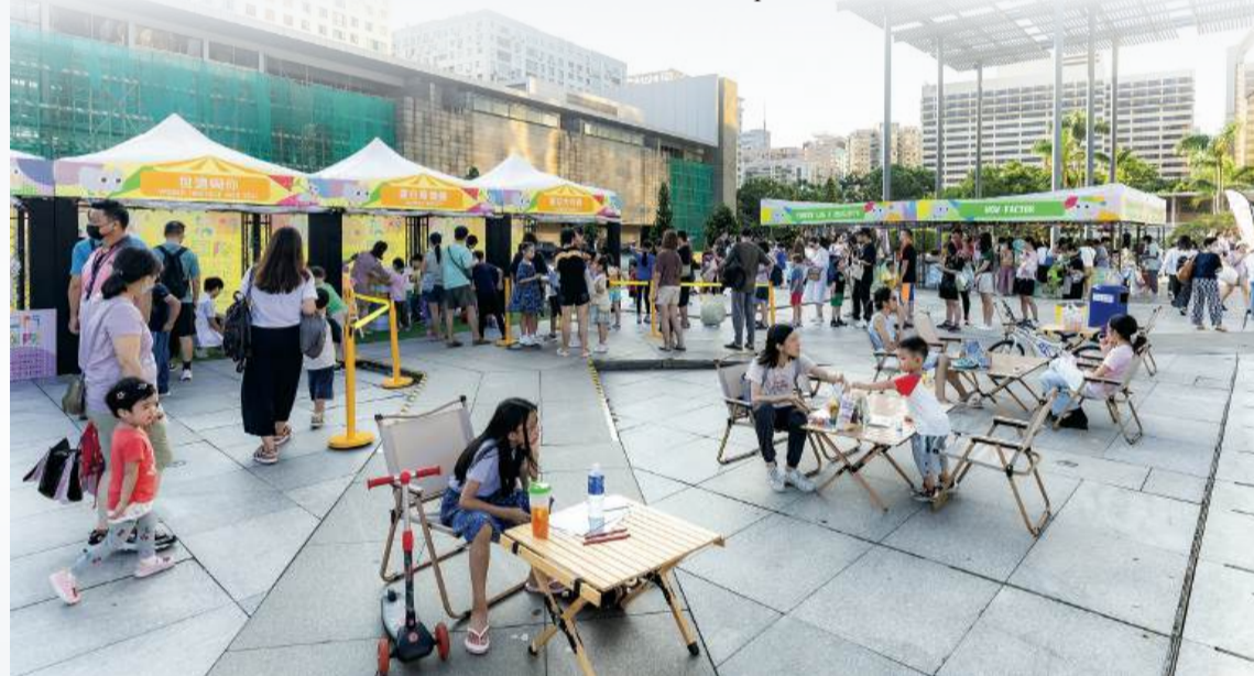
This undated handout photo provided earlier this week shows families and children taking part in the Macao International Arts Festival (MICAFA) Fun Day – Arts Carnival at the Macao Cultural Centre Plaza.

Moreover, on August 24, the company gathered around 30 Sands Cares Ambassadors and members of Macao Catholic Family Advisory Council at the carnival for activities including watching the Macao Youth Symphonic Band performance, a Macao Cultural Centre backstage tour, and parent-child art workshops.