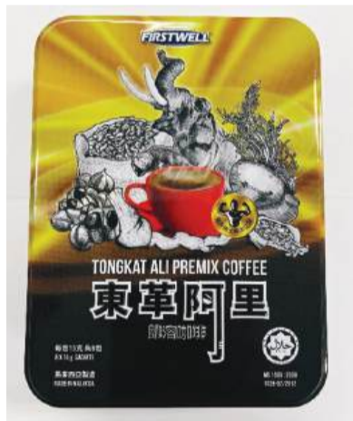
This undated handout photo provided by the Pharmaceutical Supervision and Administration Bureau (ISAF) yesterday shows the Malaysia-made "TONGKAT ALI PREMIX COFFEE" problematic coffee containing sildenafil.

The bureau asked residents who have bought the product to stop drinking the coffee and send it to the bureau at 3/F China Plaza, 51 Avenida de Sidónio Pais. For any enquiries, one can contact the bureau by calling 8598 3441 during office hours. ■