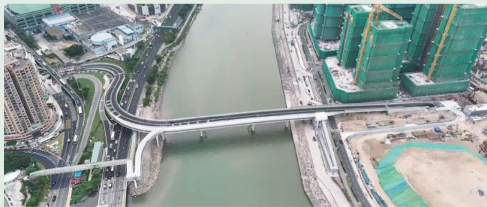
This handout photo released by the Public Works Bureau (DSOP) earlier this week shows the newly completed A2 flyover between the peninsula (left) and Zone A.

This came after construction of Zone A’s first two HOS estates were completed earlier this year, the one on plot B10 completed in May and the one on plot B9 completed in June. ■