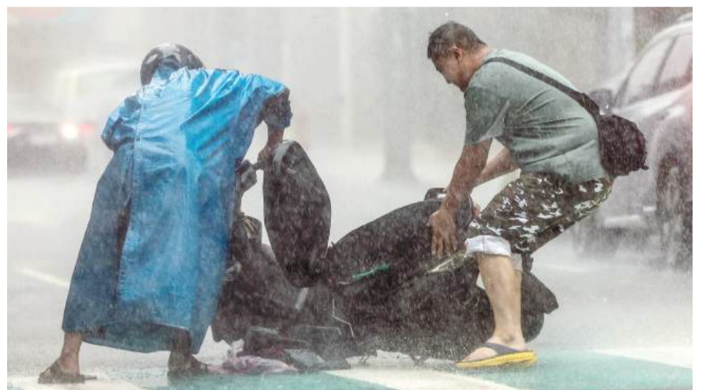
A passer-by (right) helps a motorist with a scooter amid heavy rain due to Super Typhoon Kong-rey in Keelung yesterday. China’s Taiwan region shut down yesterday as Super Typhoon Kong-rey neared, forcing thousands to flee from one of the most powerful storms to threaten the island in years. (Story on p.6) – Xinhua

It also aims to nurture a skilled workforce knowledgeable in technology, patents and relevant standards, carry out standardization research in the sector, promote the integration with international standards, and provide strong support for the high-quality development of the local industry. – Xinhua