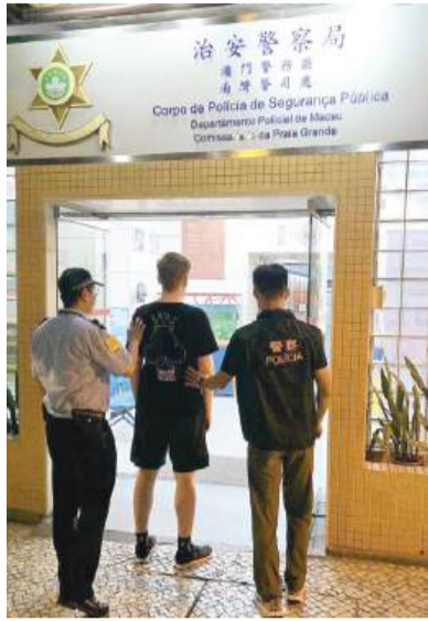
This undated handout photo provided by the Public Security Police (PSP) yesterday shows two police officers escorting the theft and vandalism suspect to a PSP station in Nam Van.

The Public Security Police received the report about the