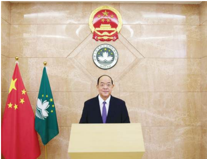
This handout photo released by the Macau Government Information Bureau (GCS) yesterday shows Chief Executive Ho Iat Seng addressing yesterday's opening ceremony of the 3rd Guangdong-Hong Kong-Macao Greater Bay Area Fair for Trade in Services in Zhuhai via video link.