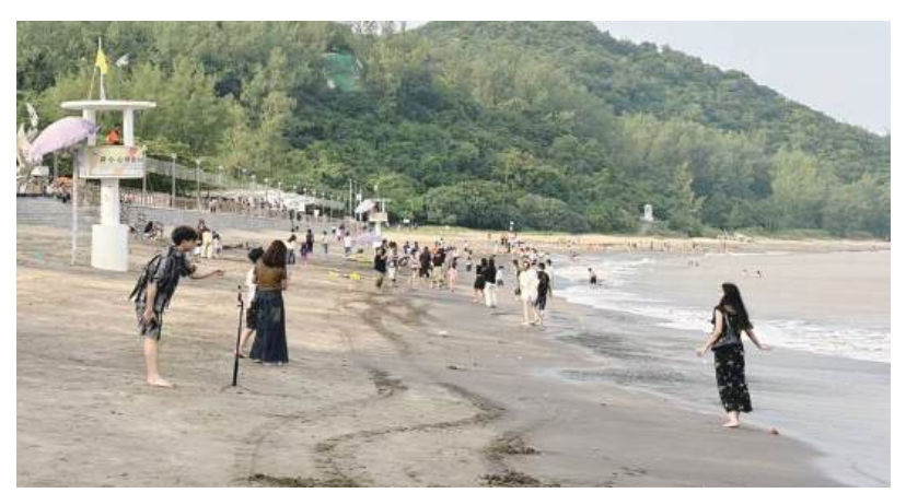
This photo provided by the Marine and Water Bureau (DSAMA) on Friday shows beachgoers and a lifeguard at Hac Sa Beach.

The statement stressed that lighting fires, camping and riding bicycles or driving motor vehicles on the beaches are strictly prohibited to avoid affecting other beachgoers.