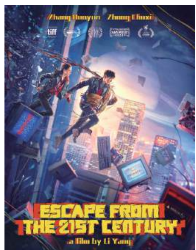
This poster provided by the Cultural Affairs Bureau (IC) on Friday promotes the opening film"Escape from the 21st Century" of the "China and the Portuguesespeaking Countries Film Festival".

Nearly 30 films, animations and short films from China and Portuguese-speaking countries (PSCs)