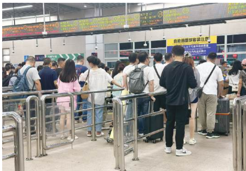
This file photo taken in late September shows border crossers entering Macau through the Barrier Gate checkpoint.

He also pointed out that after the three-year pandemic, there were obvious changes in tourists' travel