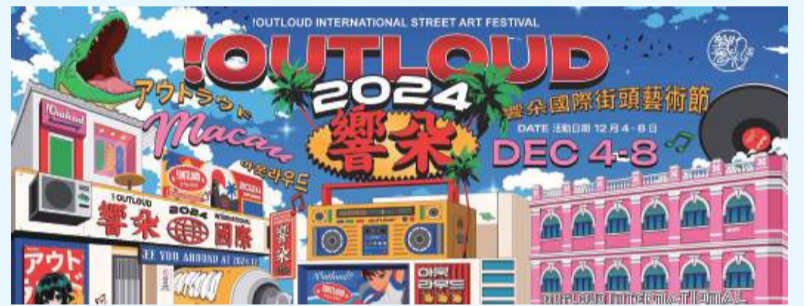
This banner downloaded from the official website of the !Outloud International Street Art Festival last night promotes the upcoming graffiti street festival in Praça de Ponte e Horta (司打口).

The statement noted that the festival will provide a free wall for graffiti artists signing up for the activities, with spray paint,