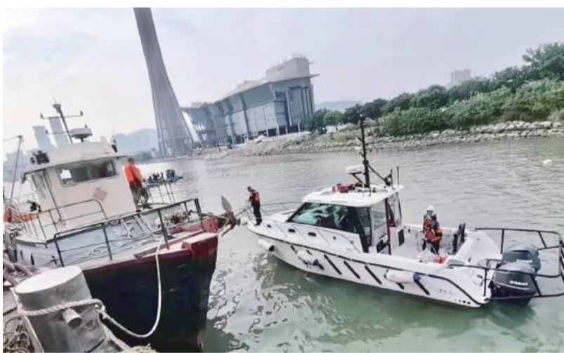
This handout photo provided by the Marine and Water Bureau (DSAMA) yesterday shows a government-owned vessel (right) assisting the Hong Kong-registered fishing boat, which hit the protective railing of the old Macau-Taipa bridge and ran aground off Macau Tower on Sunday.

The bureau reaffirmed its appeal to vessels entering and leaving Macau waters to strictly observe its navigation regulations, follow the navigation signs and pay attention to the navigation information at high tide levels to ensure navigation safety. ■