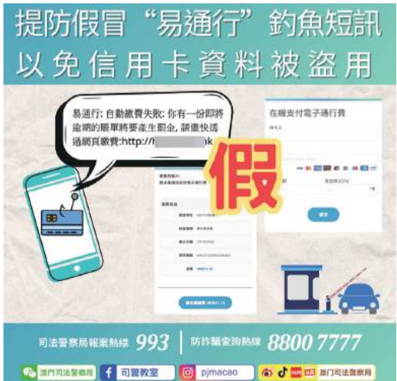
This poster provided by the Judiciary Police (PJ) yesterday warns members of the public of the fake "pay bills for 'HKeToll'" phishing SMS.

through official channels. If suspicious messages are received, individuals can turn to the Judiciary Police's anti-fraud programme or contact their anti-fraud hotline on 8800 7777, or report any incidents through the emergency hotline on 993. ■