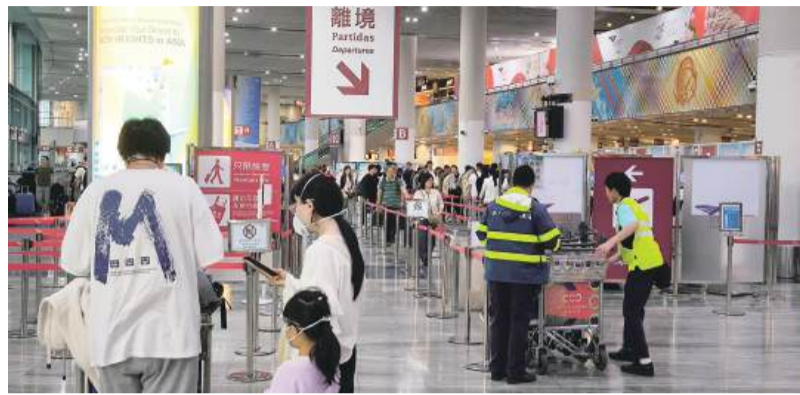
Passengers queue at the local airport's security check to the boarding area on Saturday.

In addition, the statement also said that at present, most passenger