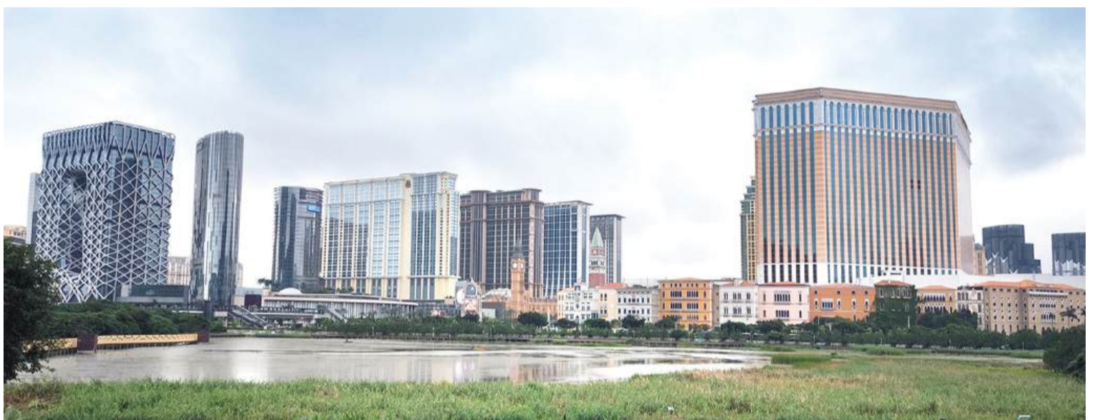
This file photo taken from the Taipa Houses complex earlier this year shows some of the casino-hotel resorts in Cotai.

The UM statement said that after Macau enjoyed a strong recovery in the number of