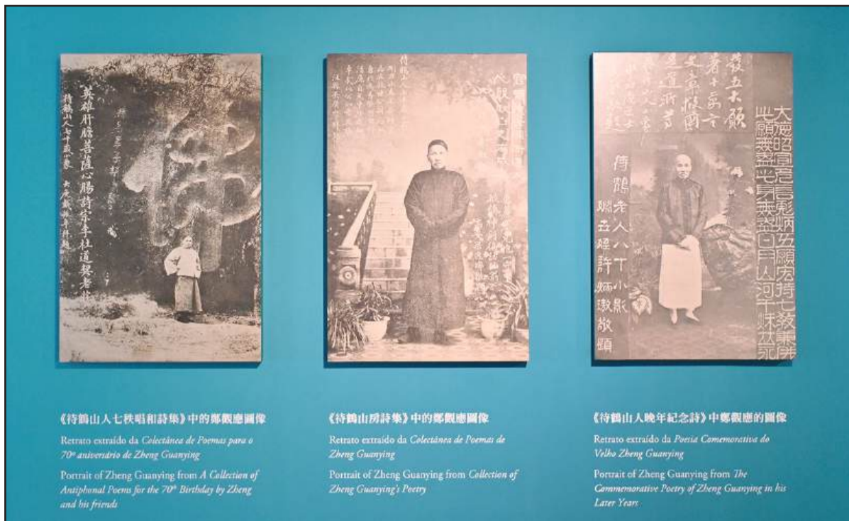
《待鶴山人七秩唱和詩集》中的鄭觀應圖像 Retrato extraído da Coleção de Poemas para o 70º aniversário de Zheng Guanying Portrait of Zheng Guanying from A Collection of Antiphonal Poems for the 70th Birthday by Zheng and his friends