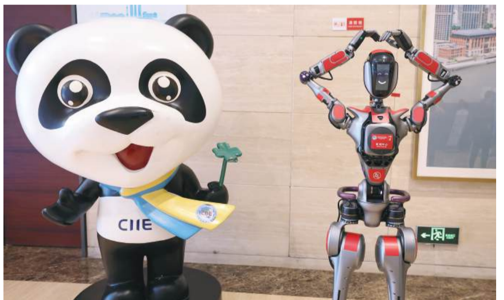
Jinbao, the mascot of the China International Import Expo (CIIE), and Xiaoxin, a humanoid robot providing an inquiry service, are pictured at the media center of the 7th CIIE in Shanghai yesterday. The huge fair opens today and ends on Sunday. – (More on p.6)

"Time is not on our side. COVID is still circulating; mpox is a global health emergency; we have an outbreak of Marburg, and H5N1 spillover. The next pandemic will not wait."