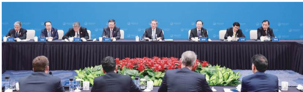
Premier Li Qiang (fourth from right) presides over a symposium with select exhibitors and buyers attending the 7th China International Import Expo (CIIE) in Shanghai yesterday.

SHANGHAI – Premier Li Qiang yesterday said that China will open its doors wider to the outside world, regardless of how the international environment changes.