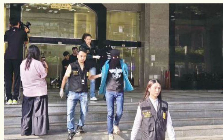
Judiciary Police (PJ) officers escort the three hooded suspects in the first of two separate case to a PJ vehicle outside the PJ headquarters in Zape yesterday.