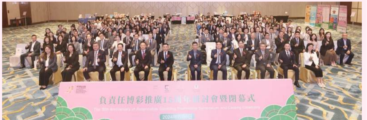
This photo provided by the Social Welfare Bureau (IAS) shows the closing ceremony of the "Responsible Gaming Promotion 2024" campaign yesterday at the JW Marriott Hotel at Galaxy Macau yesterday.

The bureau said that it will continue to step up its promotional efforts to reach out to different groups, with a focus on promoting gambling prevention and proactive help-seeking among young people in the future, recognising the signs of gambling addiction at an early stage, understanding the potential risks associated with gambling, and cultivating a positive attitude towards life in order to reduce various types of addictive behaviours. ■