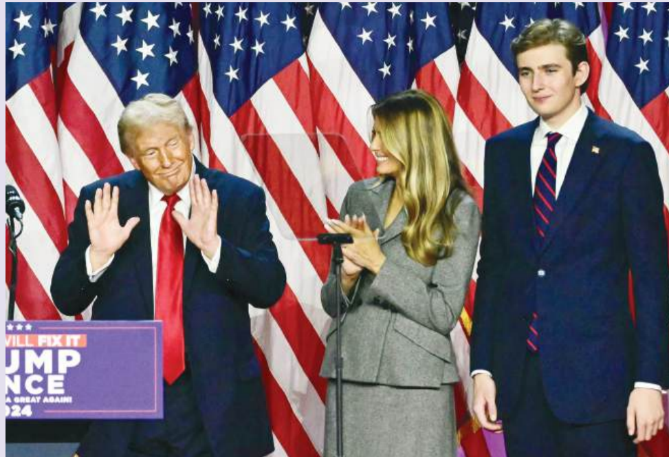
US President-elect Donald Trump gestures next to his wife Melania and their son Barron during an election night event at the West Palm Beach Convention Centre in West Palm Beach, Florida, yesterday.

Also messaging Trump was Ukrainian President Volodymyr Zelensky, who is