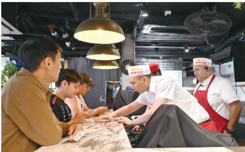
A staff member takes orders from a customer at a busy counter during yesterday's In-N-Out pop-up at M2 Kitchen.

*The mall is located on Avenida do Conselheiro Ferreira de Almeida (澳門肥利喇亞美打大馬路)