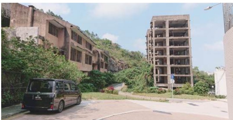
This file photo taken in 2021 shows some of the previously abandoned buildings constructed on Small Taipa Hill, by the concessionaire for its Lisboa Gardens new residential development.