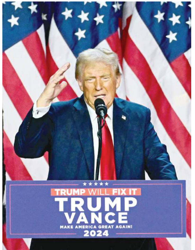
US Republican President-elect Donald Trump speaks during an election night event at the West Palm Beach Convention Center in West Palm Beach, Florida, yesterday. Claiming victory, he pledged to "heal" the country after trumping Democratic presidential candidate Kamala Harris in his stunning White House comeback.