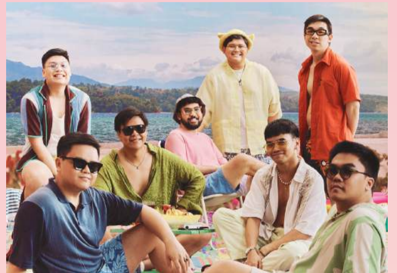
This undated photo shows the band members posing.