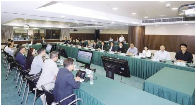
Members of the Urban Planning Council (CPU) attend yesterday's regular meeting at the Transport Bureau Building on Estrada de D. Maria II.