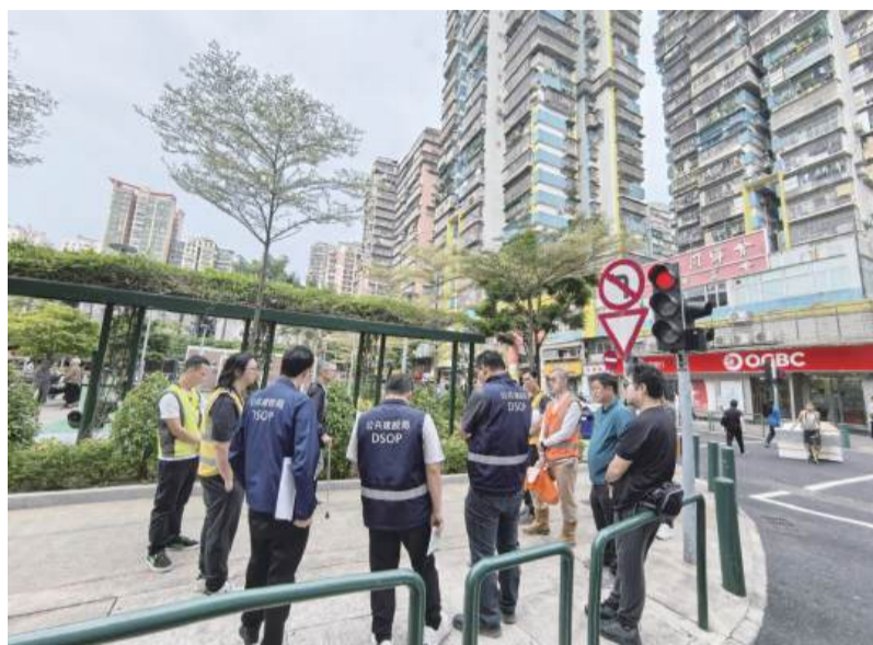
This handout photo released by the Public Works Bureau (DSOP) yesterday shows its officials during an on-site inspection of the temporary sitting-out area in Iao Hon district where the government's first sandwich-class public housing high-rise will be built.

According to the DSOP website, the project's pile foundation and basement work will be carried out