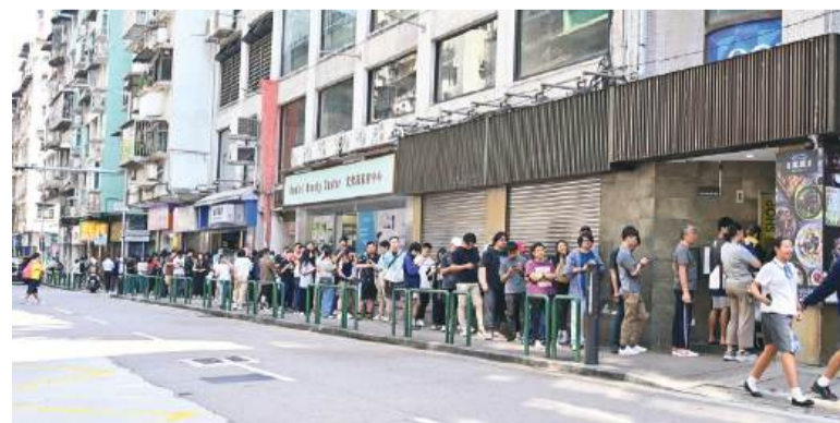
People queue outside Ocean Mall on Avenida do Conselheiro Ferreira de Almeida (澳門肥利喇亞美打大馬路).