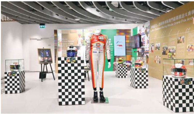
This photo shows some of the exhibits at the "A Racing Legacy – Drivers' Collection Exhibition".