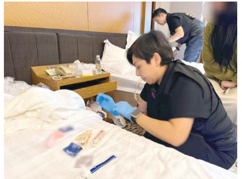
PJ officers searching a hotel room used by the prostitution gang in Zape on Thursday.