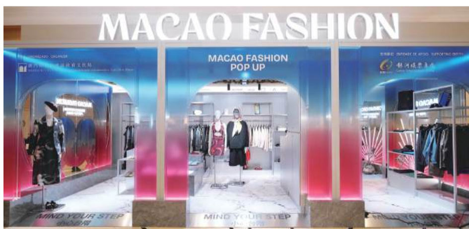
This undated handout photo shows the "Macao Fashion Pop-Up Store" set up at Galaxy Macau's Promenade East.