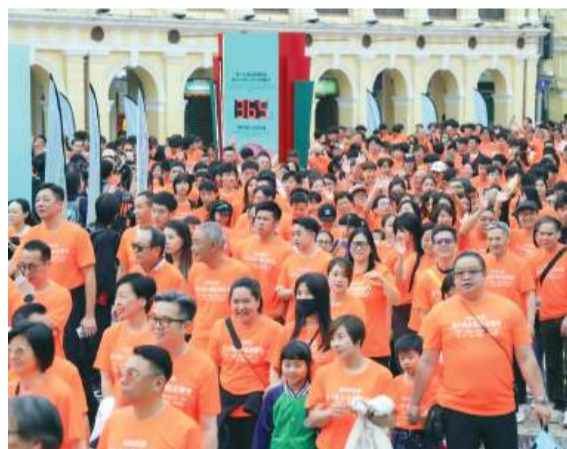
Some 650 people walk through Largo do Senado to celebrate the one-year countdown of the 15 th National Games on Saturday.

In addition, the external display screens at Macau Tower, Fisherman's Wharf and Macau six integrated resorts were illuminated between 8 p.m. and 9 p.m. on Saturday, displaying the message that the Games will be held on November 9 next year, and also started the one-year countdown to the Games. ■