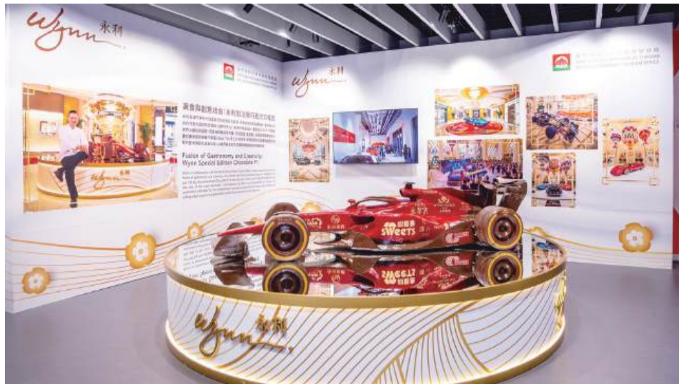
This handout photo taken and provided by the Macau Government Tourism Office (MGTO) shows the Wynn Special Chocolate F1 displayed at the Macau Grand Prix Museum (MGP).