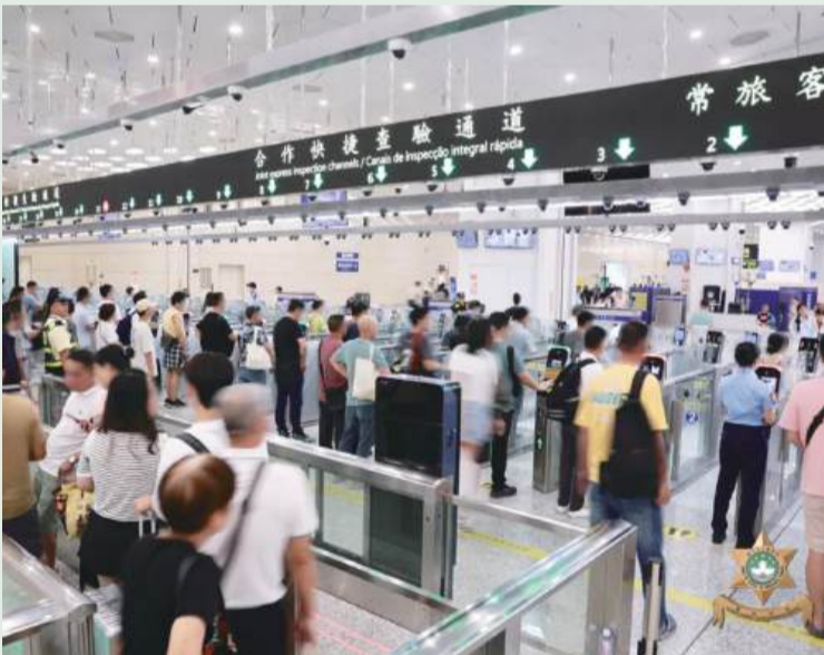
This undated handout photo released by the Public Security Police (PSP) yesterday shows travellers passing through e-channels in the mainland-Macau joint checkpoint in Hengqin.