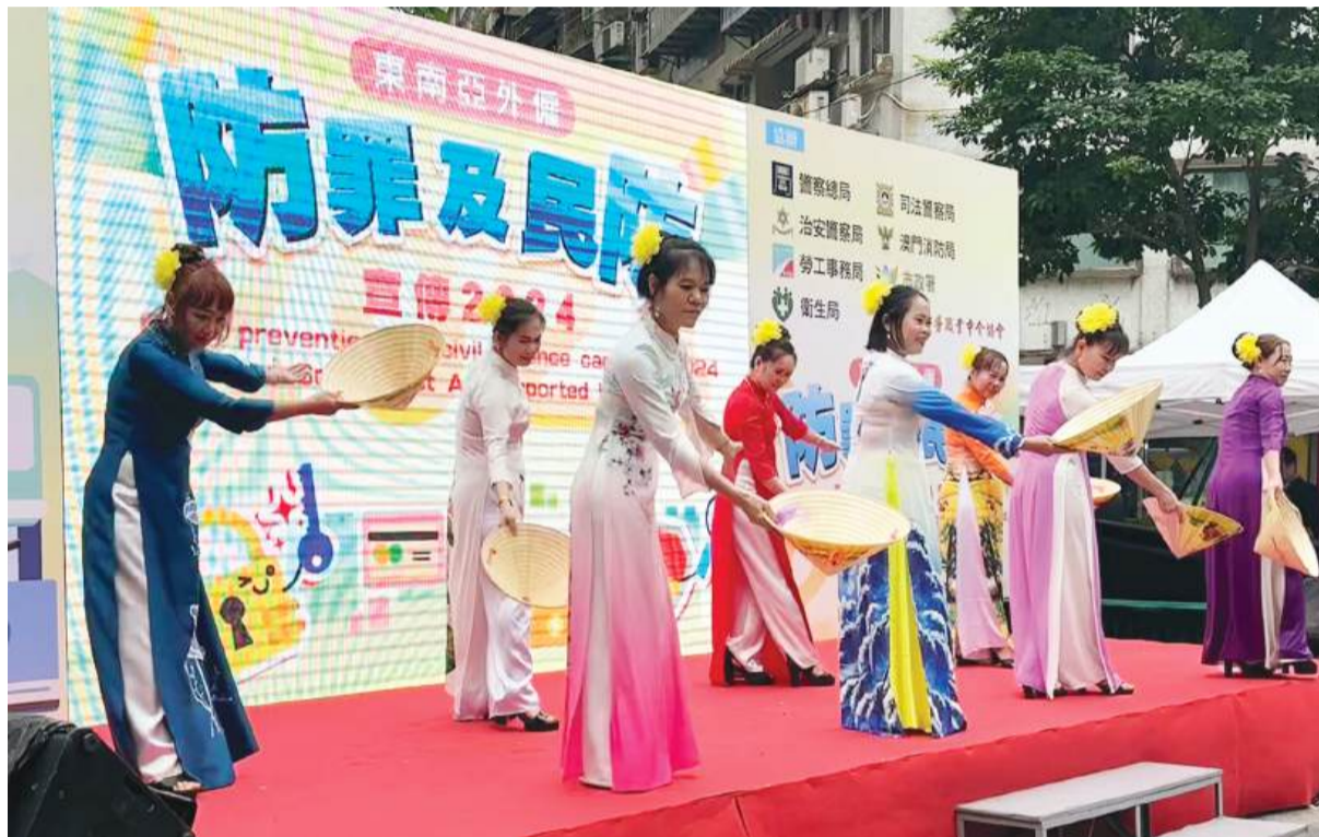
A group of Vietnamese performs during yesterday's awareness-raising campaign at the "Three Lamps" roundabout.