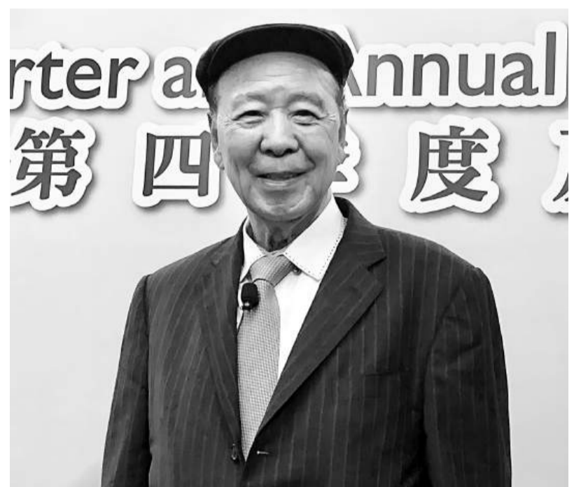
This undated file photo shows Lui Che-woo posing during a company-results-announcement press briefing.

Lui founded StarWorld Hotel in Zape in 2006 as part of a GEG investment project, Wikipedia noted. He was also a pioneer who founded K. Wah Company in 1955, which later became a multinational conglomerate, K. Wah Group. ■