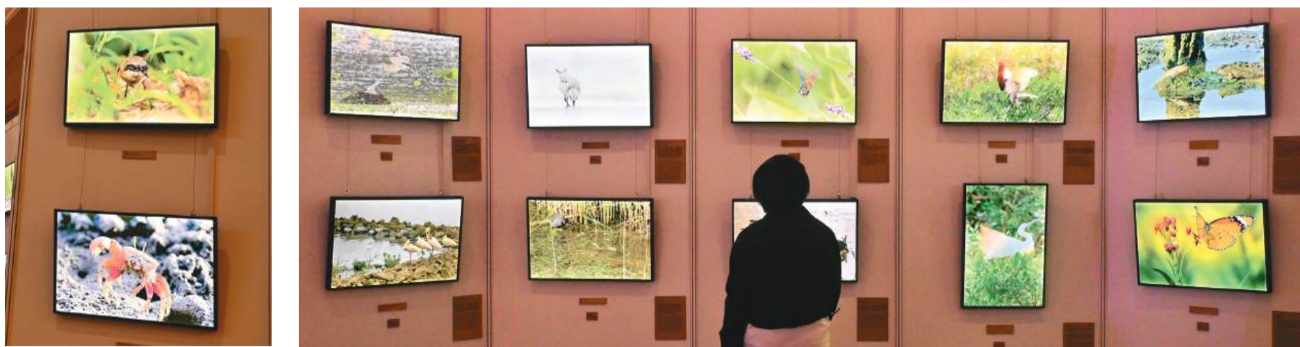
These photos taken on Thursday show the winning works of the recent Wetland Biodiversity Photography competition.

The exhibition is presented by ISE in conjunction with USJ's Department of Media, Art, and Technology at its Faculty of Arts and Humanities. One can view the works from 9 a.m. to 9 p.m.