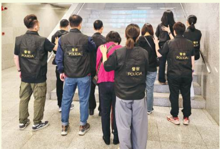
This undated handout photo provided by the Public Security Police (PSP) yesterday shows police officers escorting the suspects to a police station for questioning.