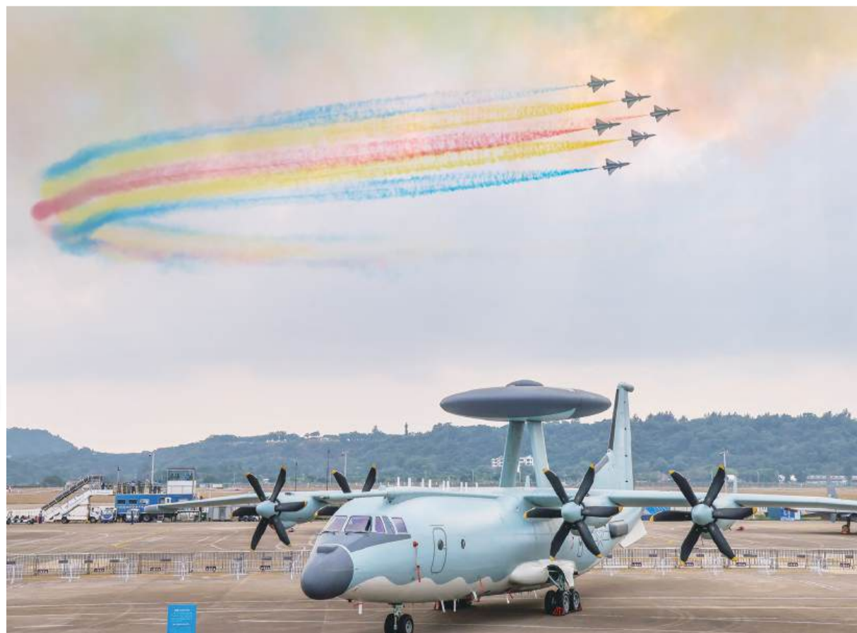
Aircraft of the Bayi Aerobatic Team of the Chinese People's Liberation Army Air Force conduct adaptive training for the Airshow China in Zhuhai yesterday. —Xinhua

In recent years, with the commissioning of large amphibious vessels and various types of carrier-based helicopters, the Navy Marine Corps has enhanced its ability to carry out multidimensional assault operations. —Xinhua