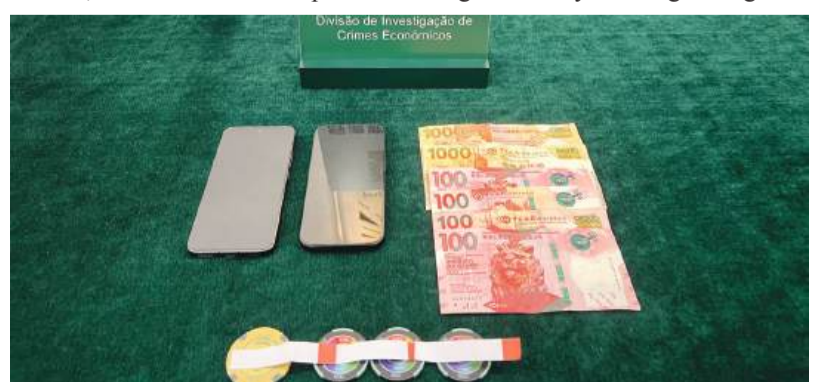
This undated handout photo provided by the Judiciary Police (PJ) yesterday shows the evidence seized from the suspects.