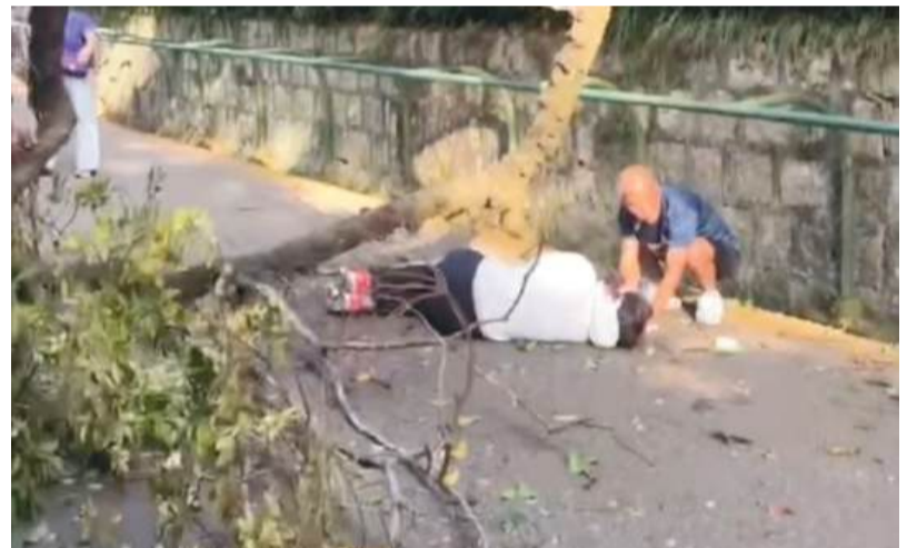
This video grab retrieved yesterday from a clip circulating on social media shows a woman lying on the Guia Hill fitness trail after being struck by a tree limb.

The incident occurred at about 3 p.m. yesterday when a nine-metre-tall tree – known as Sapium discolor (its scientific name) – on Estrada Do Engenheiro Trigo (松山馬路), the CB statement said, adding that the victim was losing consciousness by the time ambulance arrived the scene.