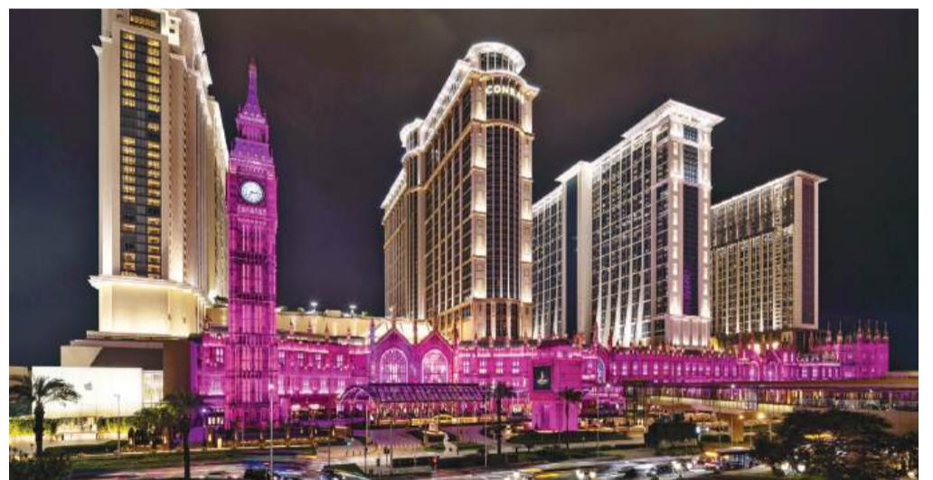
This undated handout photo provided by Conrad Macao yesterday shows The Londoner Macao's façade lit up in pink for the Pink Inspired Campaign.