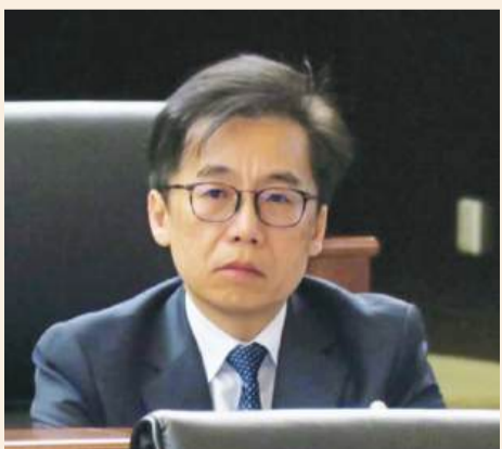
Pharmaceutical Supervision and Administration Bureau (ISAF) Director Choi Peng Cheong attends yesterday's plenary session in the Legislative Assembly's (AL) hemicycle.

Choi also addressed the use of laser devices in beauty salons, noting that while low-frequency lasers can be utilised for non-medical hair removal services, high-frequency lasers for medical procedures like mole or wart removal would be prohibited, adding that the government plans to develop detailed guidelines for beauty salons to ensure compliance. ■