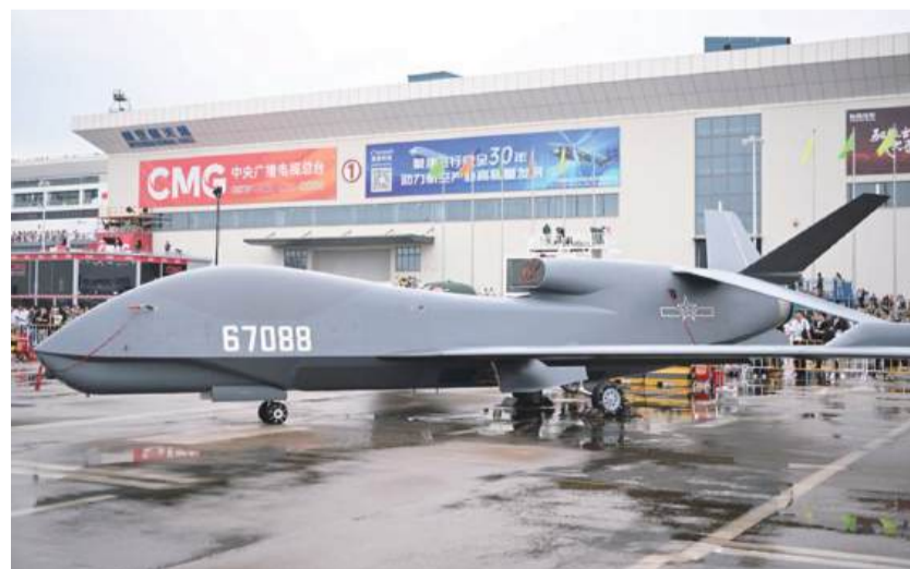
This photo taken yesterday shows a WZ-7 drone on display at the 15th China International Aviation and Aerospace Exhibition in Zhuhai. A number of domestically developed unmanned aerial vehicles (UAVs) and unmanned aerial systems are displayed at the 15th China International Aviation and Aerospace Exhibition, also known as Airshow China. The fair, which opened on Tuesday, ends on Sunday.

The bureau launched a public tender for the 10 company licences in October last year, which drew 40 bids, of which only 21 were accepted. The bureau chose the 10 winners in March this year. ■