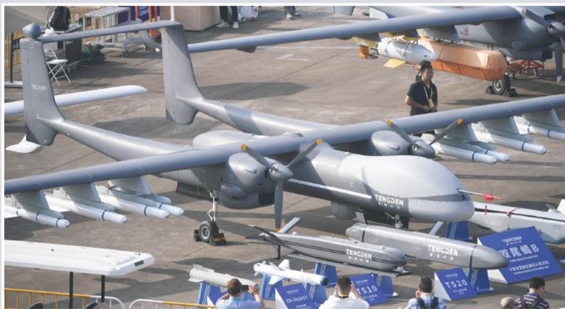
This photo taken on Tuesday shows a Tengden Twin-tailed Scorpion B Double-engine Fixed Wing UAV on display at the 15 th China International Aviation and Aerospace Exhibition in Zhuhai. A number of domestically developed unmanned aerial vehicles (UAVs) and unmanned aerial systems are displayed at the six-day fair also known as Airshow China.

Macau's most popular English-language newspaper – Your trustworthy source of news & views