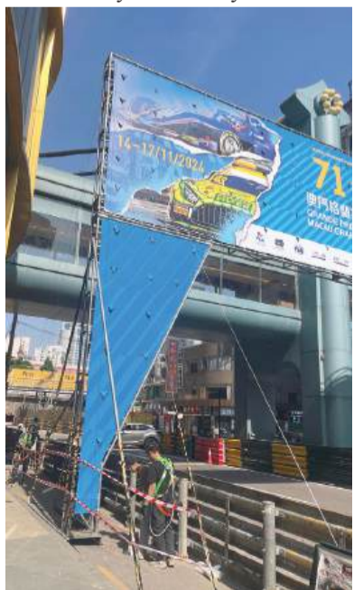
This undated handout photo provided by the Sports Bureau (ID) yesterday shows reinforcement works taking place on the Guia Circuit and its surrounding infrastructure due to a tropical cyclone passing across the South China Sea.

The Sports Bureau (ID) said in a statement yesterday that the Macau Grand Prix Organising Committee (MGPOC), after consulting the Fédération Internationale de l'Automobile (FIA), has determined that the four-day 71 st Macau Grand Prix (MGP) will go on even it the Storm Warning Signal No.3 has been hoisted by the local weather station, with measures in place to ensure everyone's safety.