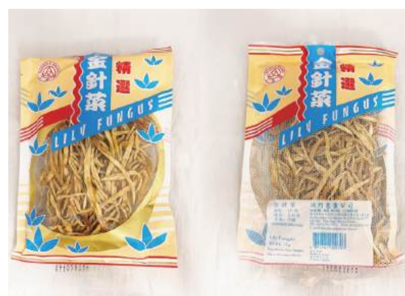
This undated handout photo provided by the Municipal Affairs Bureau (IAM) yesterday shows a Triangle Brand (三角牌) pre-packed lily fungus product found to contain an excessive amount of sulphur dioxide (SO 2 ).

The statement underlined that although most of the SO 2 can be removed from food by washing and cooking, it may still cause a health risk to asthmatic or hypoallergenic people, who could suffer from headache, vomiting or shortness of breath. ■