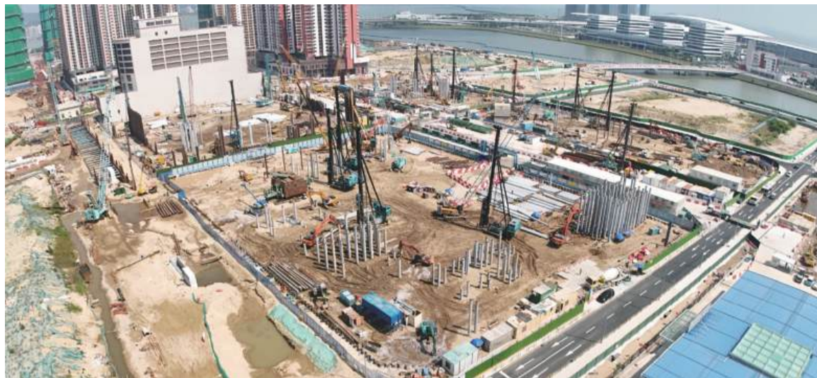
This handout photo taken in September and downloaded from the Public Works Bureau's (DSOP) website yesterday shows the pile foundation work of the HOS project on Plot B8 in Zone A.