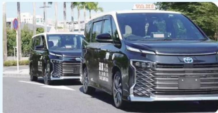
This undated handout photo released by the Transport Bureau (DSAT) yesterday shows two new black taxis.

website, at the end of the last quarter, Macau had a total of 1,520 taxis, comprising 1,220 black taxis and 300 special radio taxis.